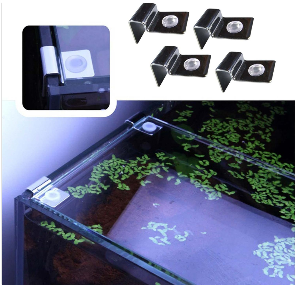
Figure 3: Clips securely holding an aquarium lid in place, providing a clear view of the aquatic environment within the tank.