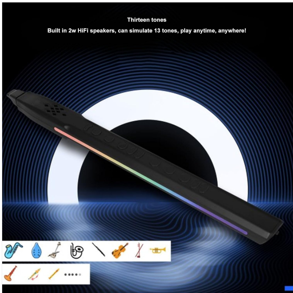
Figure 4: Visual representation of some of the 13 instrument tones that can be simulated by the S55.