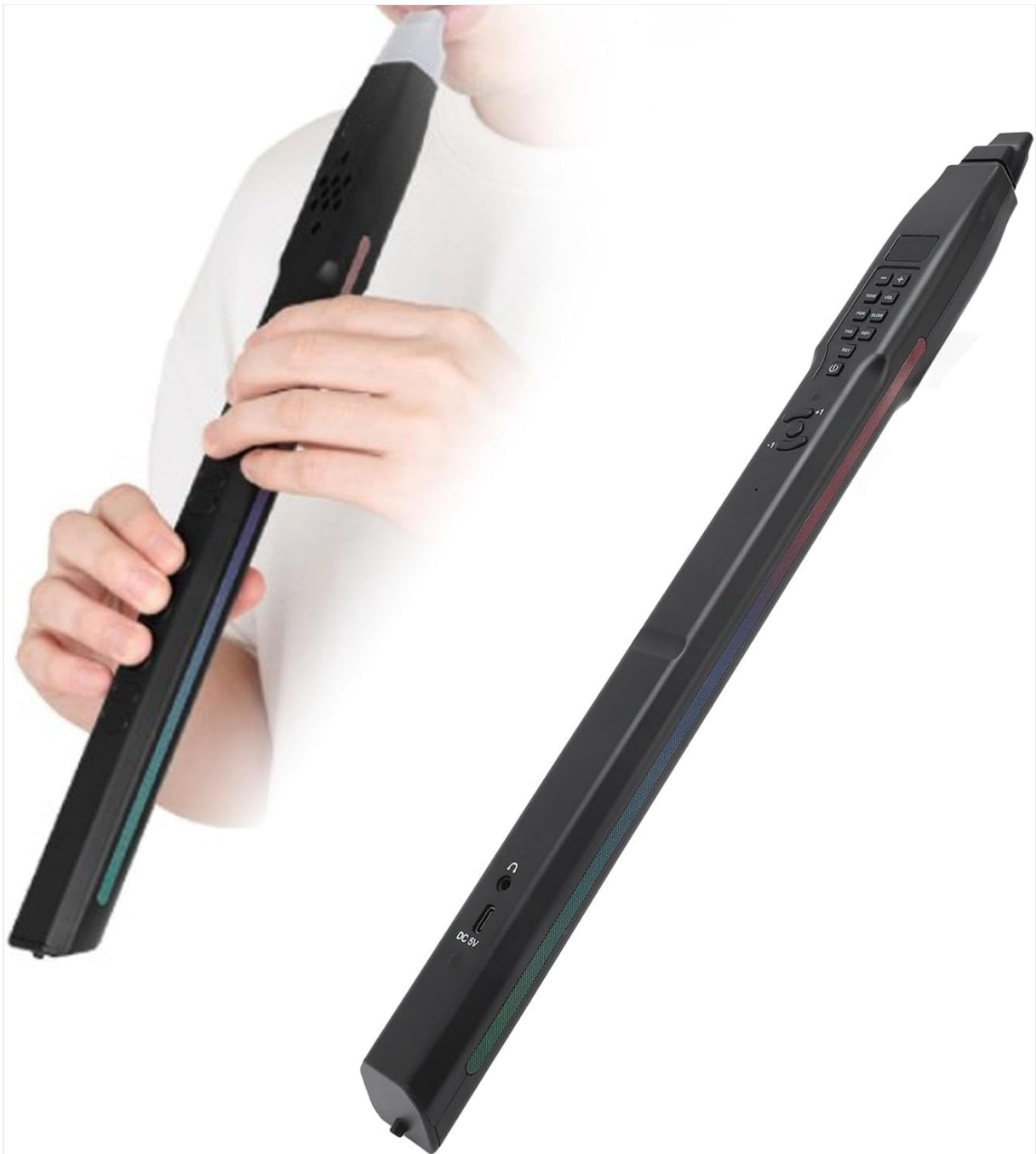
Figure 1: GOWENIC S55 Electronic Wind Instrument, showing its sleek design and a user playing it.