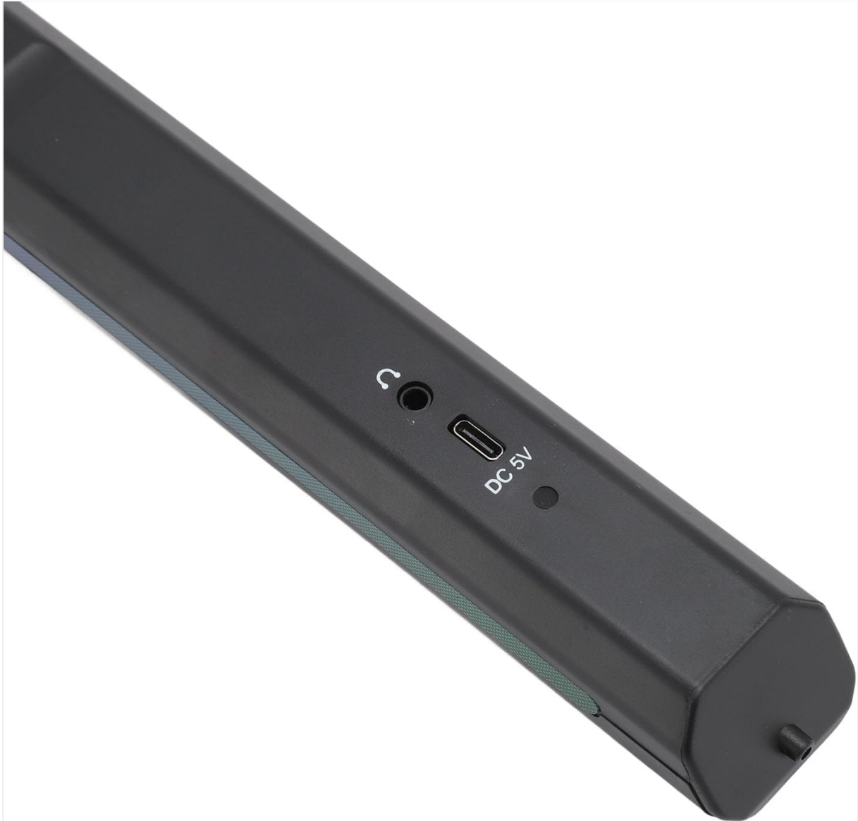
Figure 5: The GOWENIC S55 features an 800mAh lithium battery for extended playing sessions.

The GOWENIC S55 is equipped with a built-in rechargeable lithium battery.