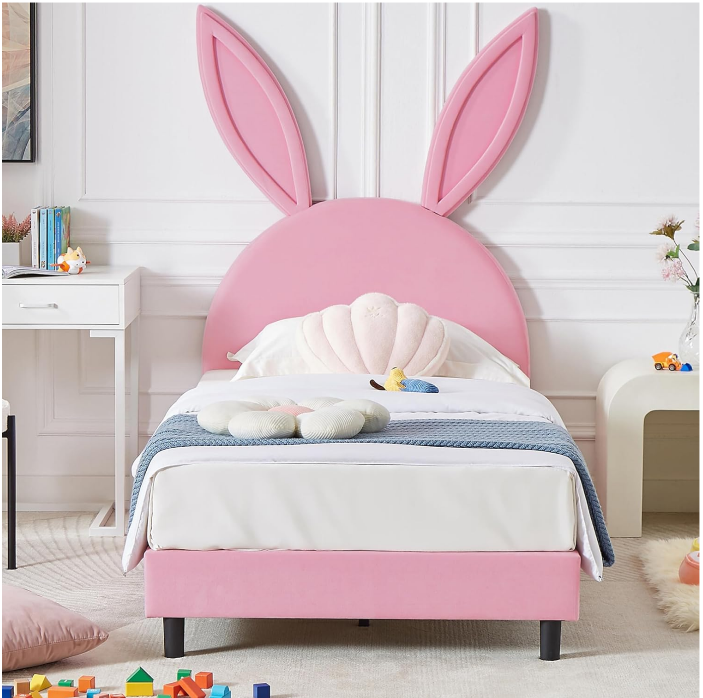
Image: The fully assembled bed frame, ready for a mattress, shown in a child's bedroom setting.