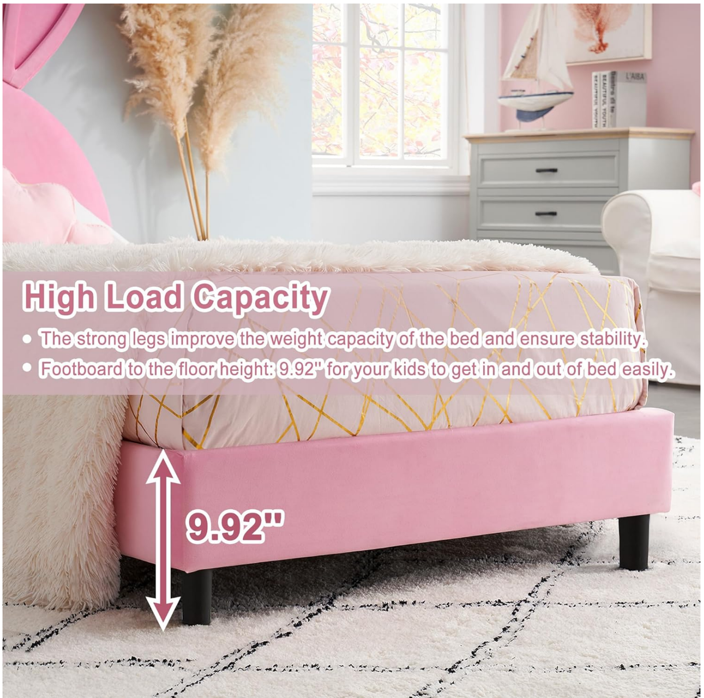
Image: Illustrates the 9.92-inch footboard height and the 650 lbs maximum load capacity.

Your browser does not support the video tag.