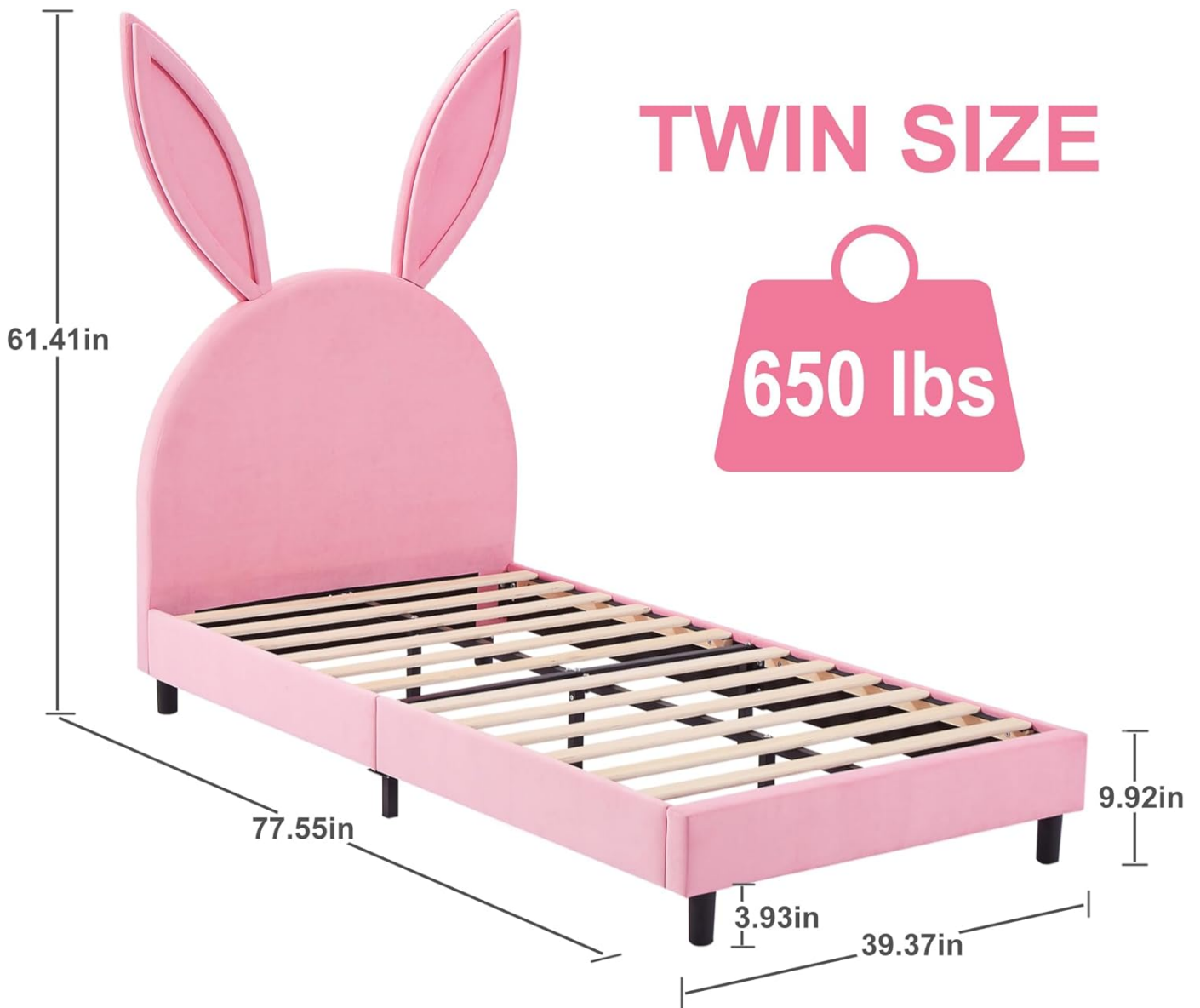
Image: Headboard with attached legs and overall dimensions (77.55"L x 39.37"W x 61.41"H, footboard height 9.92", ground clearance 3.93").