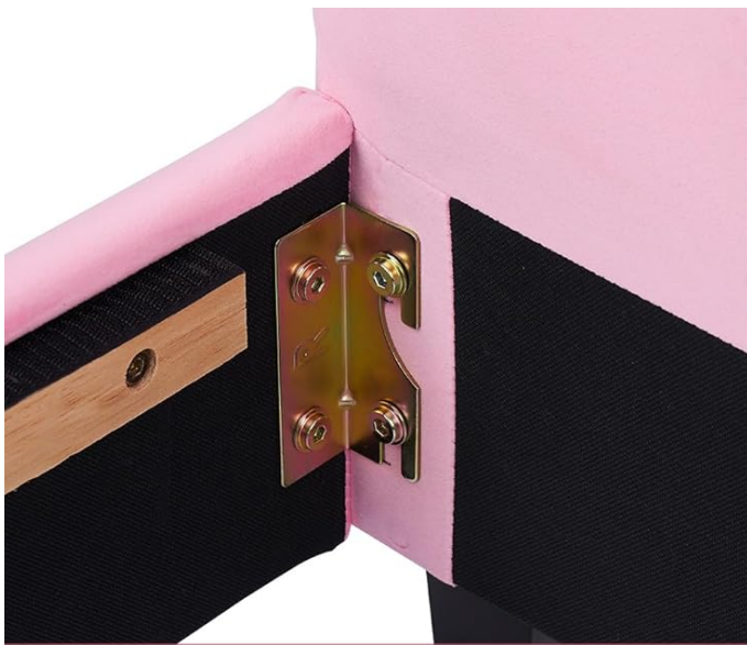
Strong Metal Structure