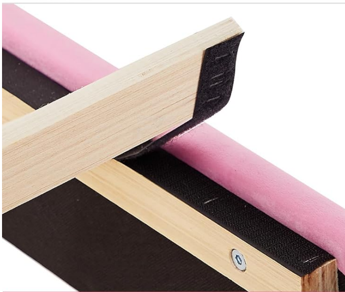
Easy Install with Velcro