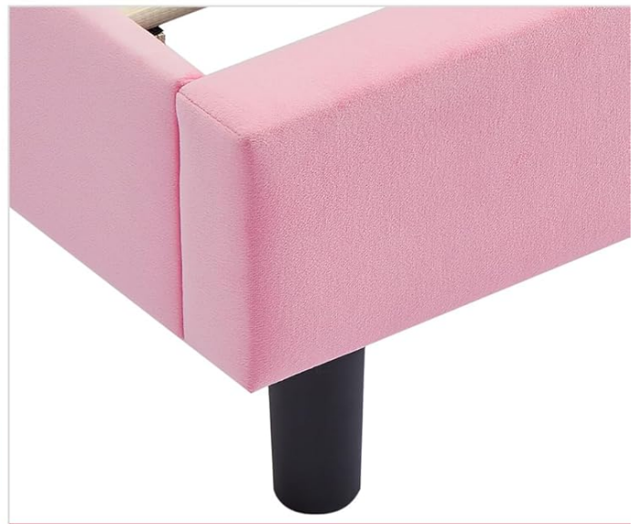
Anti-slip Rubber on Feet

Image: Details of the bed frame construction, including strong metal structure, solid wood slats, easy velcro installation, and anti-slip rubber on feet.