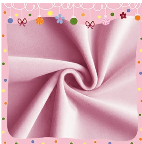
Image: Close-up view of the soft velvet fabric used for the bed's upholstery.