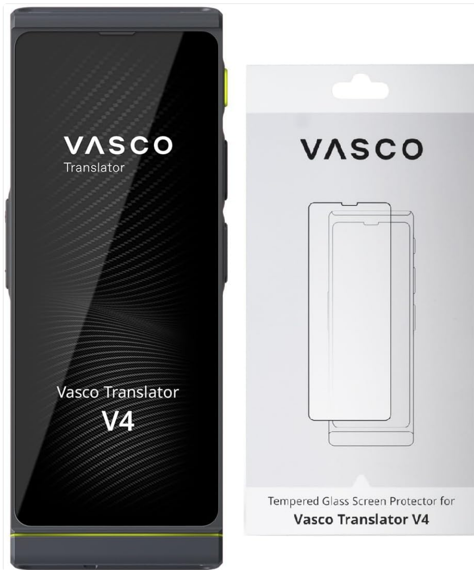
The Vasco V4 Language Translator device shown alongside its tempered glass screen protector packaging.