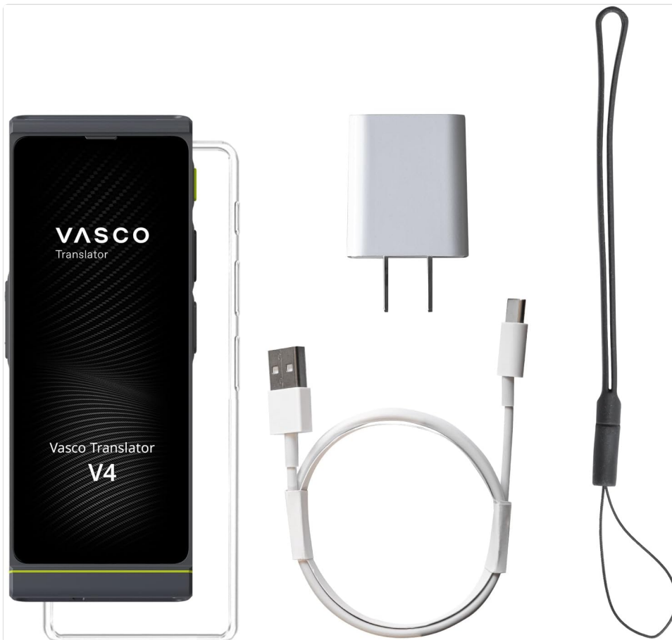
Contents of the Vasco V4 Translator package, including the device, charging accessories, and lanyard.