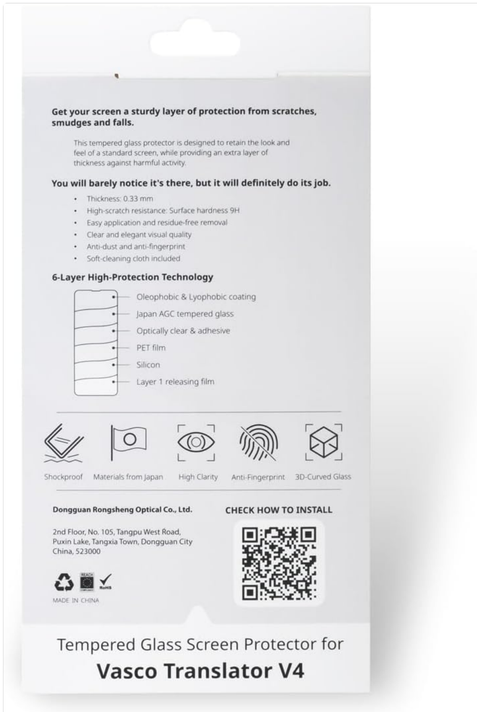
The tempered glass screen protector and the accompanying patch installation/cleaning kit.