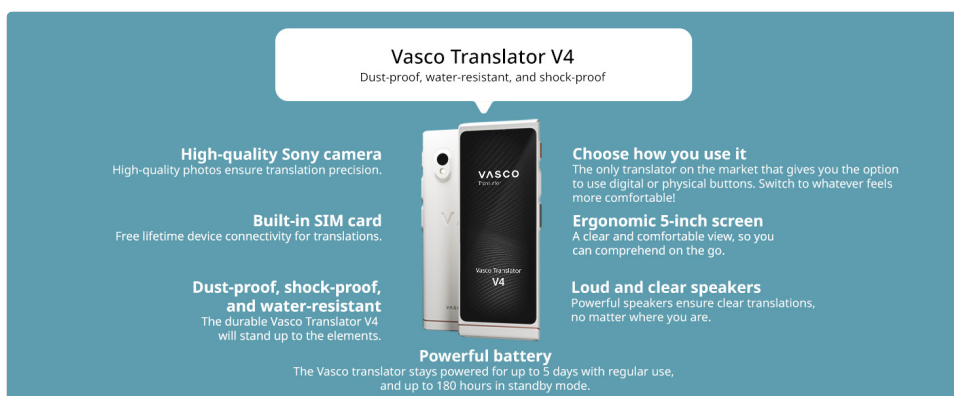
An infographic detailing the robust features of the Vasco V4 Translator, including its camera, built-in SIM, durability, screen,