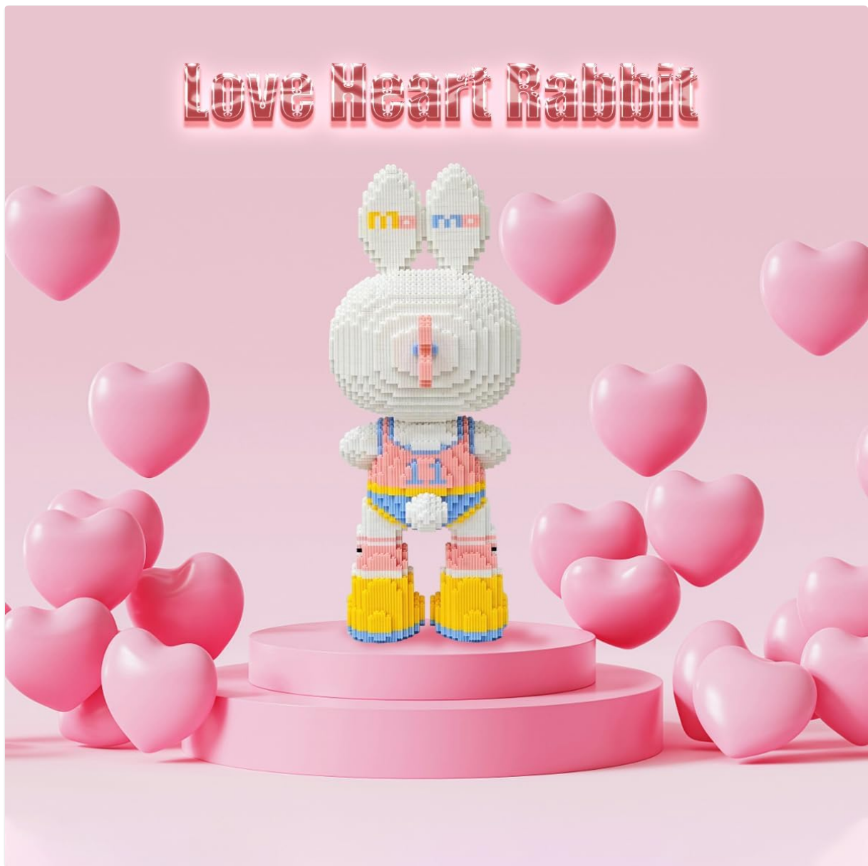
Image 5.3: Back view of the Love Heart Rabbit model, highlighting the decorative wind-up key feature.