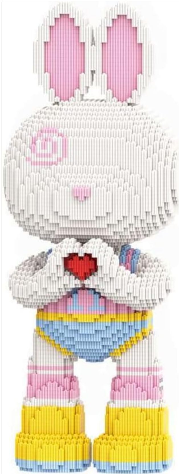
Image 1.1: Fully assembled HONLANCH Animal Love Heart Rabbit Micro Building Blocks Set.