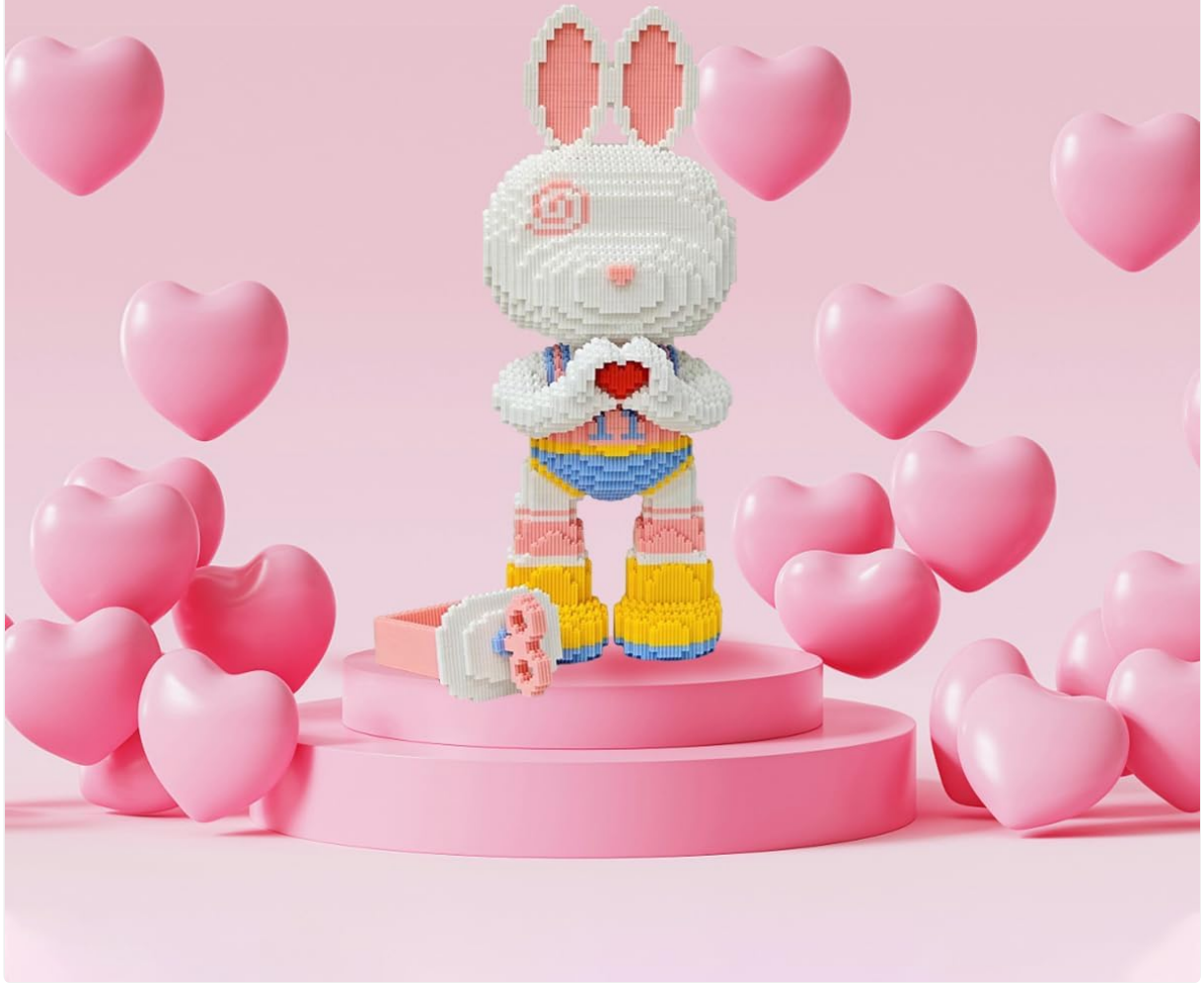
Image 5.2: Front view of the Love Heart Rabbit model, showcasing its design and heart detail.