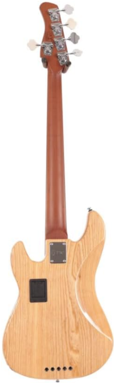
Figure 2.2: Rear view of the SIRE MARCUS MILLER P8-5 bass guitar, highlighting the natural wood grain, neck plate, and the active electronics compartment.