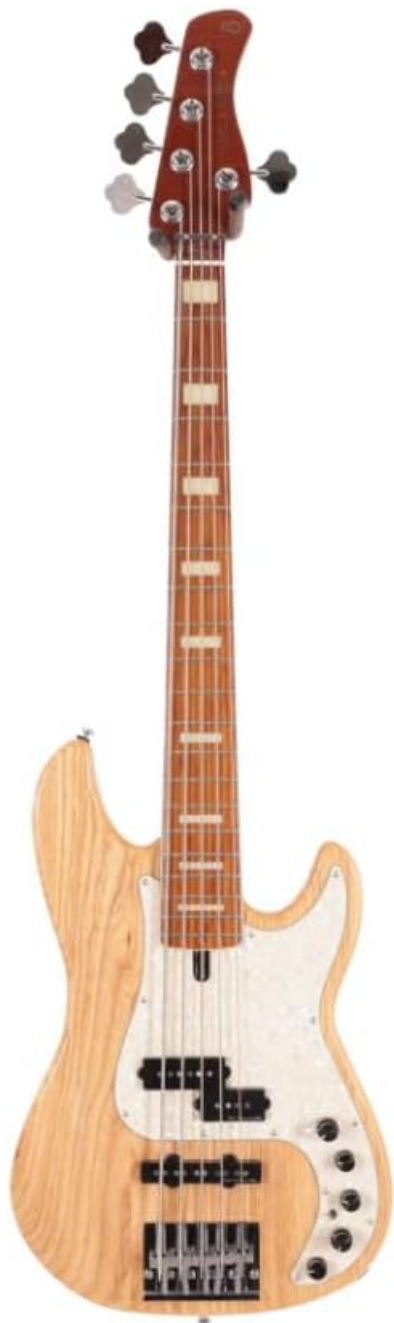
Figure 2.1: Front view of the SIRE MARCUS MILLER P8-5 Natural bass guitar. Note the natural swamp ash body, white pearloid pickguard, and the five-string configuration.