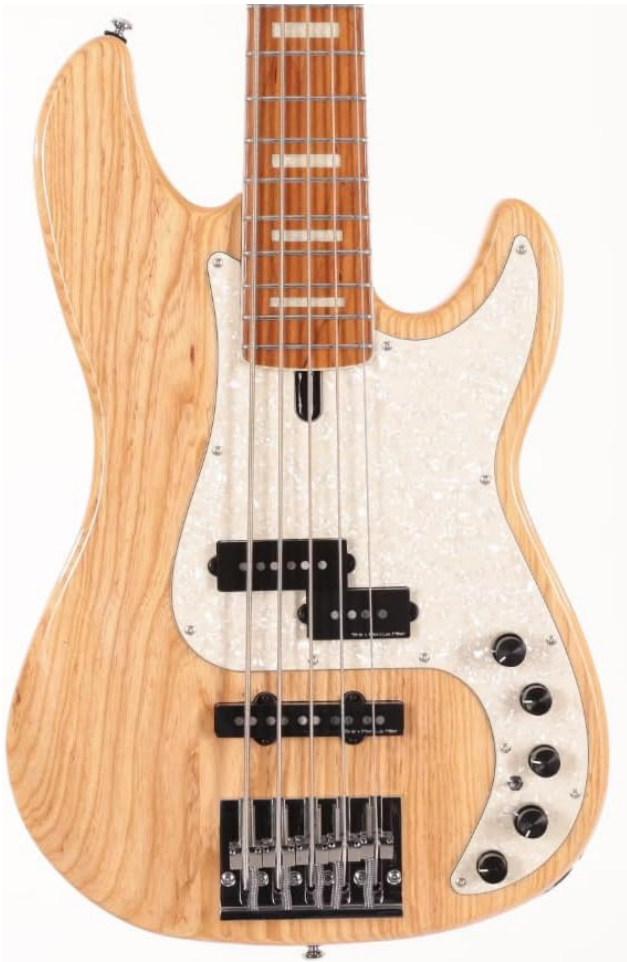
Figure 2.3: Detailed view of the P/J pickup configuration, bridge, and control layout on the body of the bass. This includes volume, tone, and EQ controls.