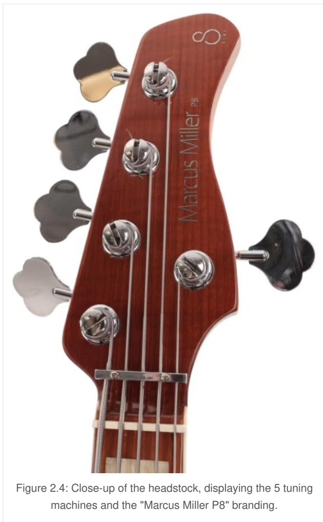
Figure 2.4: Close-up of the headstock, displaying the 5 tuning machines and the "Marcus Miller P8" branding.