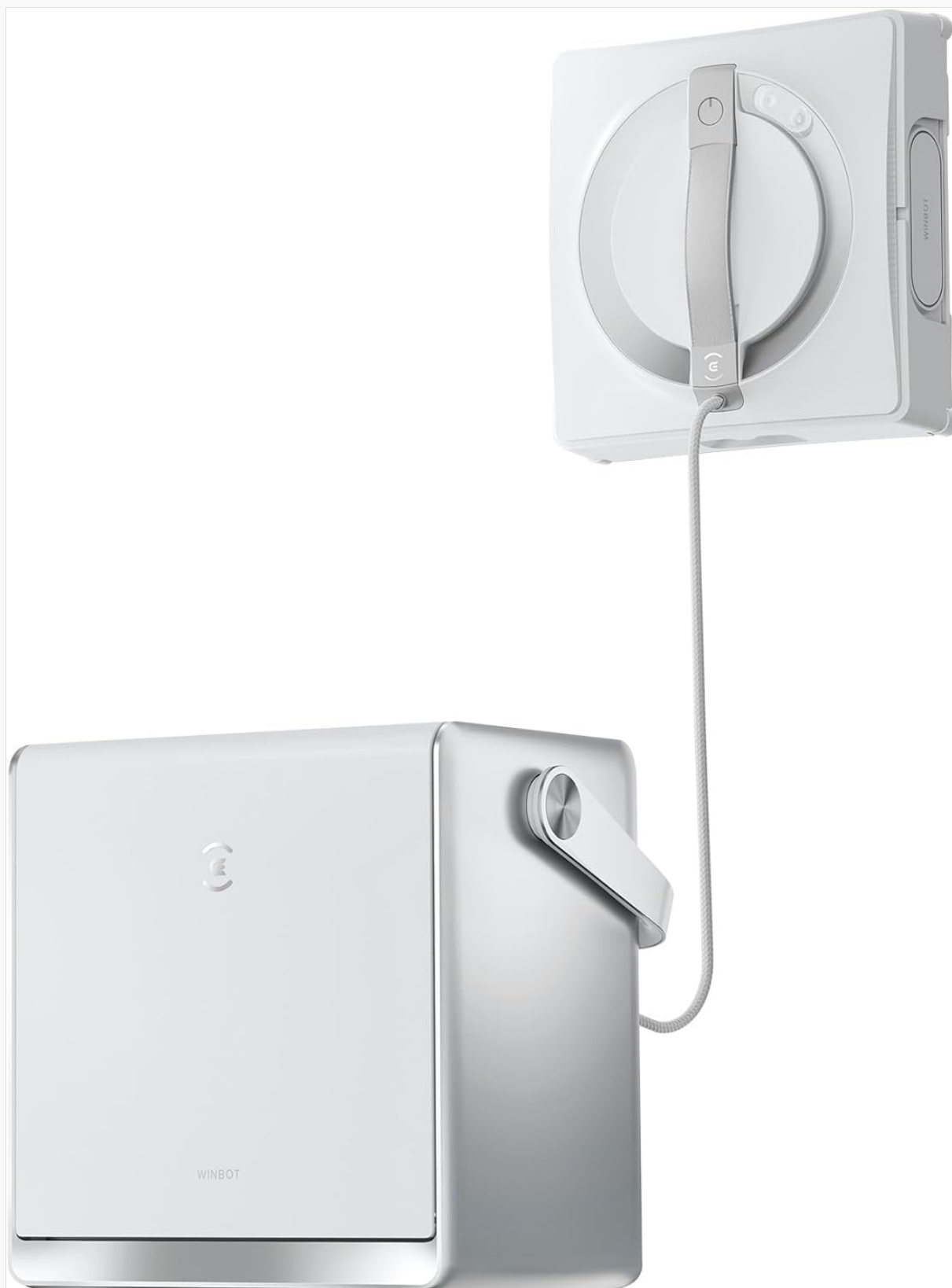
Image: The ECOVACS Winbot W2 Omni robot and its portable station, ready for setup.

Carefully remove all components from the packaging. Ensure you have the OMNI Station, ECOVACS WINBOT robot, Controller, and at least one Wiping Pad.