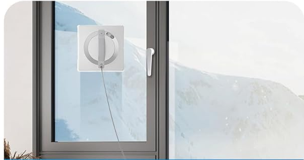
Small sized windows