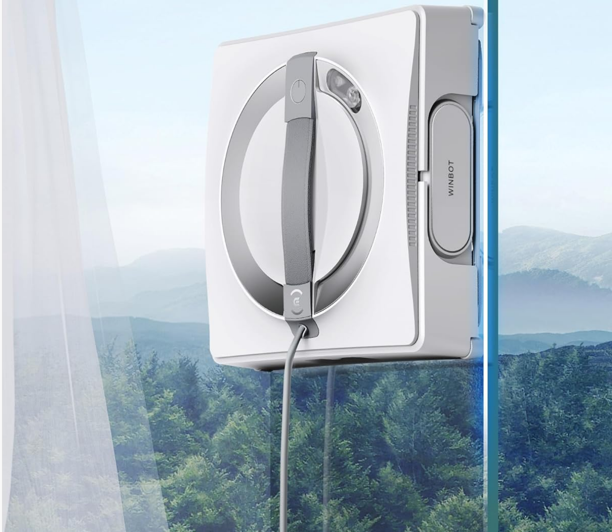
Image: An illustration highlighting the comprehensive 12-tier protection system integrated into the Winbot W2 Omni for user safety.

Enabling the windows to be cleaned thoroughly in all aspects