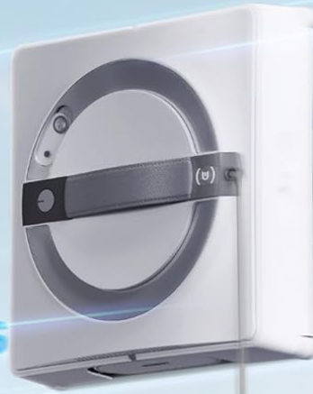
Image: A detailed view of the portable station's control panel, showing power, mode selection, and cable retraction buttons.

30% Cleaning efficiency increased (compared to W1 Pro)