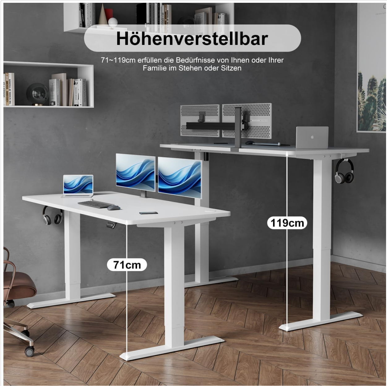
Figure 2.4: An illustration demonstrating the versatile height adjustment range of the desk, from a minimum of 71 cm suitable for sitting to a maximum of 119 cm for comfortable standing.

71~119cm erfüllen die Bedürfnisse von Ihnen oder Ihrer Familie im Stehen oder Sitzen