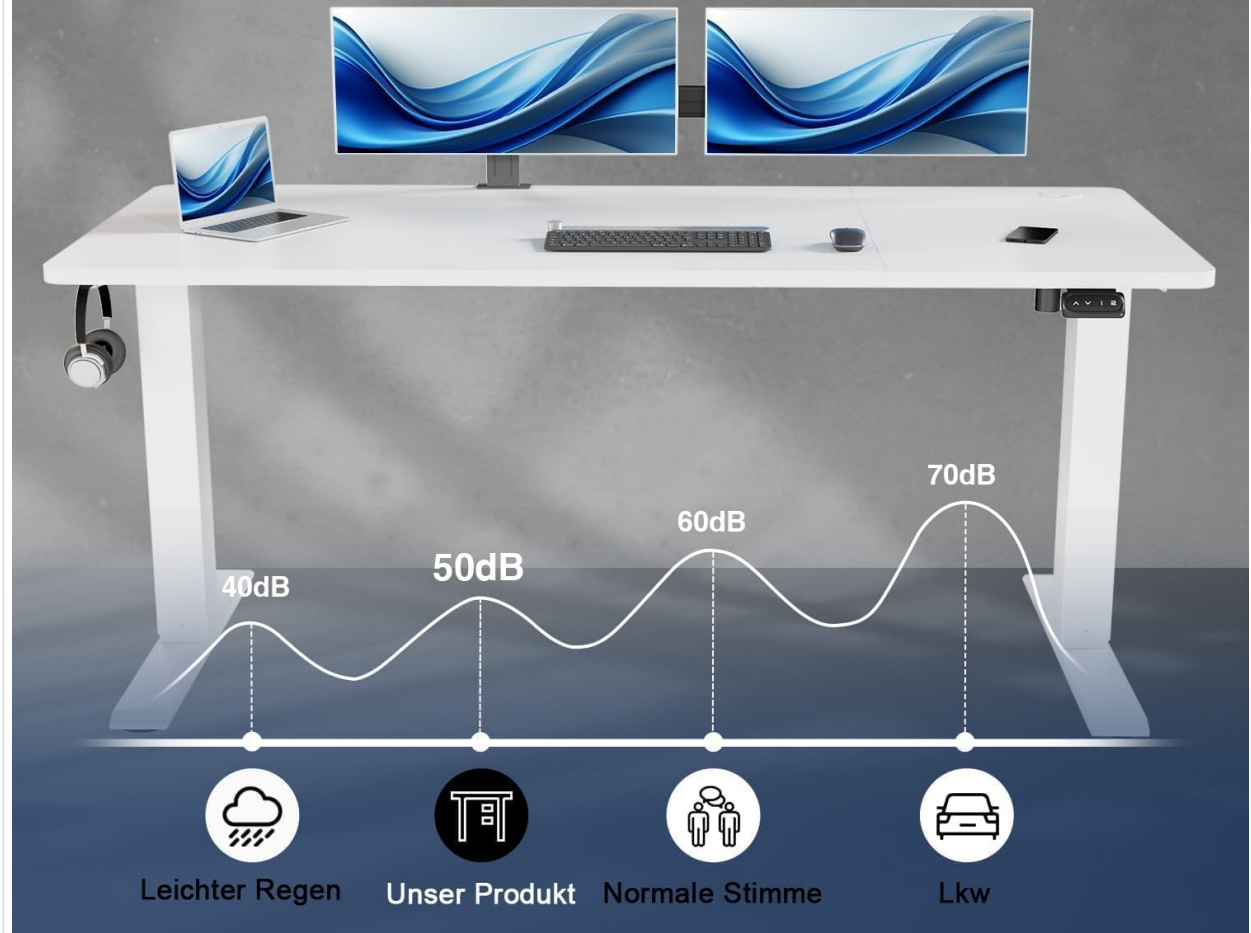
Figure 2.6: A comparative graphic illustrating the desk's quiet operation, with a noise level below 50 dB, comparable to light rain and significantly quieter than normal conversation or truck noise.