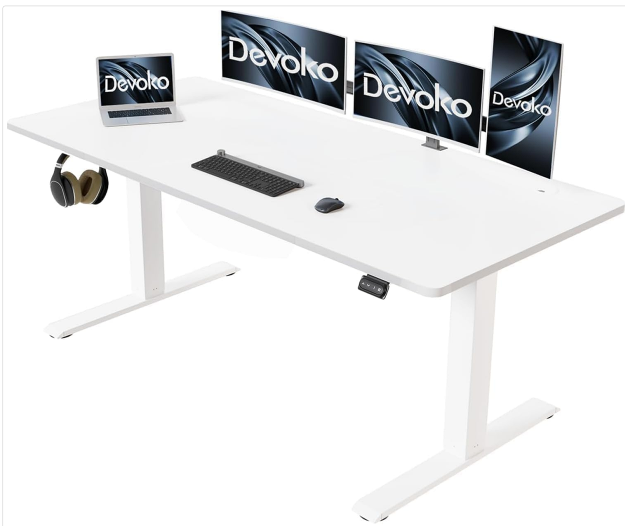
Figure 2.1: Overall view of the Devoko height-adjustable desk in white, showcasing its spacious surface and clean design with multiple monitors, a laptop, keyboard, mouse, and headphones.

The desk consists of a sturdy metal frame, a multi-part tabletop, an electric motor system, a control panel, and various accessories for assembly and cable management.