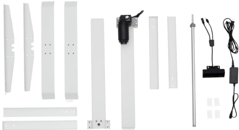
Figure 3.1: An exploded view showing all components of the height-adjustable desk, including the three-part tabletop, frame elements, motor, and control unit. A warning advises checking the parts list before installation.