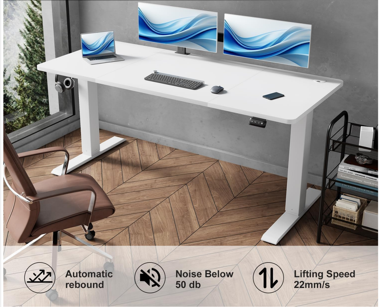
Figure 2.2: The desk in a modern office setting, illustrating its intuitive design and key performance metrics: automatic rebound for safety, noise level below 50 dB for quiet operation, and a lifting speed of 22mm/s.

Geräuscharmer Betrieb, ultrastarke Bauqualität, und intelligente Funktionen.