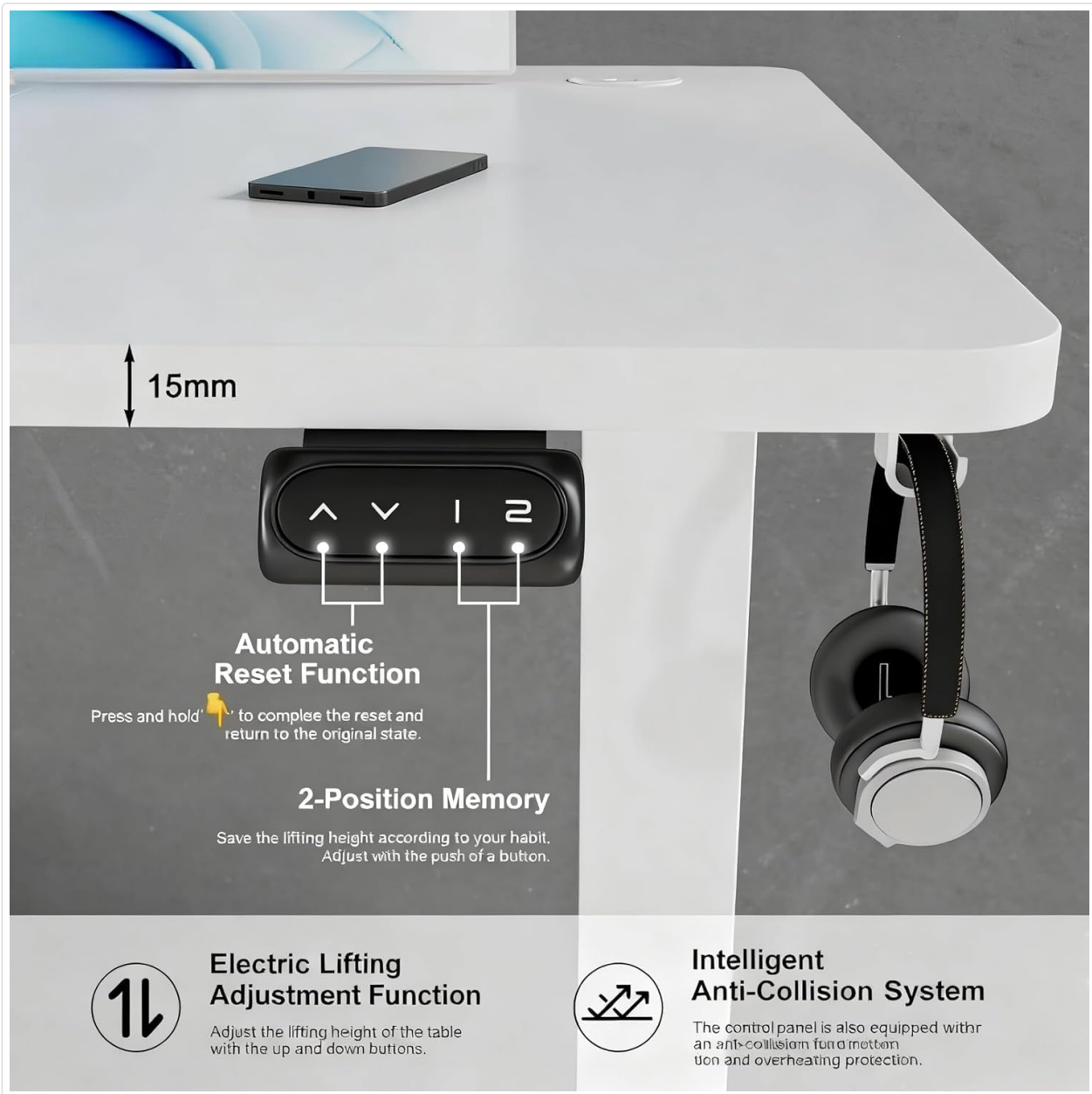
Figure 2.3: A detailed view of the desk's control panel, featuring up and down adjustment buttons, two memory preset buttons (1 and 2), and an automatic reset function. It also highlights the intelligent anti-collision system for enhanced safety.