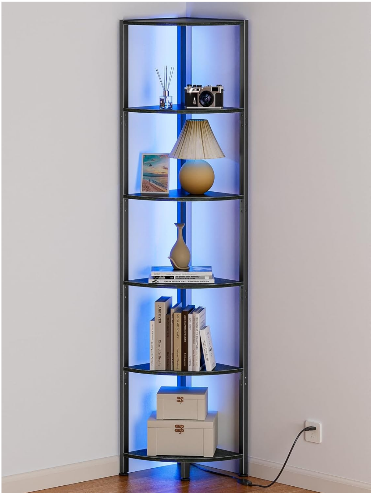
Image: The Furnulem 6-Tier Corner Shelf with its integrated blue LED lighting, showcasing various items on its shelves.