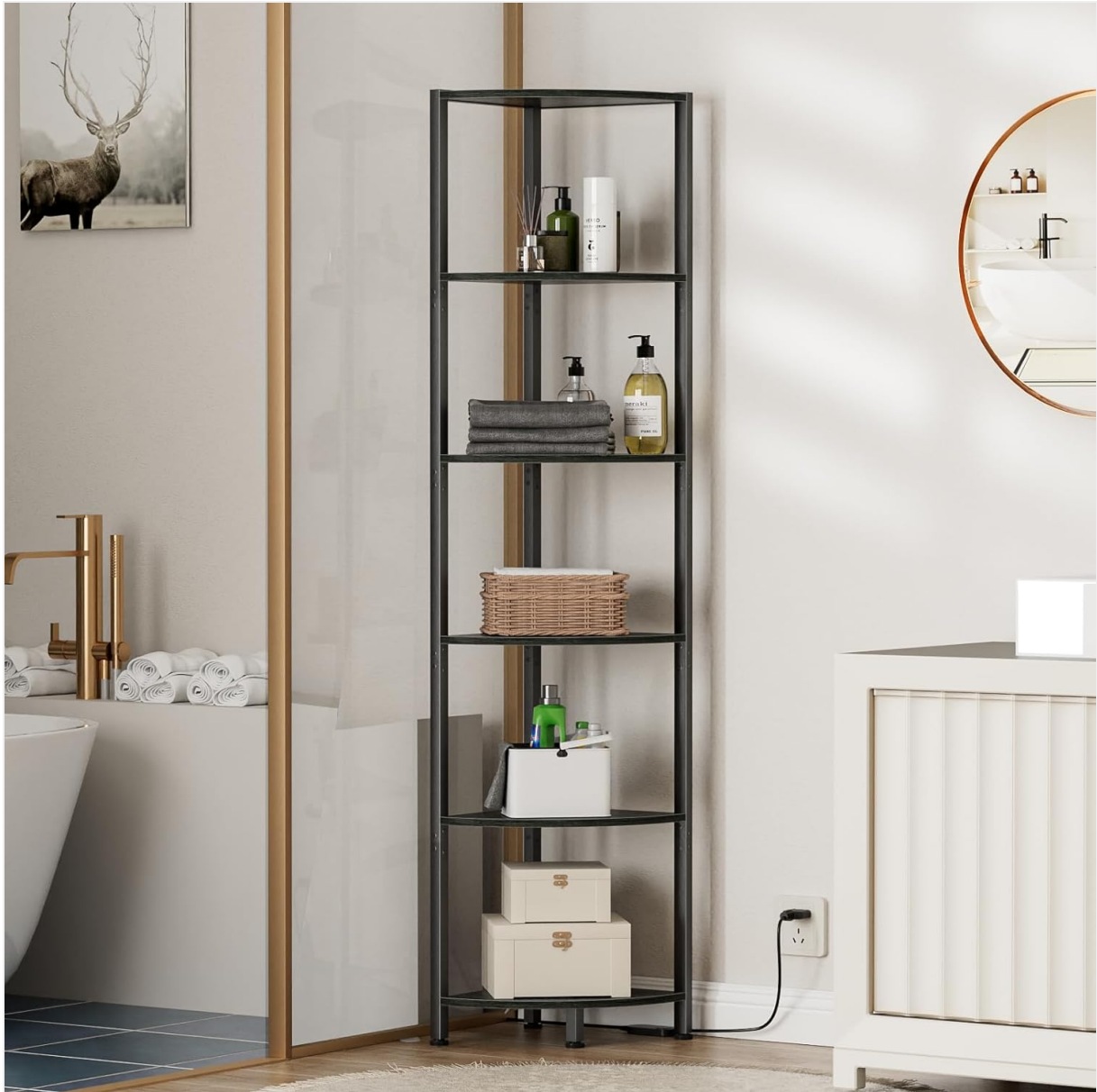
Image: The corner shelf showcasing its LED strip capable of displaying multiple colors, illustrating the customizable lighting options.