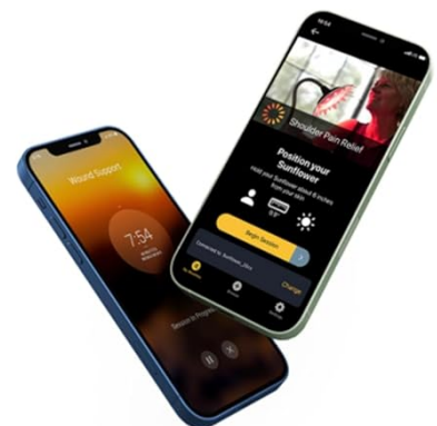
Image: The JustLight Sunflower app displaying a list of 11 different precisely dosed routines for various body parts and wellness goals.

To learn more about a specific routine, simply tap on it to view information on its recommended dosing and the scientific research supporting its benefits.