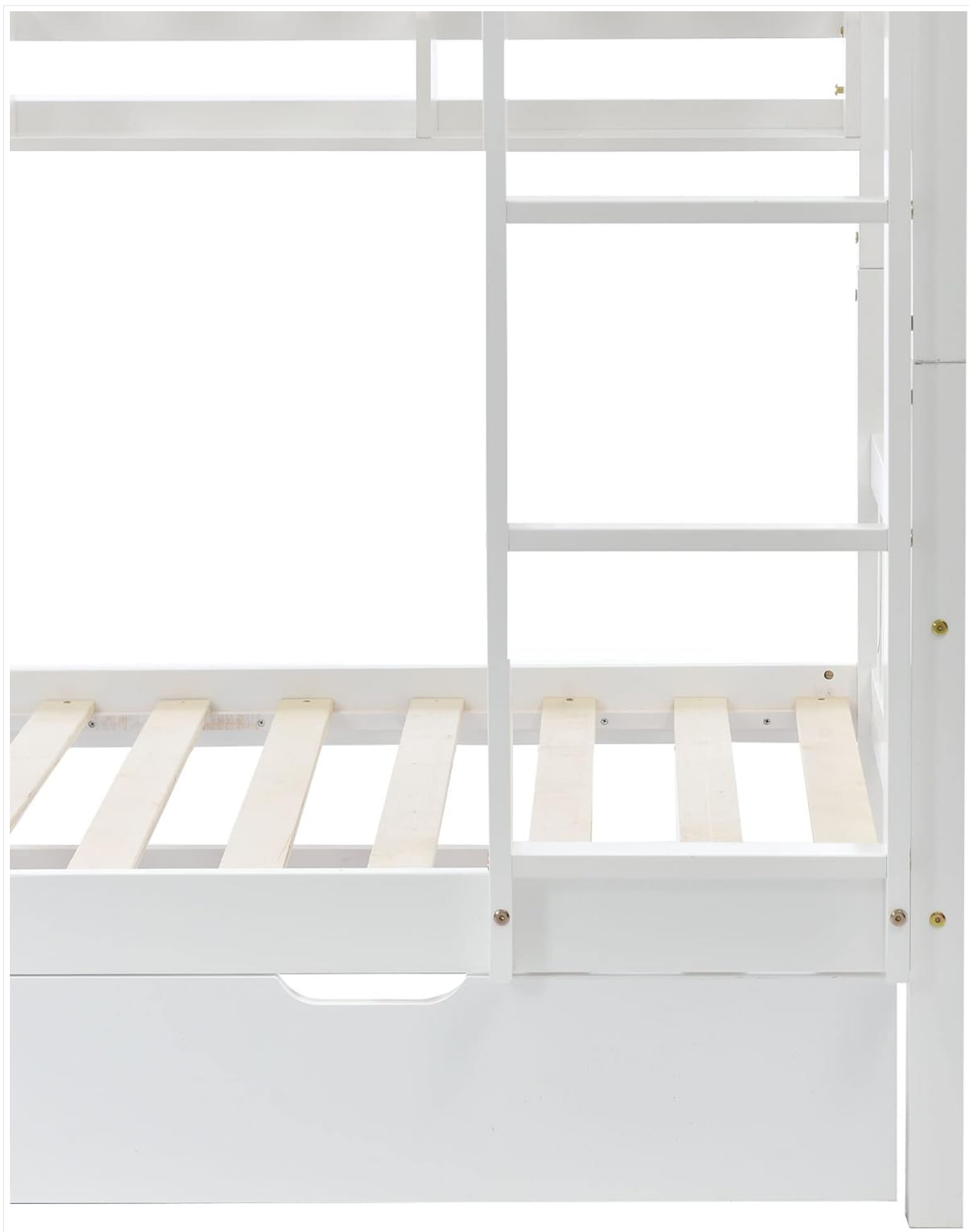
Figure 3: A close-up view of the Moimhear Bunk Bed's 3-level ladder and the sturdy side rail of the lower bunk. This highlights the construction and the secure attachment points for the ladder.