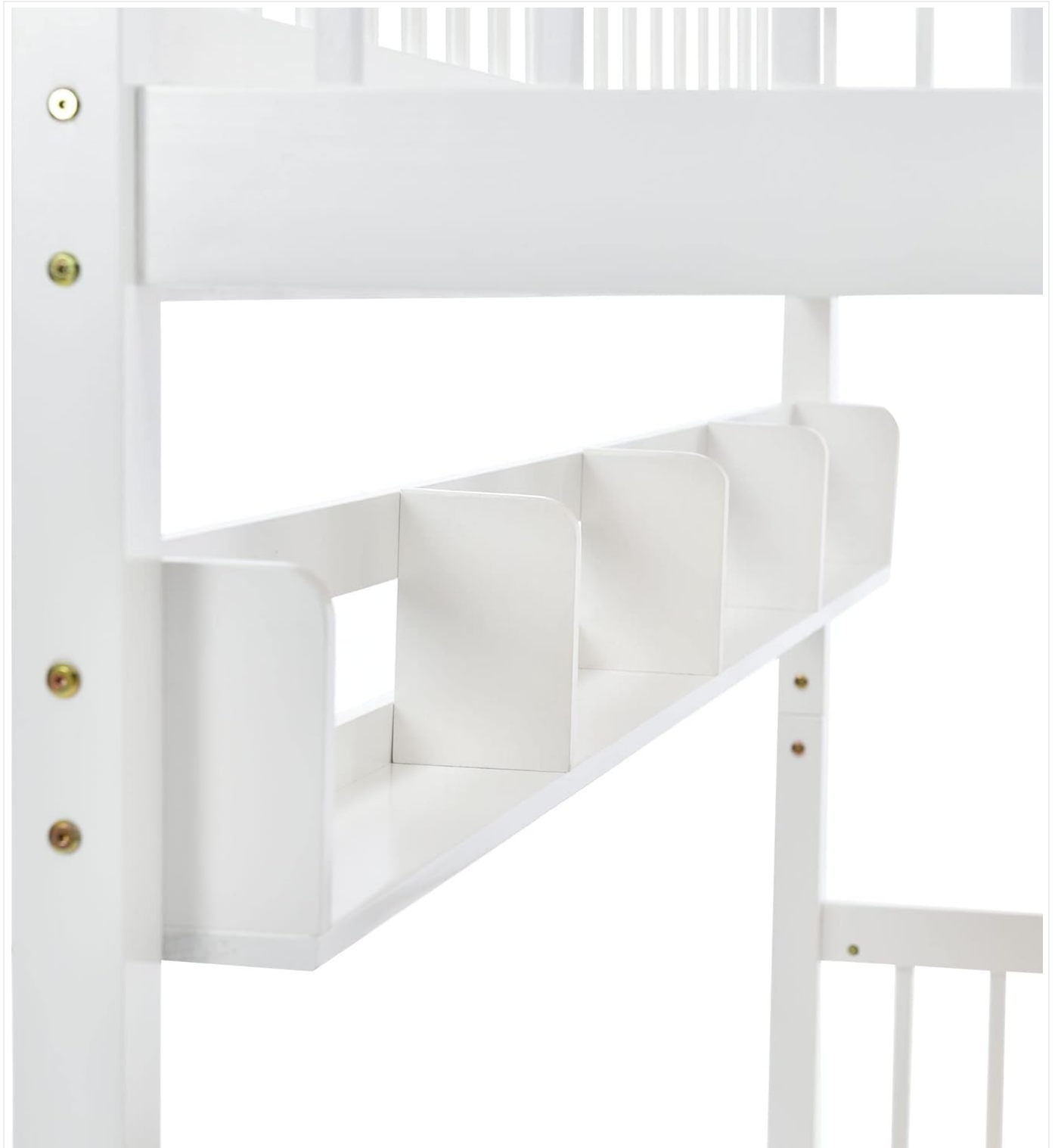
Figure 4: A detailed view of the integrated shelves positioned beneath the upper bunk of the Moimhear Bunk Bed. These shelves offer convenient storage for books, small toys, or decorative items.