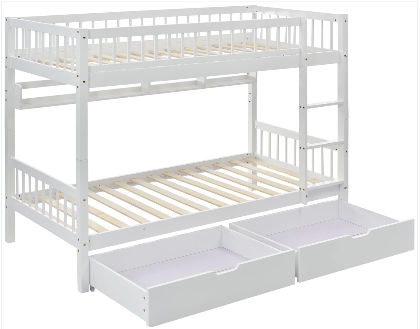
Figure 2: The Moimhear Bunk Bed frame in white, showcasing the slatted bed bases and the two integrated storage drawers at the bottom. This image illustrates the bed's structure prior to adding mattresses and bedding.