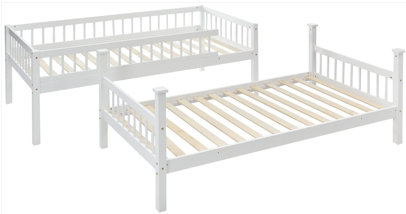
Figure 5: The Moimhear Bunk Bed disassembled and configured as two separate single beds. This demonstrates the product's versatility and ability to adapt to changing needs or room layouts.