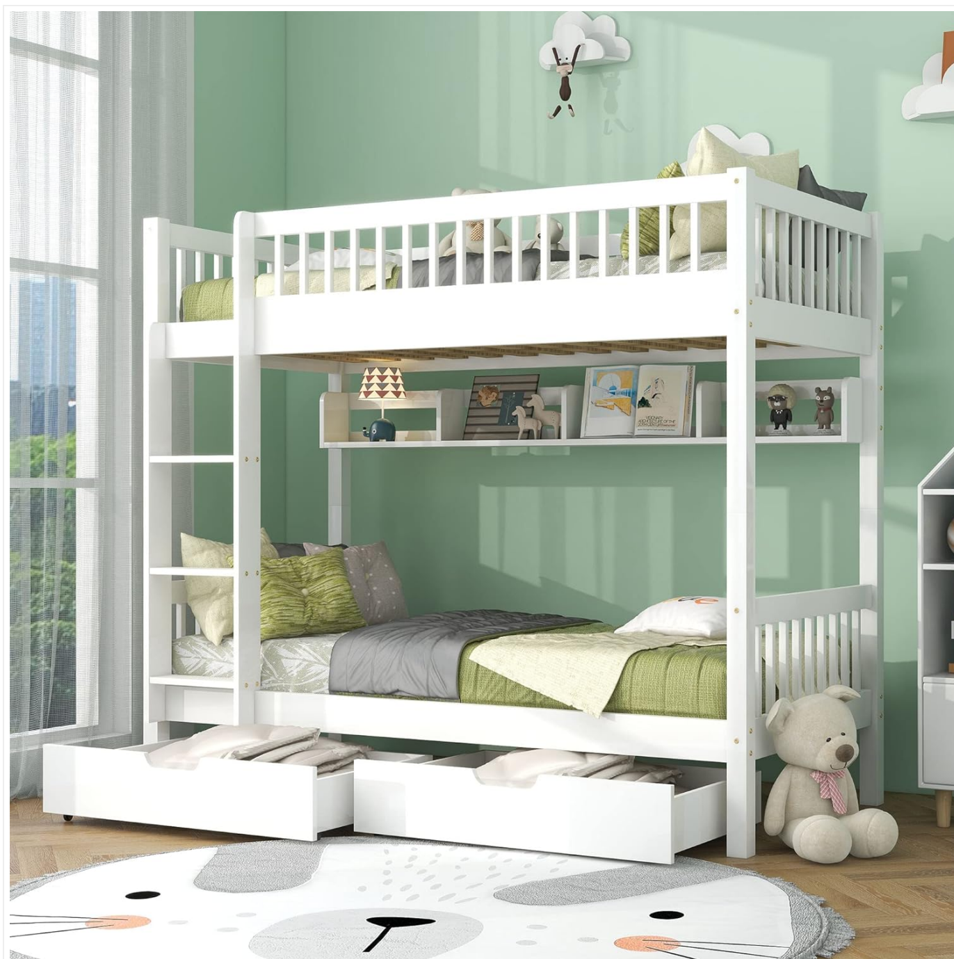
Figure 1: The Moimhear Bunk Bed (Model 31911901) in a white finish, featuring a 3-level ladder, integrated shelves, and two pull-out storage drawers. The bed is shown in a child's bedroom with green walls and decorative elements.