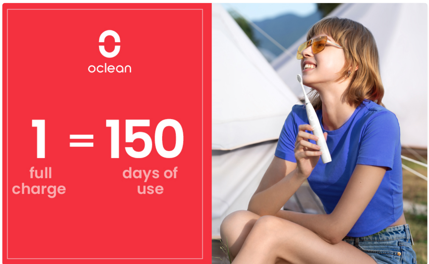
Image 4: Extended battery life of 150 days on a single full charge.