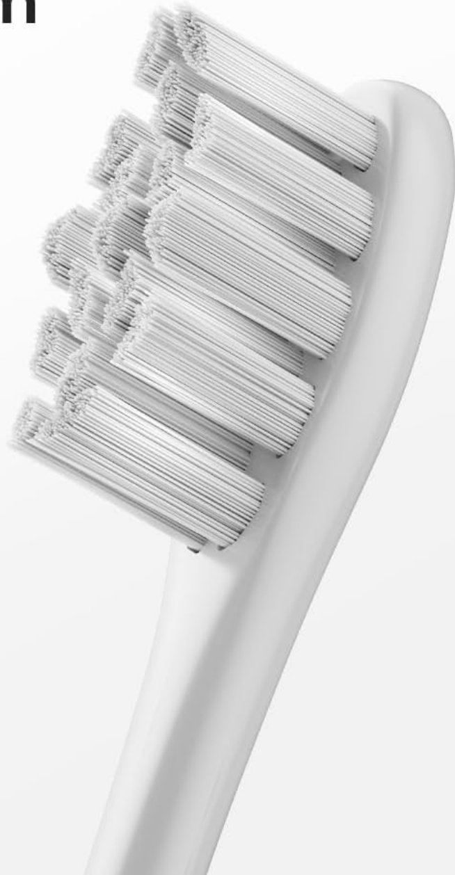
Image 8: High-density DuPont bristles for effective yet gentle cleaning.