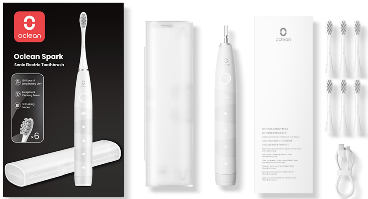
Image 2: All components included in the Oclean Electric Toothbrush package.