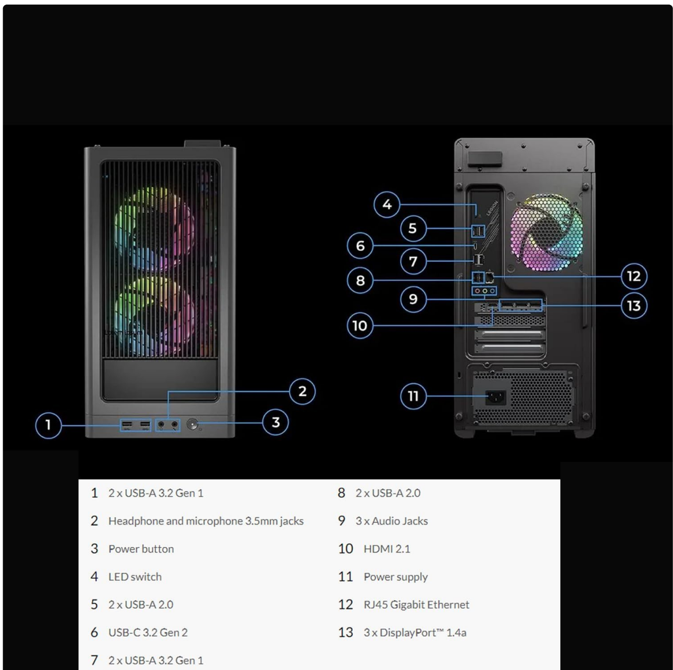
Image: Diagram illustrating the front and rear ports of the Lenovo Legion T5 desktop.

Familiarize yourself with the various ports and components of your Lenovo Legion T5 desktop.