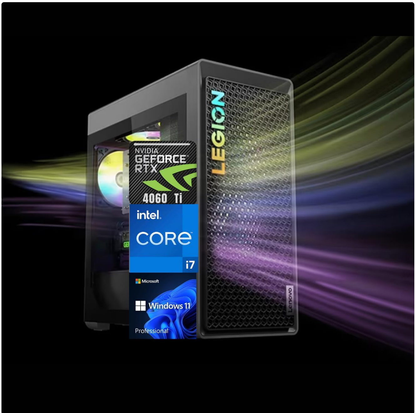
Image: Front view of the Lenovo Legion T5 Gaming Desktop, showcasing its sleek black chassis with RGB lighting accents and the Legion branding.