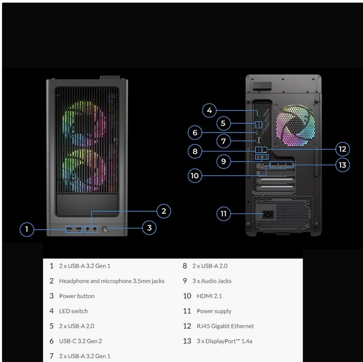
Detailed diagram of front and rear ports.