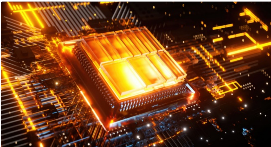
Illustration of the Intel Core i7-13700F Processor.