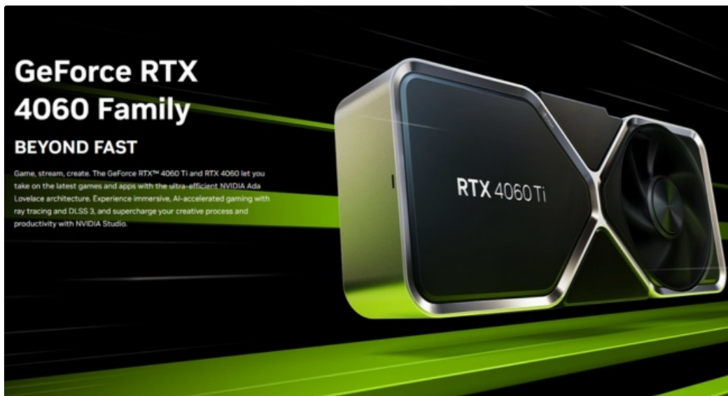
Illustration of the NVIDIA GeForce RTX 4060 Ti Graphics Card.