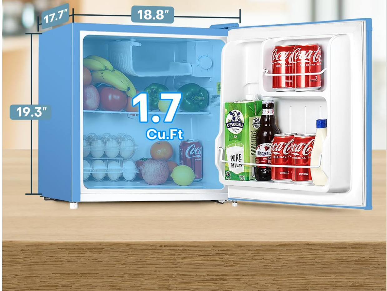
Image: The interior of the mini fridge, showcasing its 1.7 cubic feet capacity filled with drinks, fruits, and other small items.