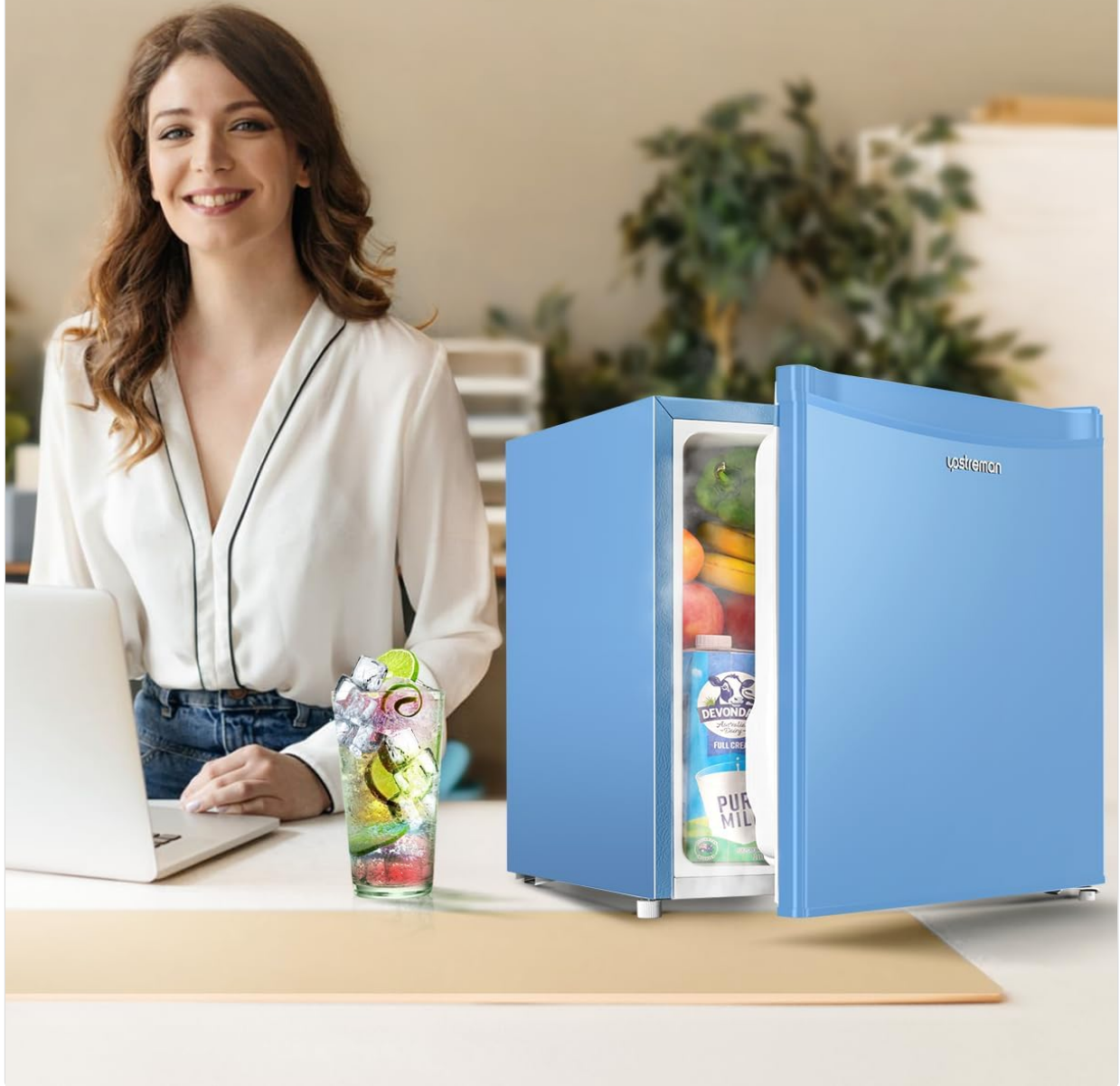
Image: The Upstreman mini fridge seamlessly integrated into different environments, highlighting its versatility.