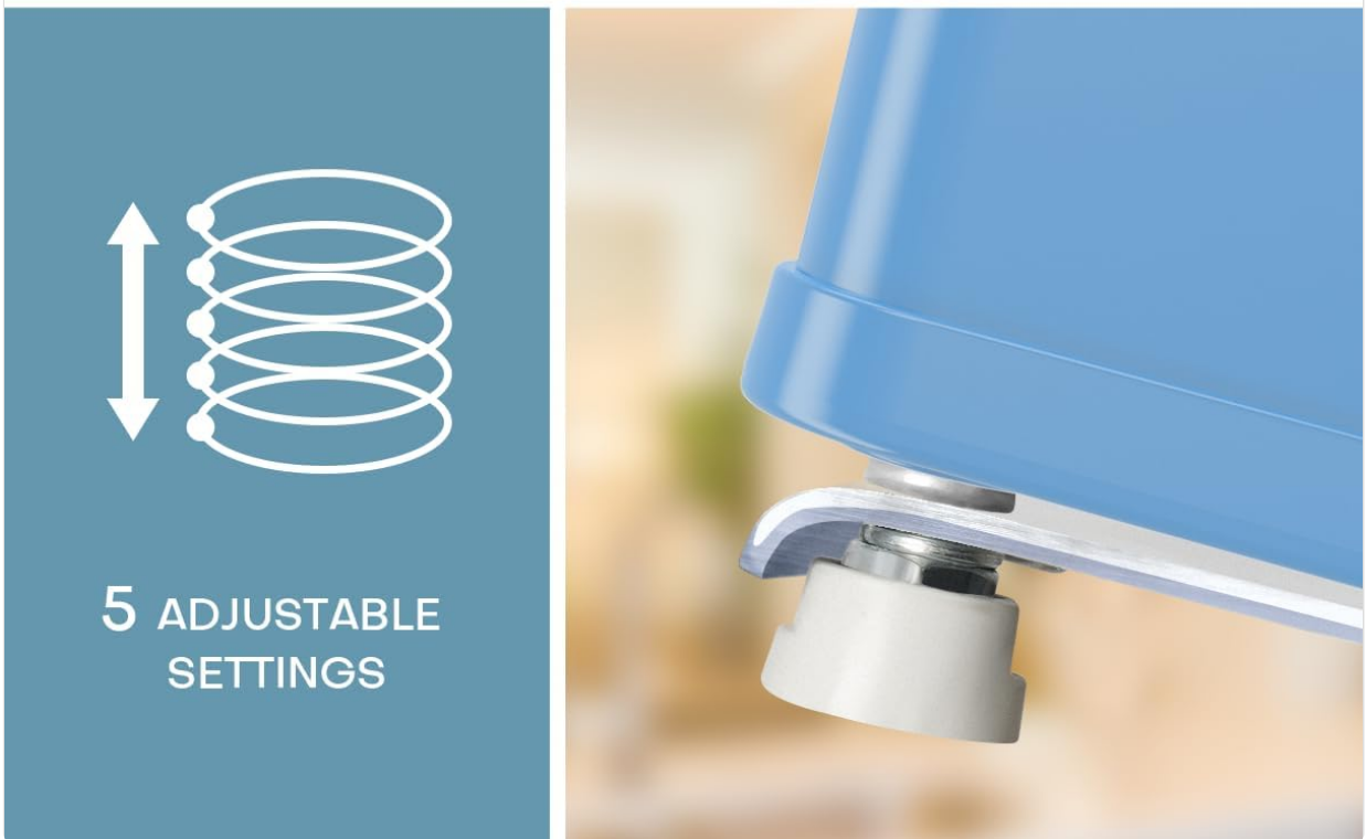
Image: Close-up of the adjustable leveling foot. The feet can be rotated to ensure the fridge is stable and level on any surface.