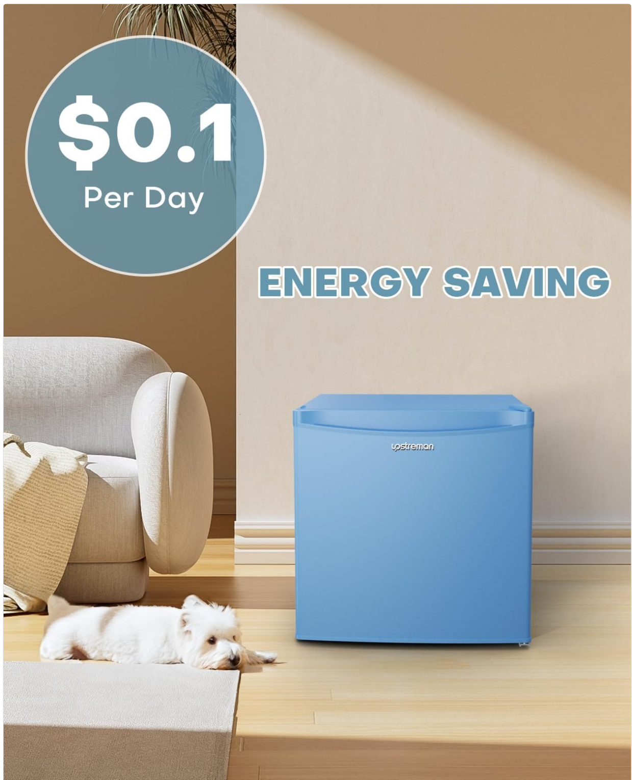
Image: Illustration of the fridge's energy efficiency, indicating a low daily operating cost.