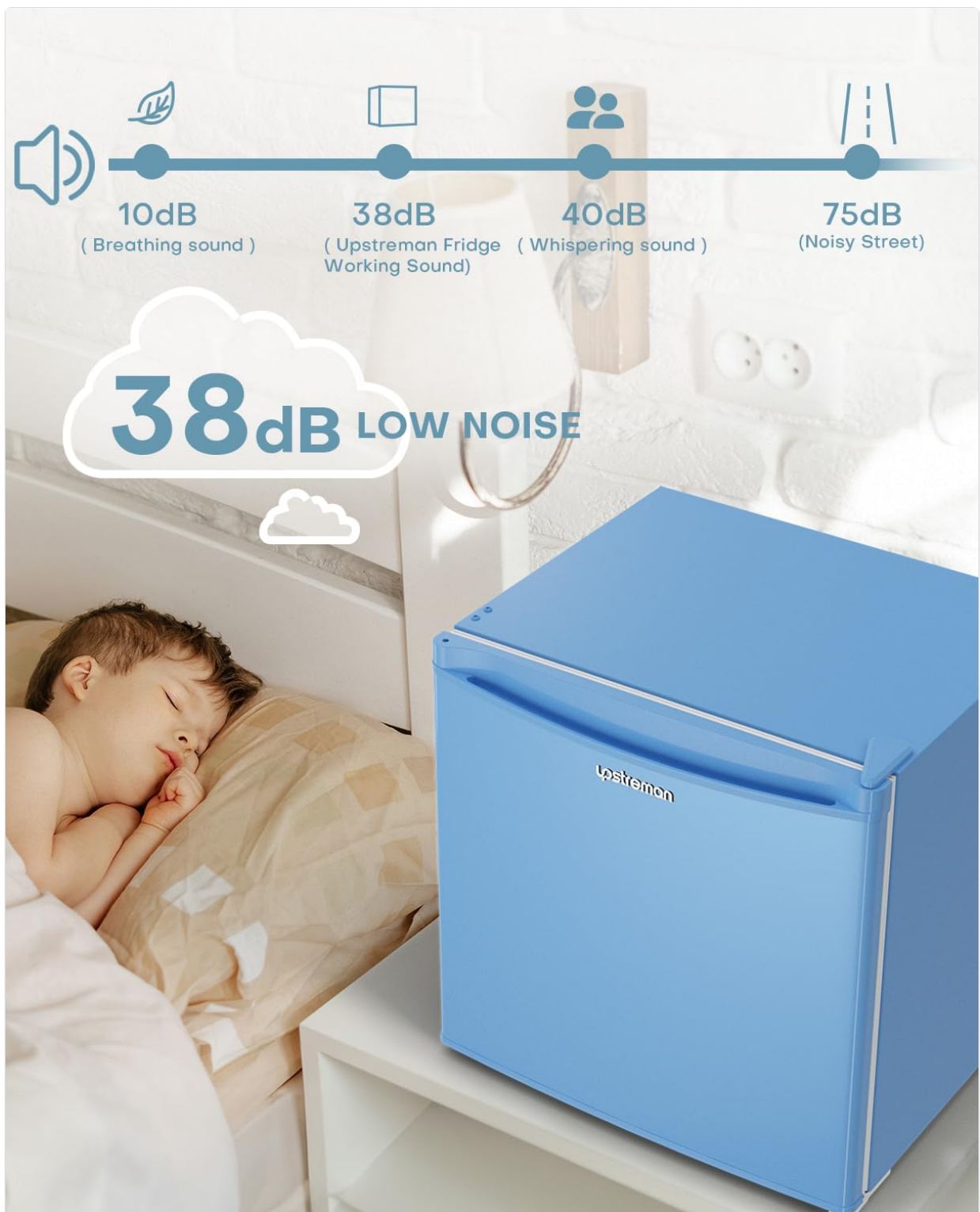
Image: Visual representation of the fridge's 38dB low noise operation, suitable for quiet spaces.