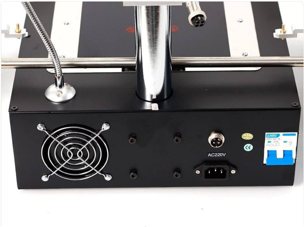
Image 4.2: Another view of the rear panel, showing the cooling fan on the left and the power input with an integrated circuit breaker on the right.