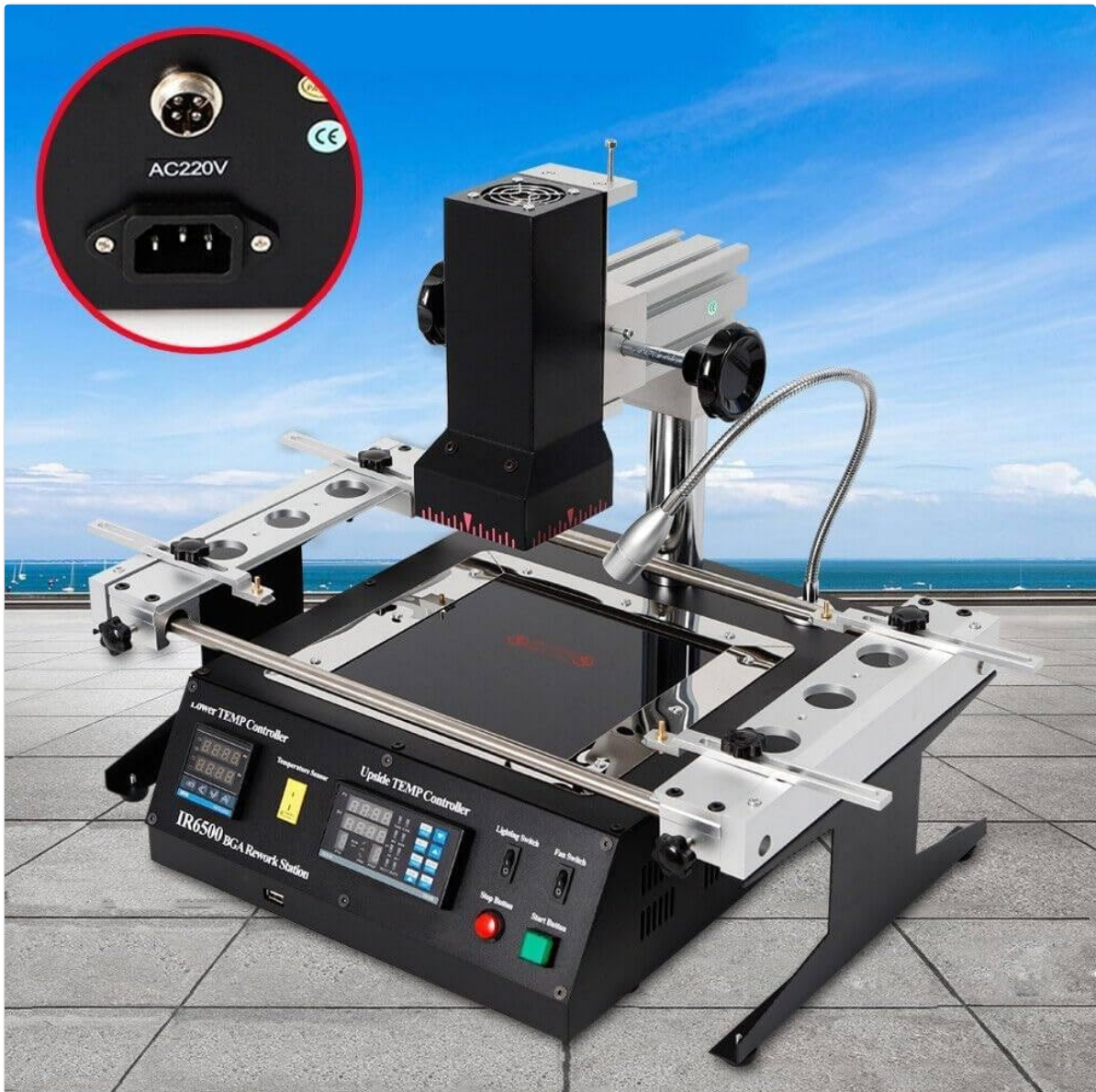
Image 4.1: Rear panel of the IR6500, highlighting the AC220V power input connector and the CE marking.

Connect the provided power cable to the AC220V power inlet on the rear of the rework station. Ensure the power switch (circuit breaker) is in the OFF position before plugging the other end into a grounded 220V power outlet.