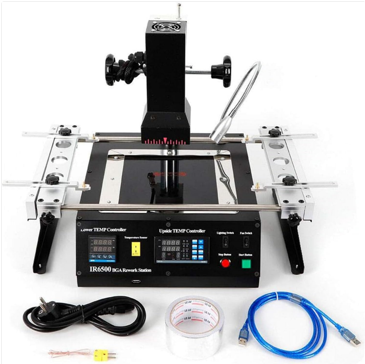
Image 3.1: Overview of the GBHJJ IR6500 BGA Infrared Rework Station and included accessories. This image displays the main rework station unit, power cable, USB cable, aluminum foil tape, and a thermocouple.

Verify that all items listed below are present in your package. If any items are missing or damaged, contact your supplier immediately.