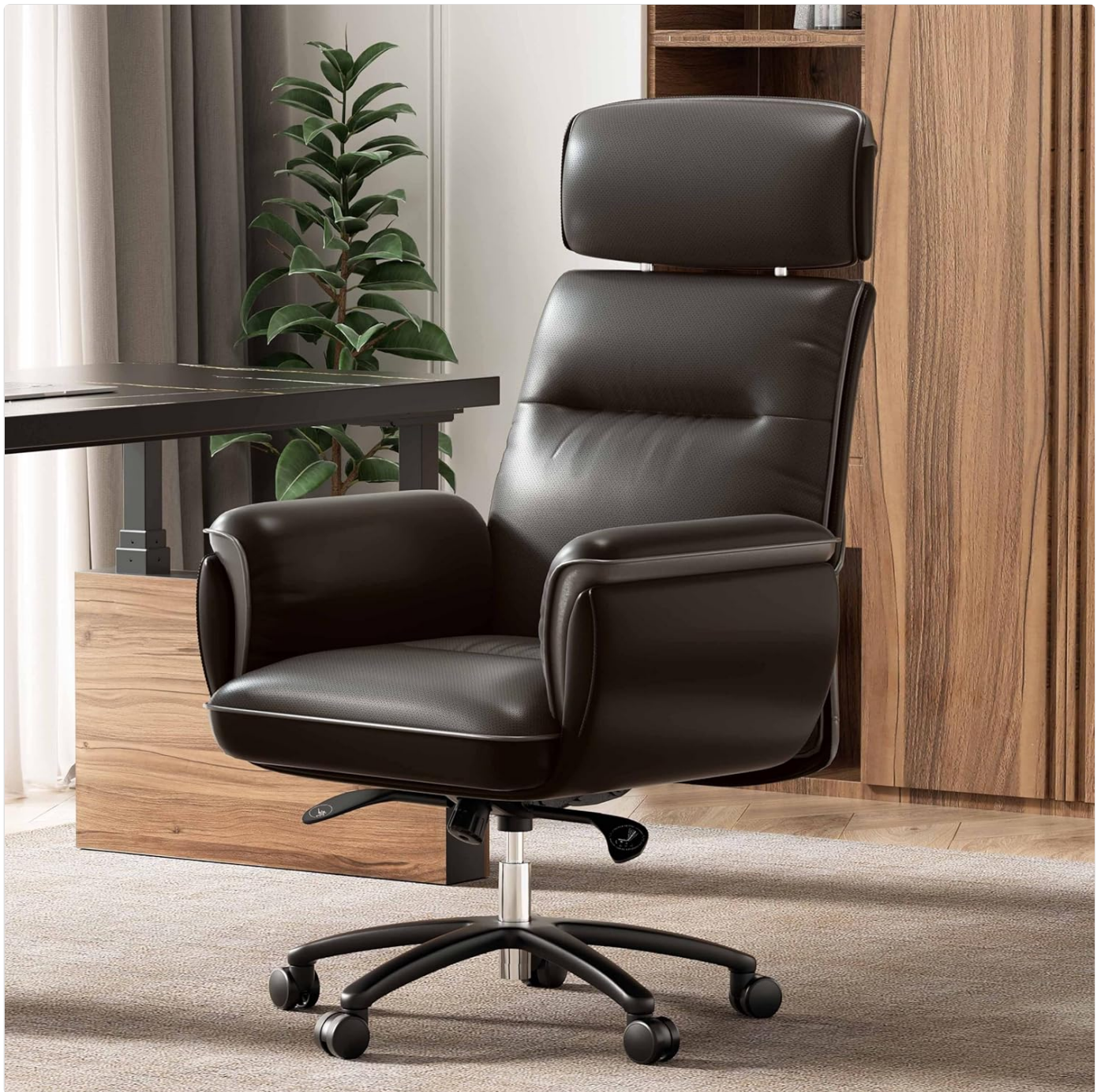
Figure 1: EUREKA ERGONOMIC Executive Desk Chair (Black)

This image displays the EUREKA ERGONOMIC Executive Desk Chair in black, positioned in a contemporary office environment. The chair features a high back, padded armrests, and a five-star base with casters, highlighting its executive design and ergonomic form.