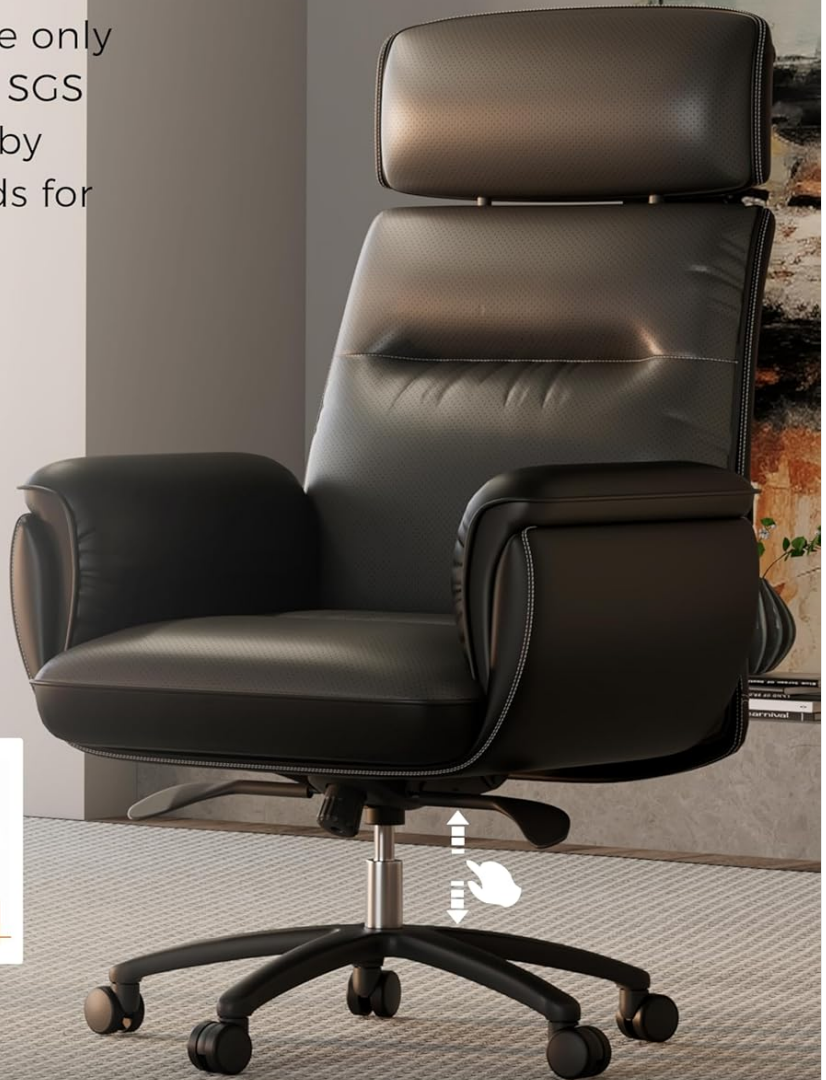
Figure 7: BIFMA and SGS Certifications

Heavy Duty Class IV Gas Lift Rated to 275lbs.