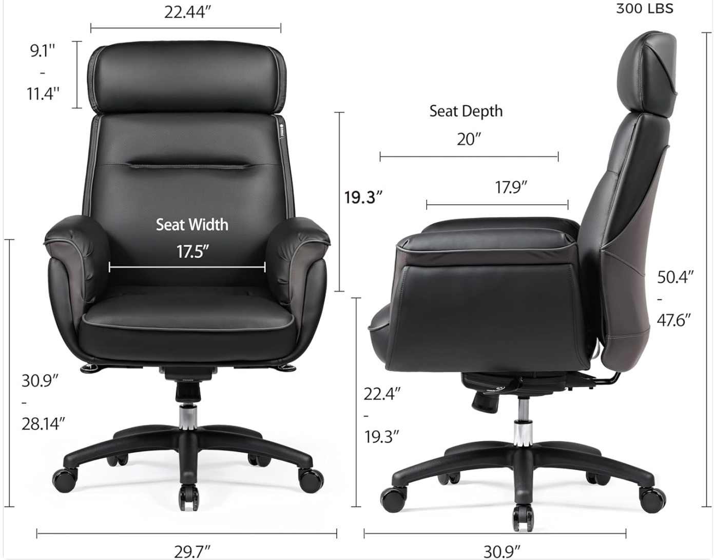
Figure 6: Product Dimensions and Weight Capacity

This image provides a detailed diagram of the chair's dimensions, including seat width (17.5"), seat depth (20"), and overall height (50.4"), along with its maximum weight capacity of 300 lbs.