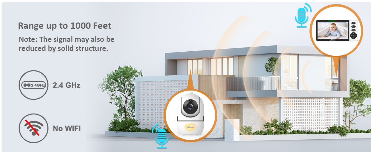
Image 4.1: Illustration of the 1000-foot range connectivity between the camera and parent unit, highlighting potential signal reduction by solid structures.

Place the camera unit in a location that provides a clear view of the monitoring area. Ensure it is out of reach of children and pets. The monitor uses 2.4GHz FHSS technology, providing a stable and secure connection up to 1000 feet in open areas. Signal strength may be reduced by solid structures like walls.