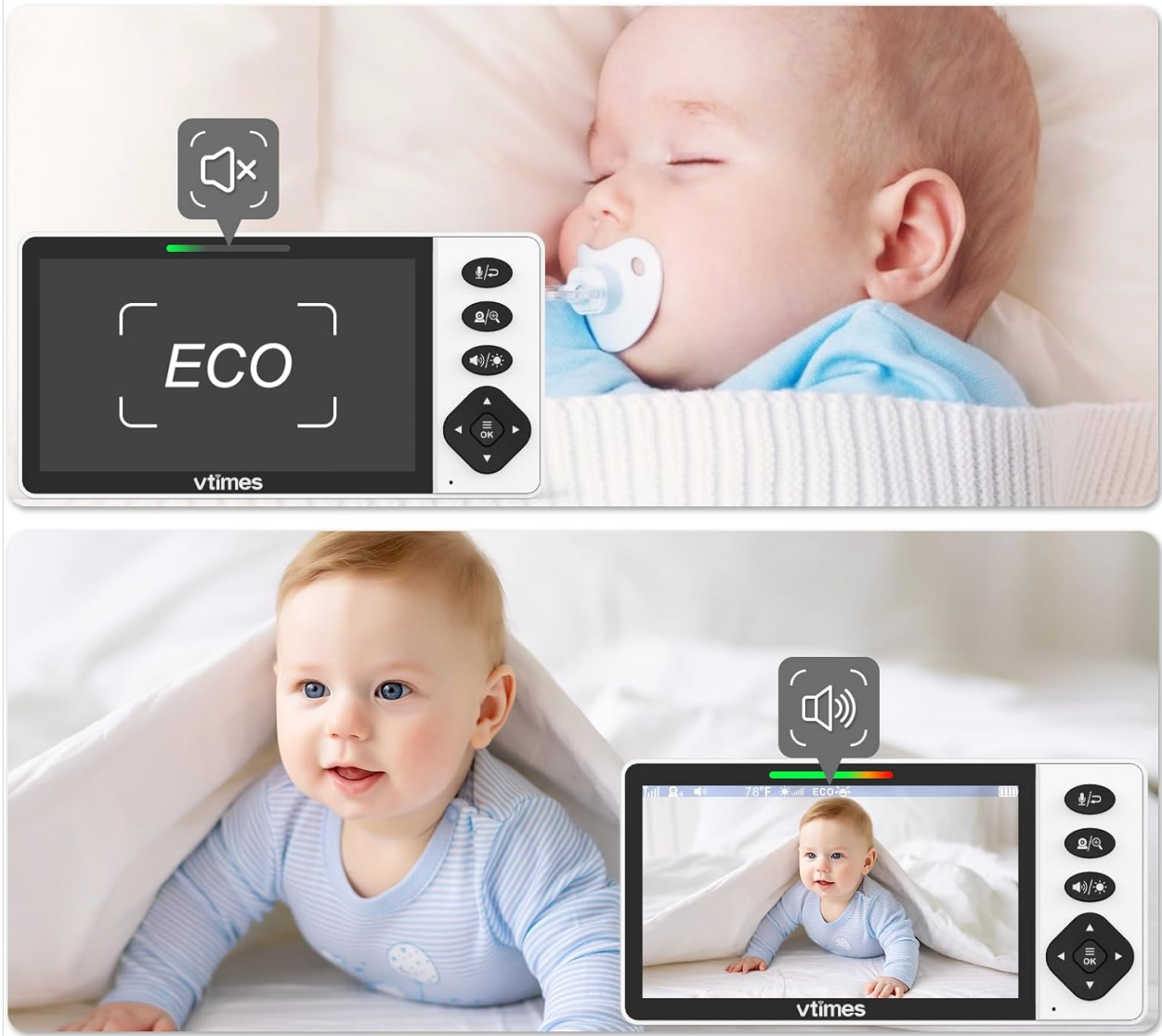
Image 5.2: The ECO mode feature, showing the monitor screen turning on when sound is detected.

Screen will turn on when detect the sound