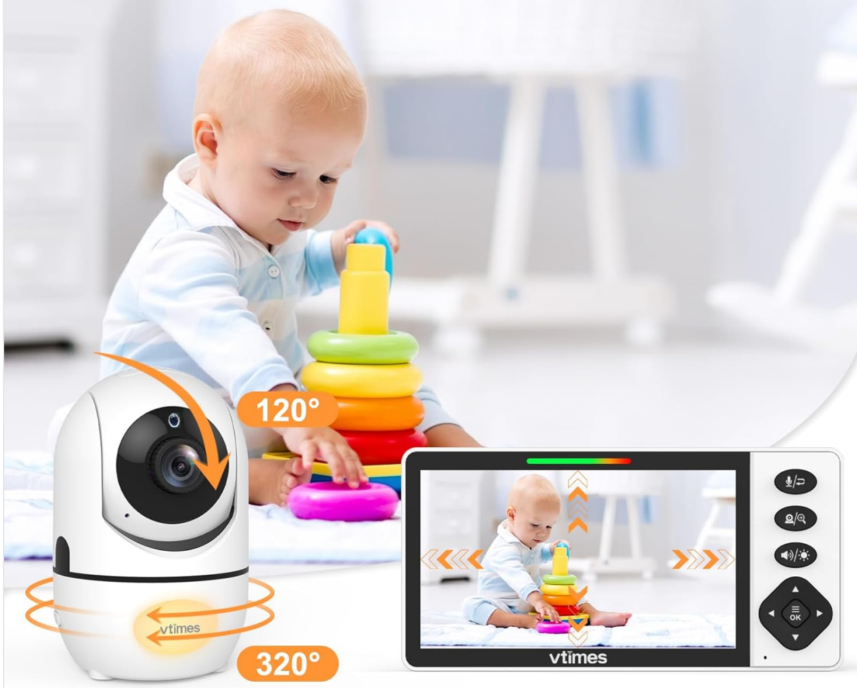
Image 5.1: The remote pan-tilt function of the camera unit, showing its 320-degree horizontal and 120-degree vertical rotation capabilities.