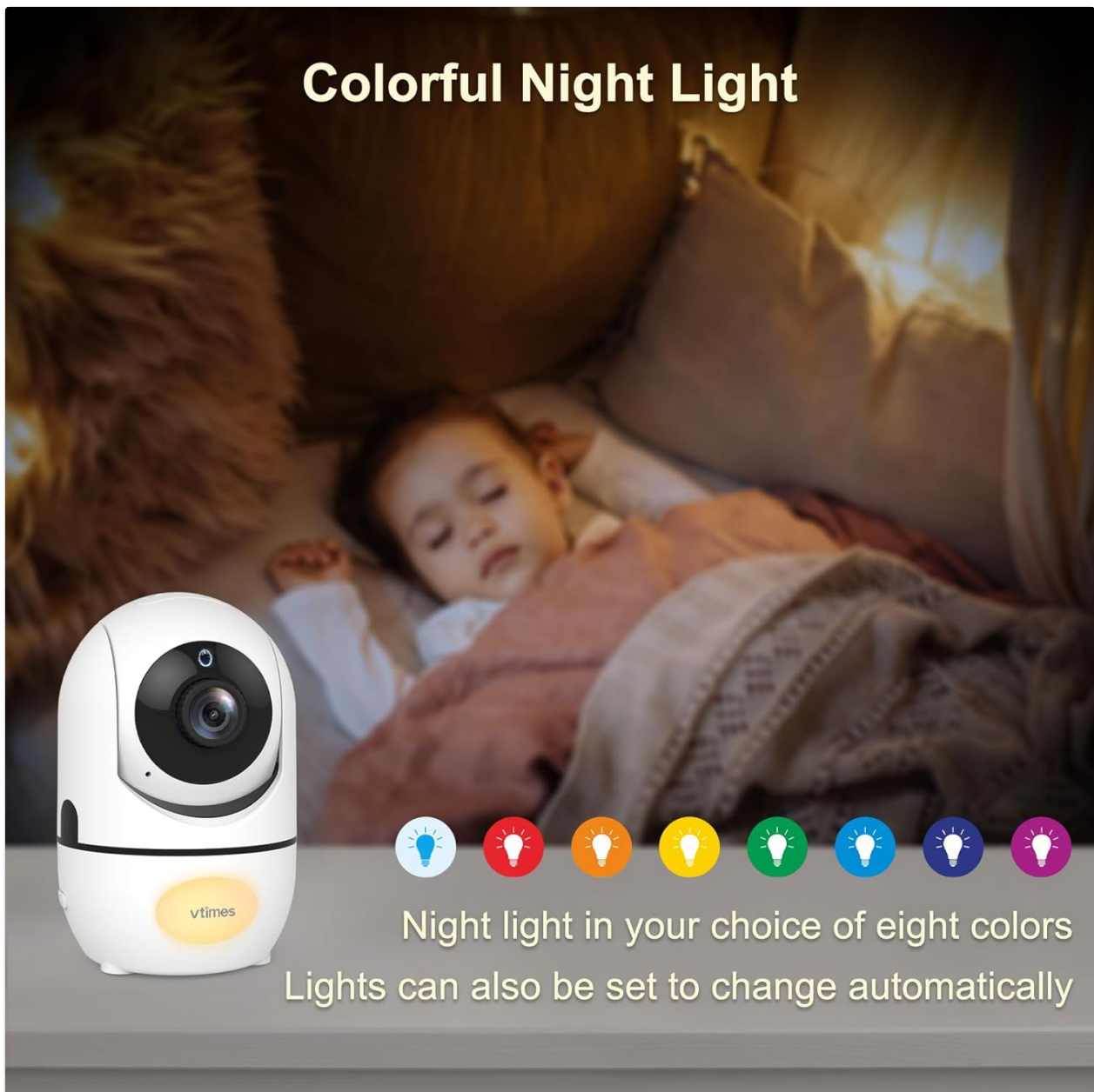
Image 5.3: The camera unit with its colorful night light feature, displaying eight different color options.