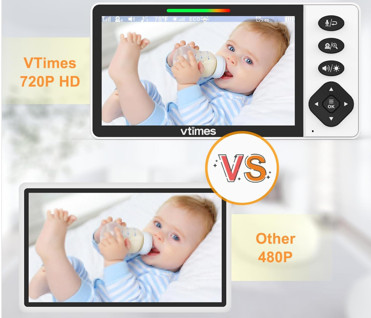
Image 3.2: Comparison illustrating the clarity of the VTimes 720P HD screen versus a standard 480P display.