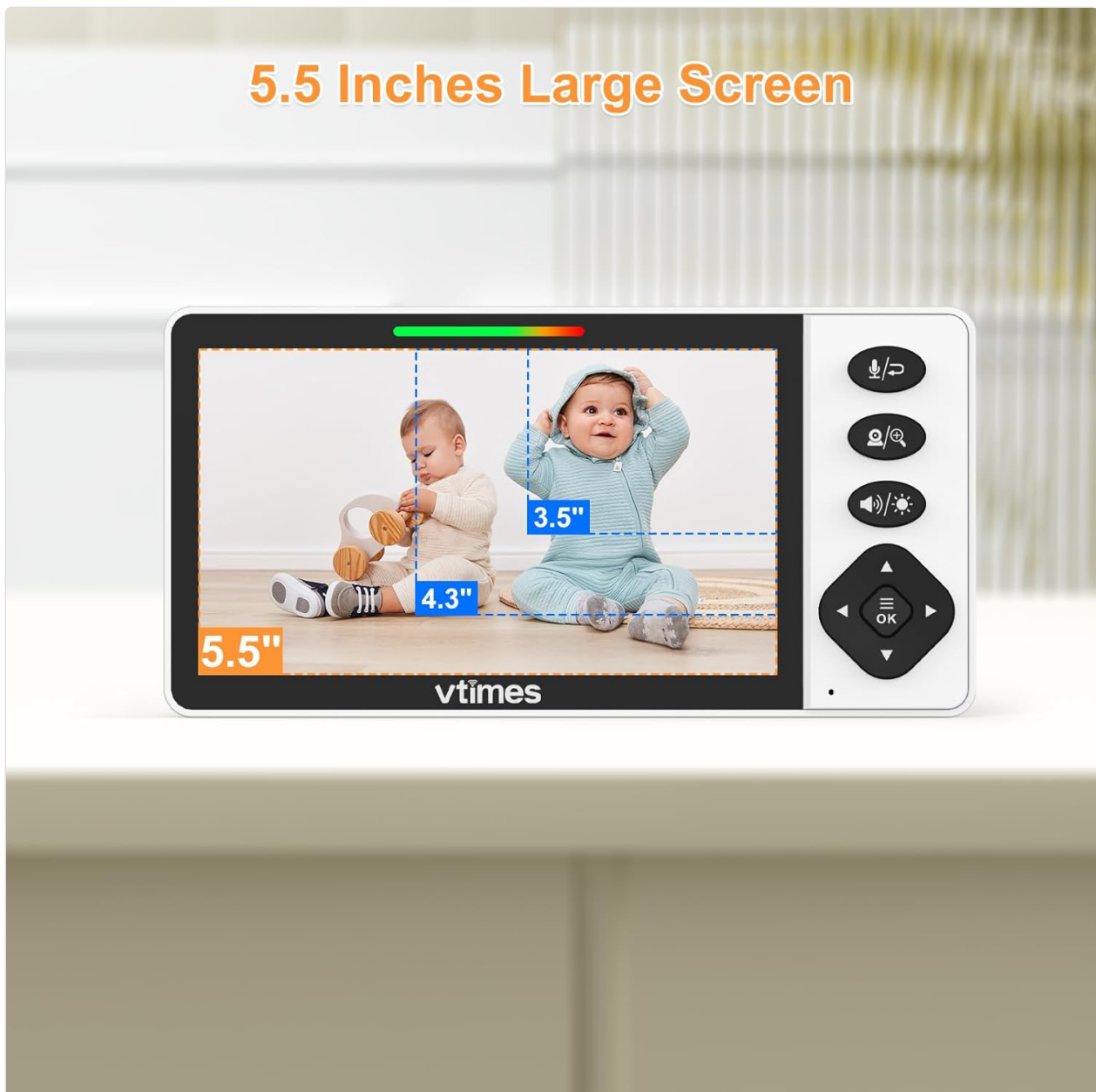
Image 3.1: The 5.5-inch large screen of the parent unit, showing a comparison of screen dimensions.

The parent unit features a 5.5-inch 720P HD display for clear viewing. It includes control buttons for various functions such as two-way talk, zoom, volume, brightness, and menu navigation.