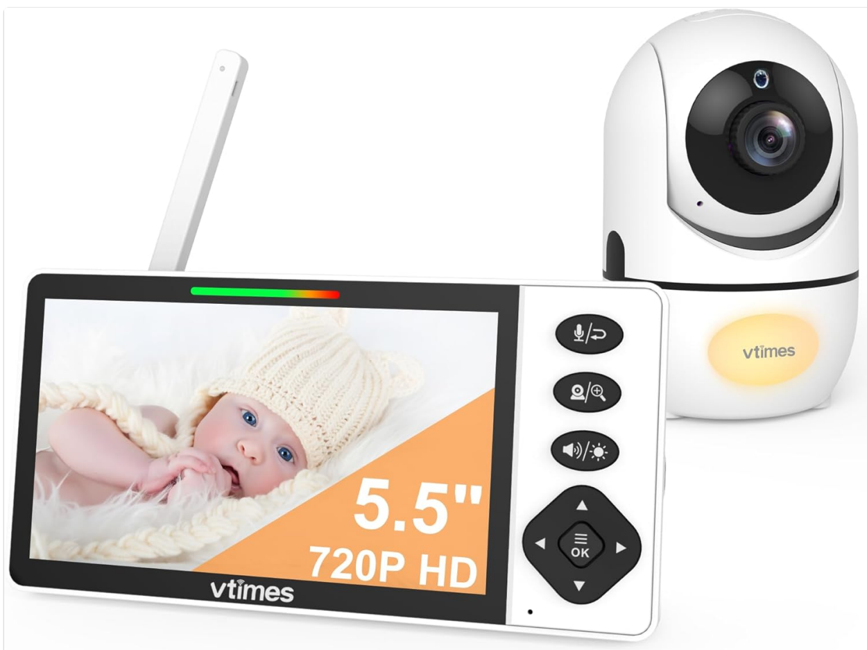
Image 1.1: VTimes VT507 Baby Monitor Parent Unit and Camera Unit. The image displays the white parent unit with a 5.5-

Thank you for choosing the VTimes VT507 Baby Monitor. This device is designed to provide secure and reliable monitoring of your baby, elderly family members, or pets. Featuring a 5.5-inch 720P HD screen, pan-tilt-zoom camera, night vision, and various smart functions, it offers peace of mind without relying on Wi-Fi connectivity. Please read this manual thoroughly before use to ensure proper operation and safety.