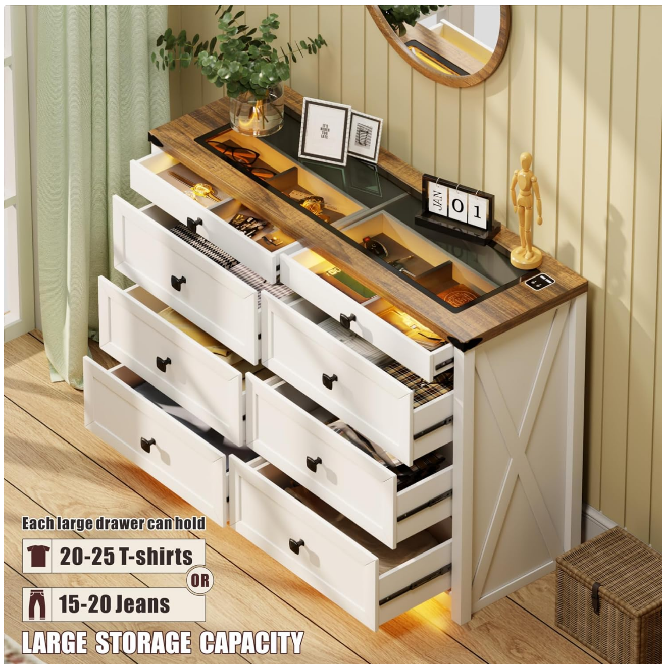
Figure 7.2: Storage capacity illustration.

An illustrative image demonstrating the ample storage capacity of each large drawer, capable of holding approximately 20-25 t-shirts or 15-20 pairs of jeans.