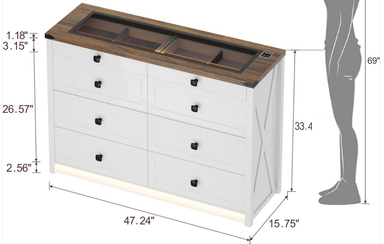
Figure 7.1: Detailed product dimensions.

This diagram provides a comprehensive overview of the dresser's dimensions, including overall height, width, depth, and specific measurements for drawer height and top surface thickness.