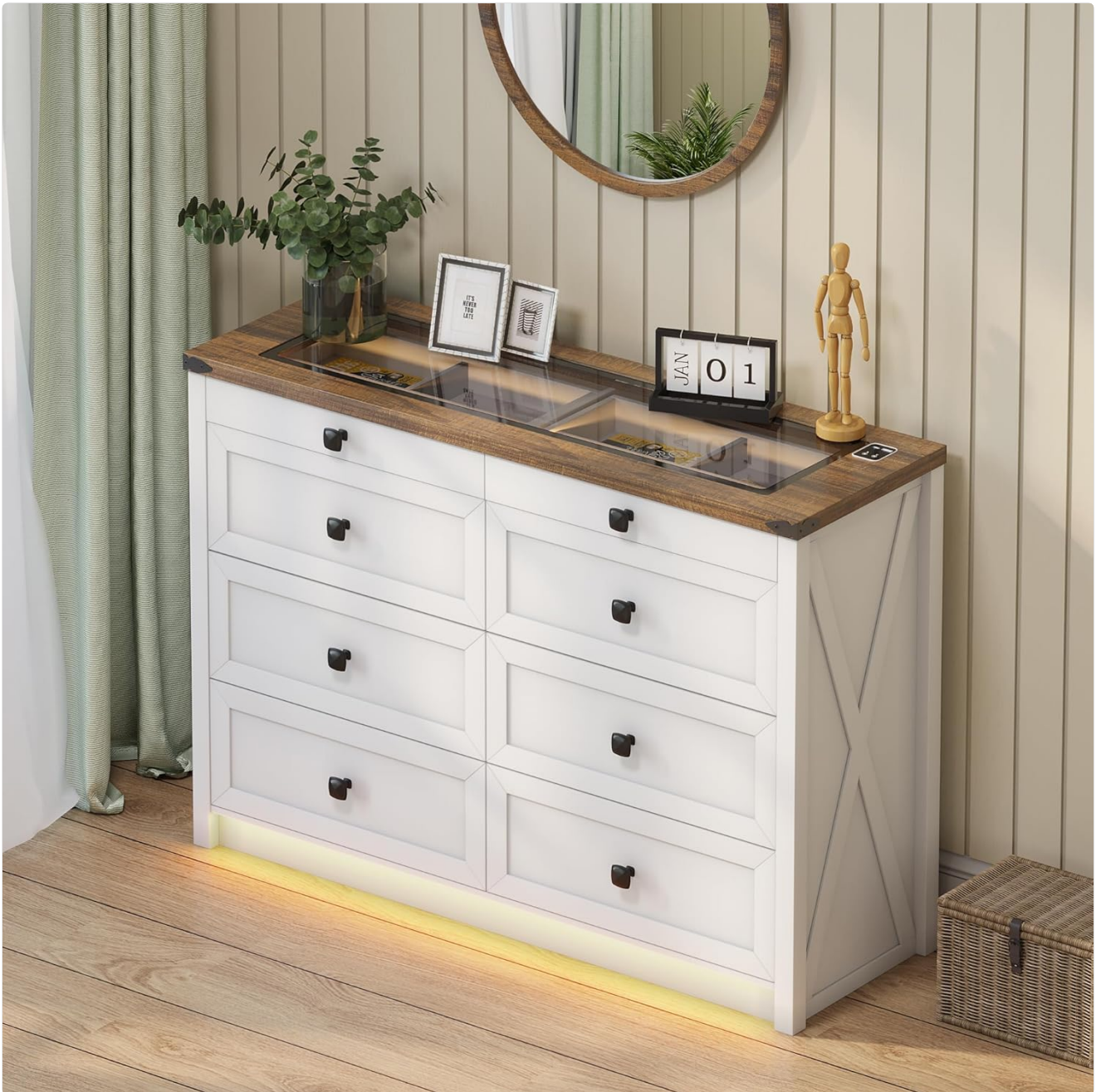
Figure 3.1: Fully assembled dresser.

This image shows the dresser fully assembled and placed in a room, ready for use. Note the integrated LED lighting at the base and the clear glass top.