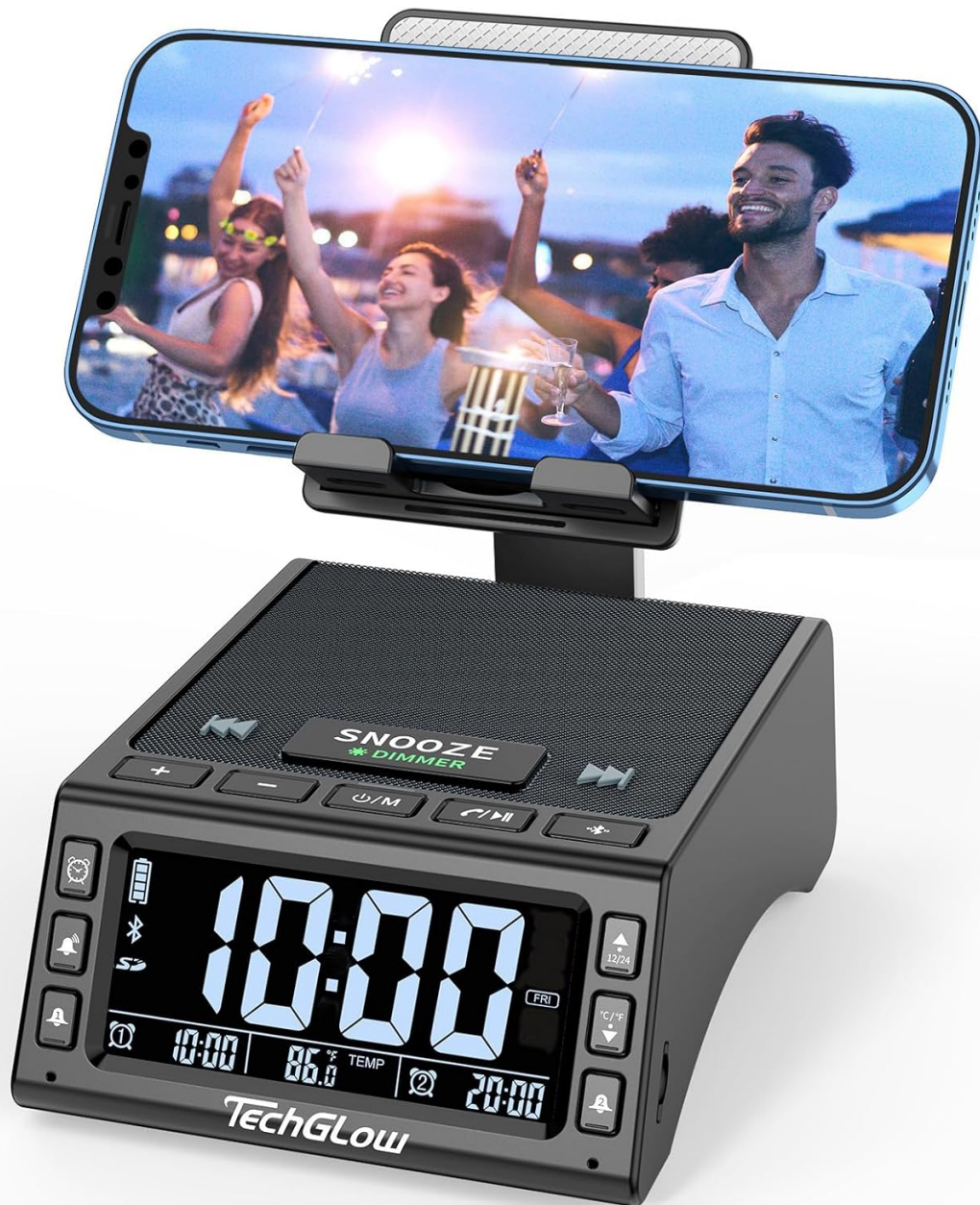
The TechGlow L36 device showcasing its primary functions as a phone stand, Bluetooth speaker, and alarm clock.