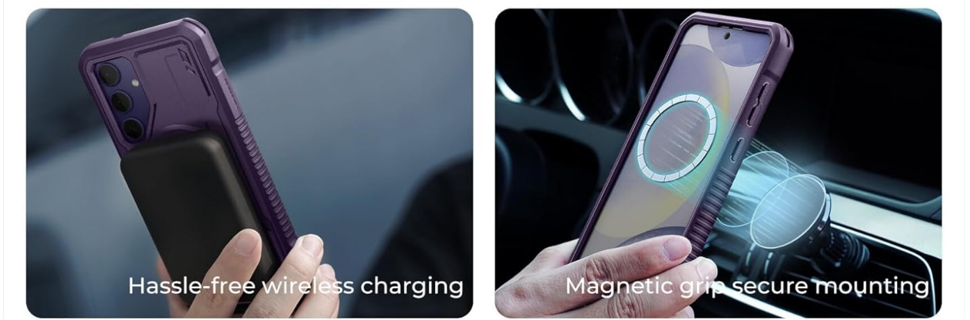
Figure 5: MagSafe compatibility and wireless charging demonstration.

Your browser does not support the video tag.