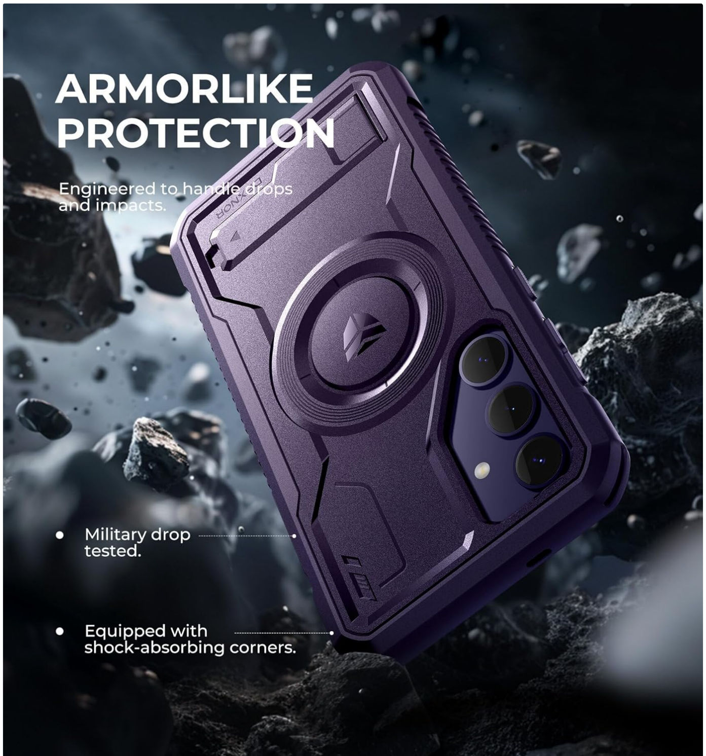
Figure 6: Armor-like protection and shock-absorbing corners.