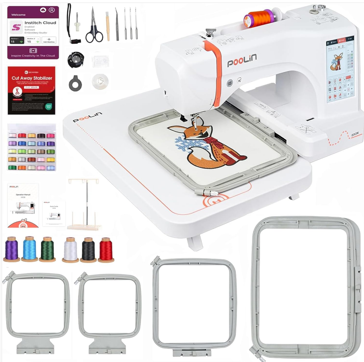
Figure 1.2: An overview of the POOLIN EOC06 Embroidery Machine along with its included accessories, such as different sized hoops, threads, and tools. This image provides a visual reference for all components.