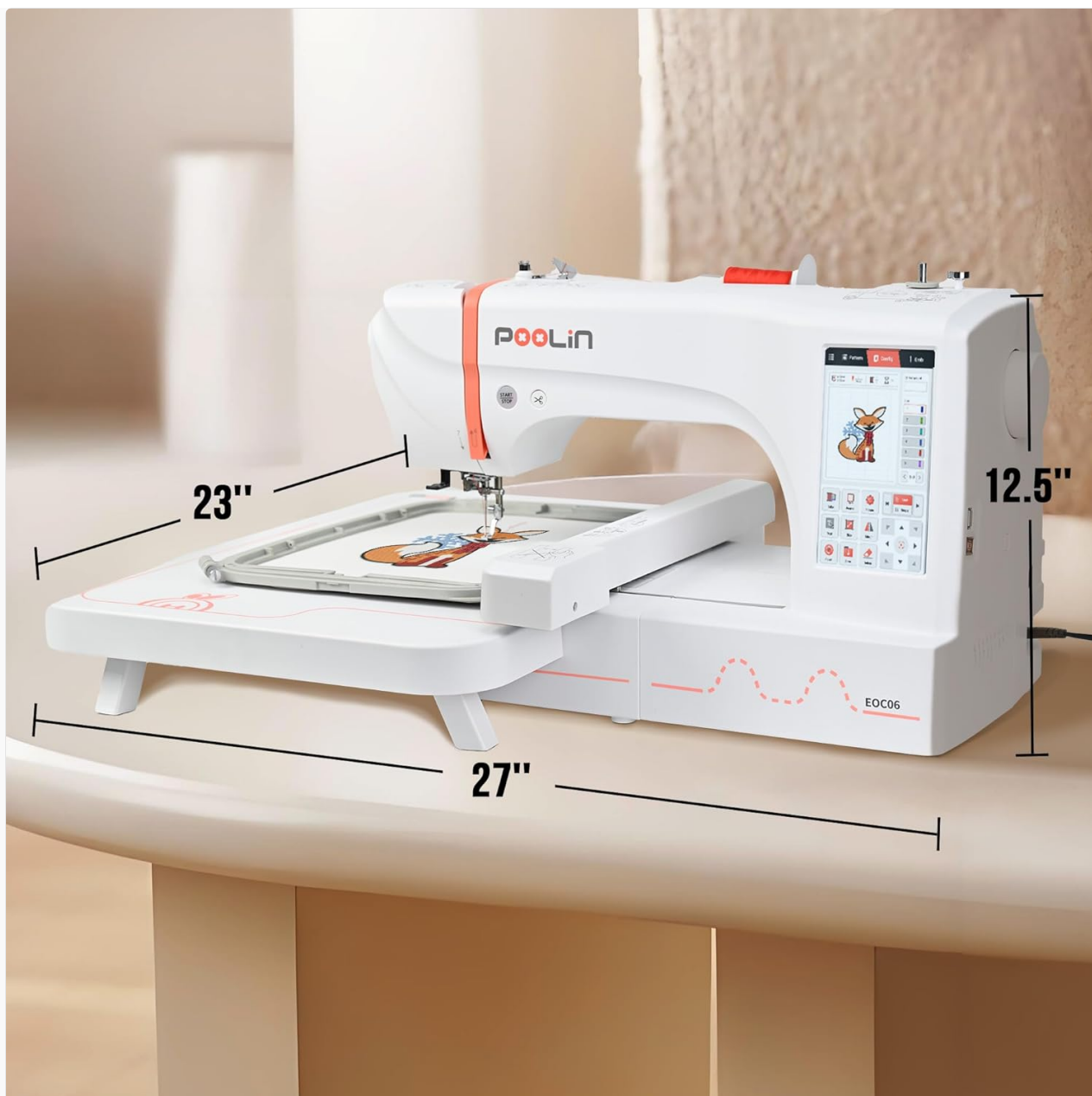
Figure 1.1: The POOLIN EOC06 Embroidery Machine, illustrating its approximate dimensions of 23 inches deep, 27 inches wide, and 12.5 inches high. This image helps in planning the placement of the machine.