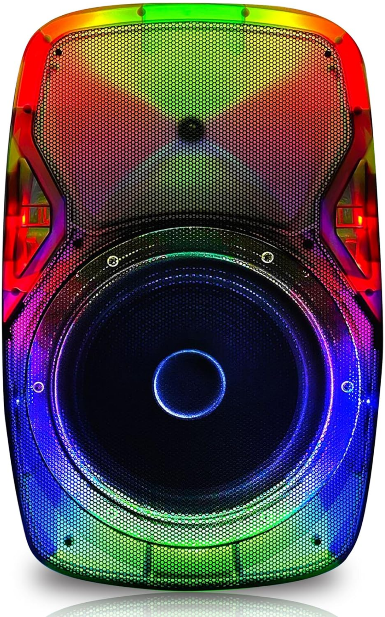
Front view of the STAR-115 speaker, showcasing its 15-inch woofer and vibrant multi-color flame light display.