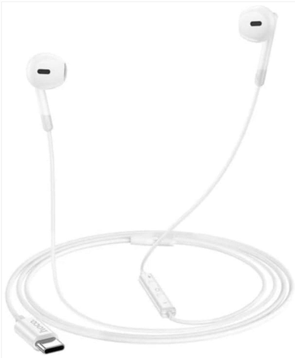
Image 1.1: The Hoco M109 Wired Type-C Earphones, showcasing their white color and Type-C connector.