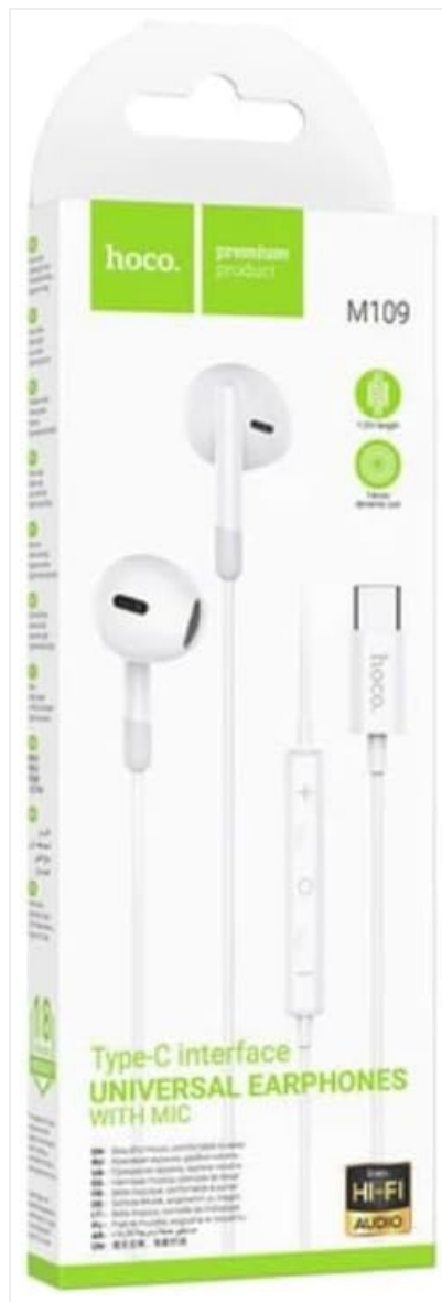
Image 2.1: The Hoco M109 earphones shown in their retail packaging, indicating the model and Type-C interface.