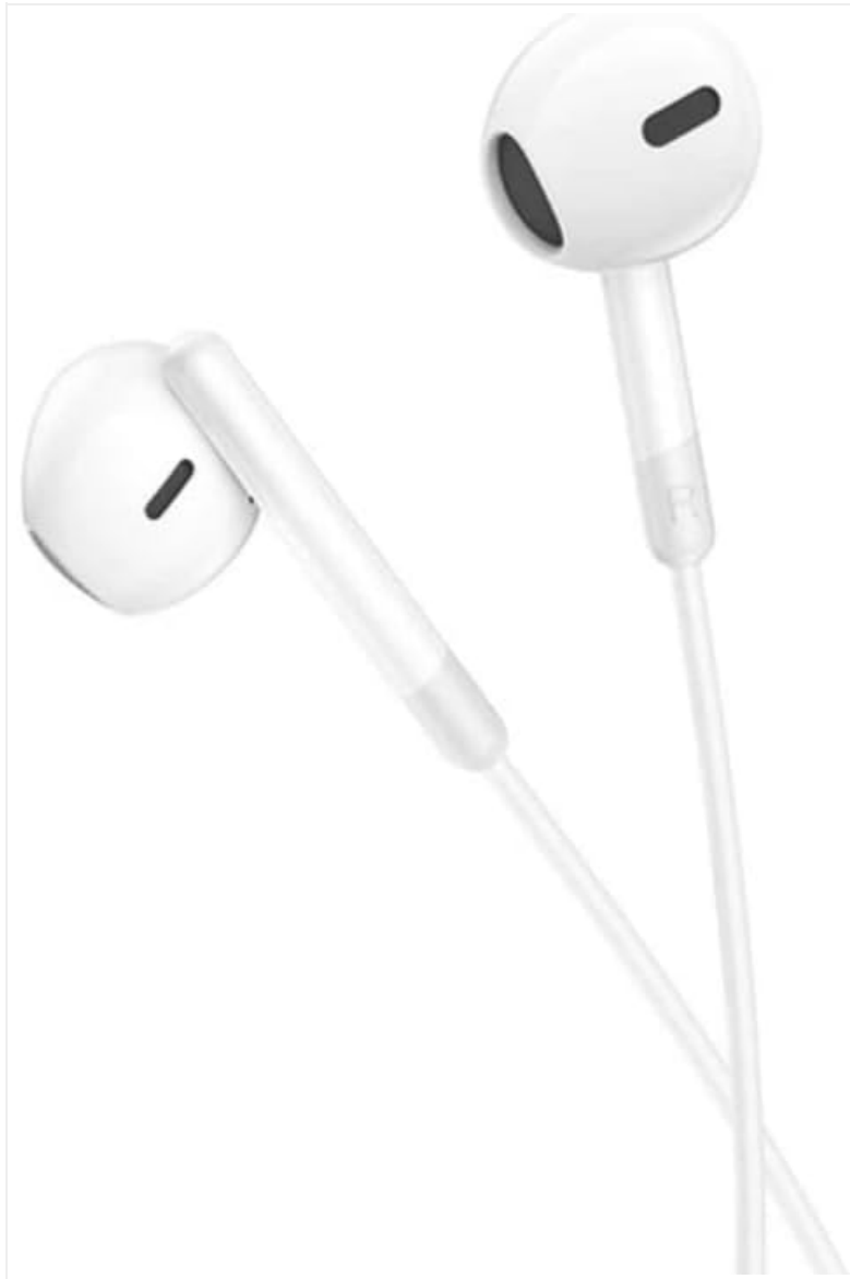
Image 5.1: A close-up view of a Hoco M109 earbud, highlighting its design and the importance of keeping the speaker mesh clean.