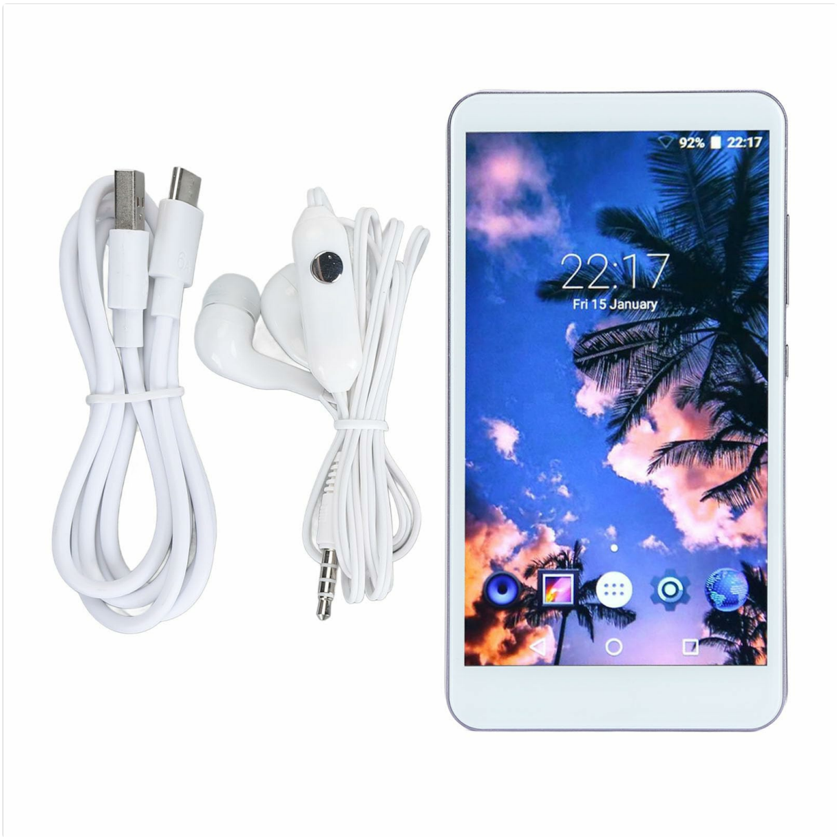
Image: Front view of the Elprico 5-inch MP4 Player, displaying the screen and general layout.