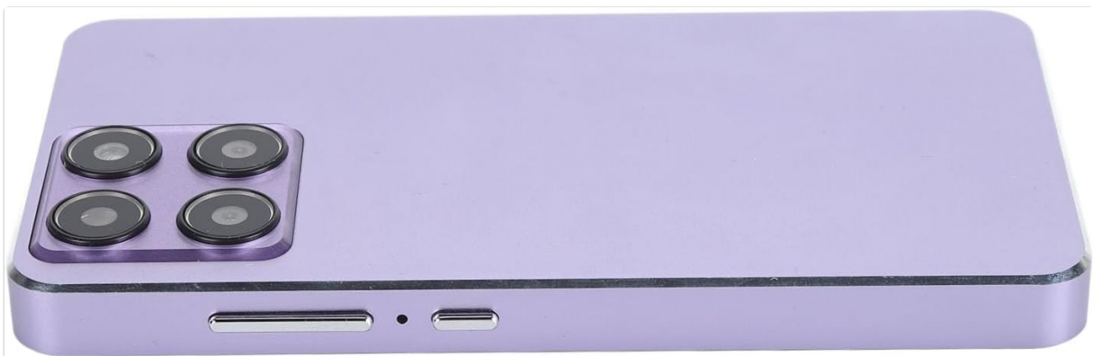
Image: Back view of the Elprico MP4 Player, highlighting the rear camera module and side buttons.