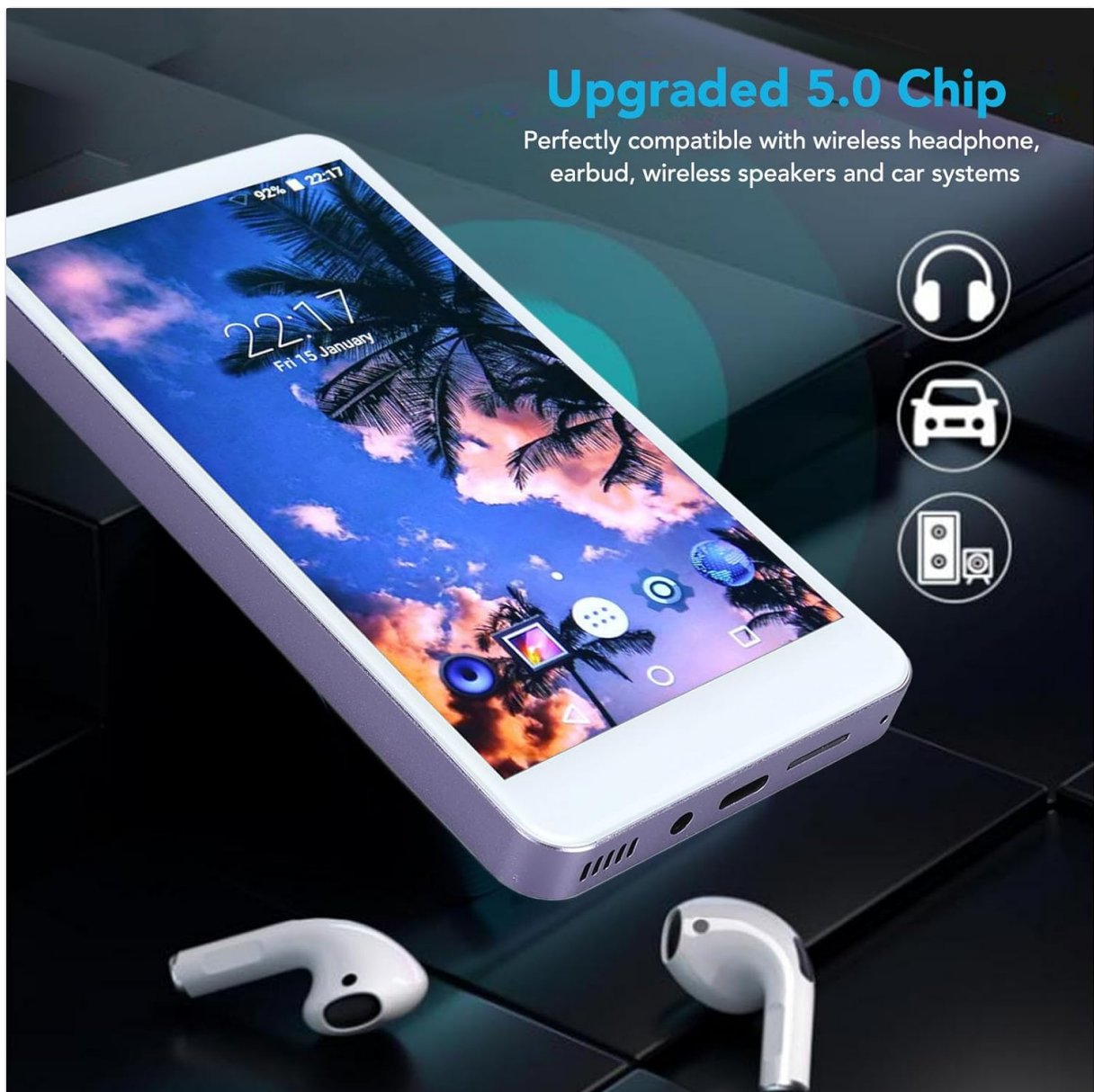
Image: The Elprico MP4 Player highlighting its Bluetooth 5.0 chip and compatibility with wireless headphones, earbuds, speakers, and car systems.