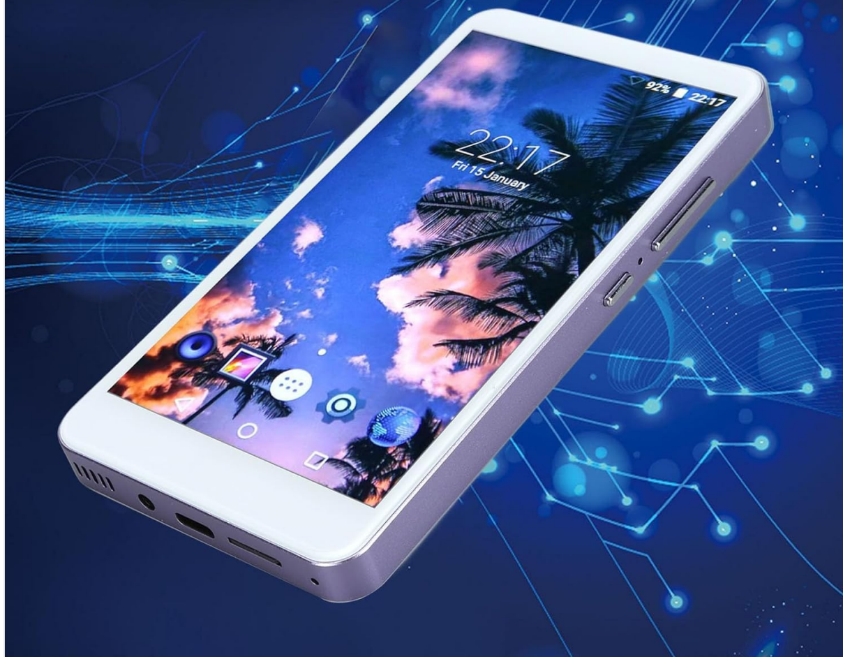
Image: The Elprico MP4 Player illustrating its support for wireless file uploads via Wi-Fi and Bluetooth, in addition to USB.

Provides not only USB cable for uploading music and videos, Can also share or transfer files via wireless connection and wifi, Use the provided app Easily transfer files between smartphones and players Especially for Android devices