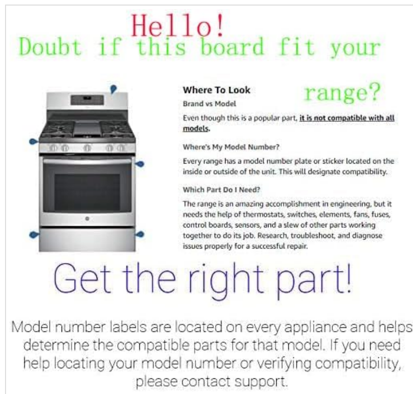
Image 1: Example of a range appliance with highlighted areas indicating common locations for model number labels. This image illustrates the importance of verifying your appliance's model number to ensure part compatibility.