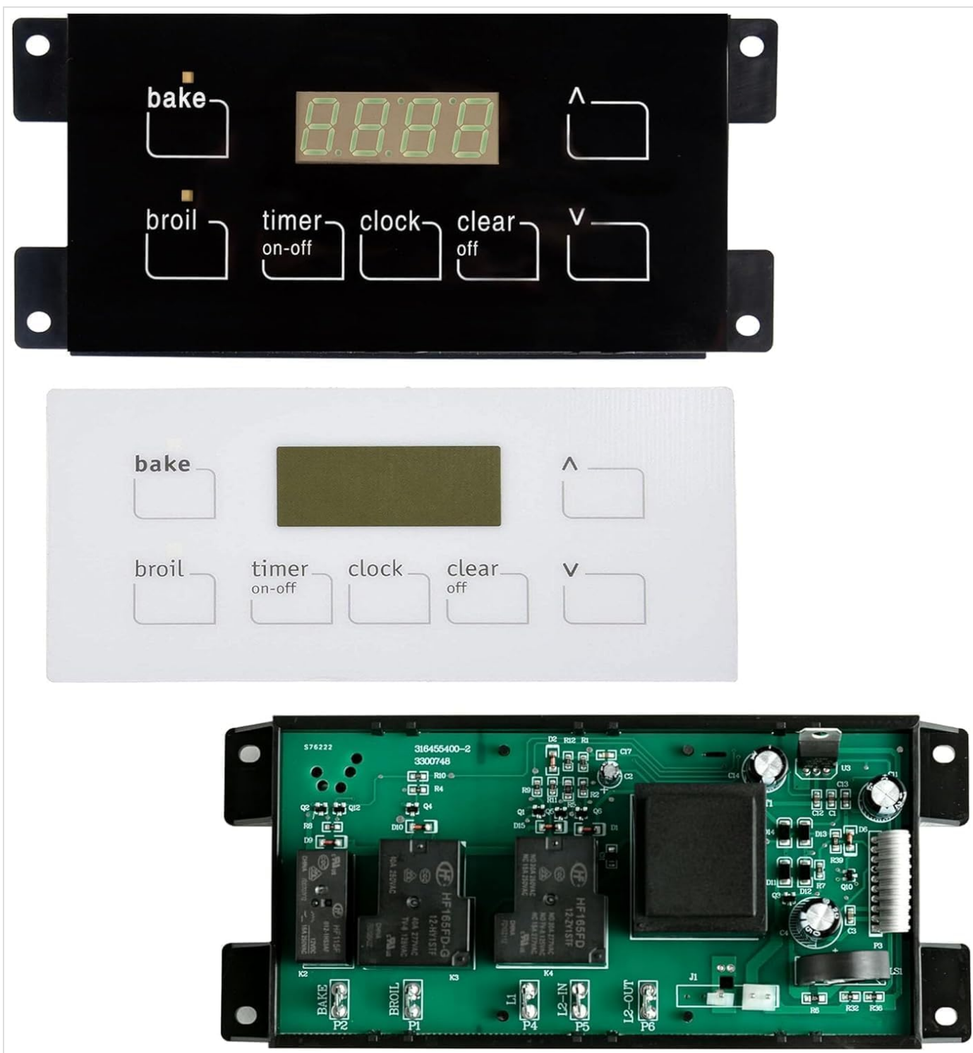
Image 2: The Generic 316455500 Oven Range Control Board, shown with both the black and white control panel overlays. These overlays are provided to match various appliance finishes.