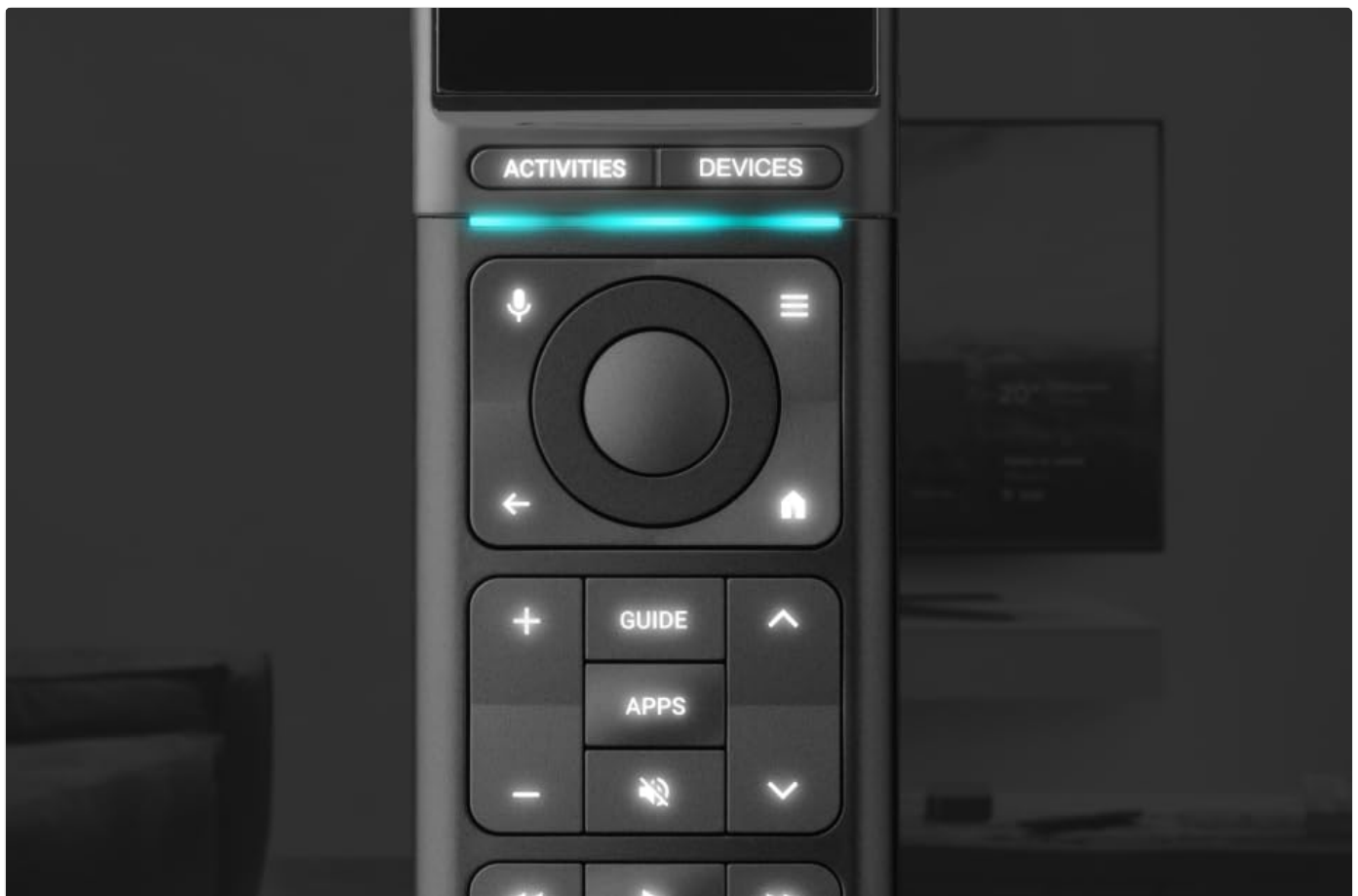
Figure 6: A close-up view of the remote's physical buttons, illuminated by the automatic backlight.