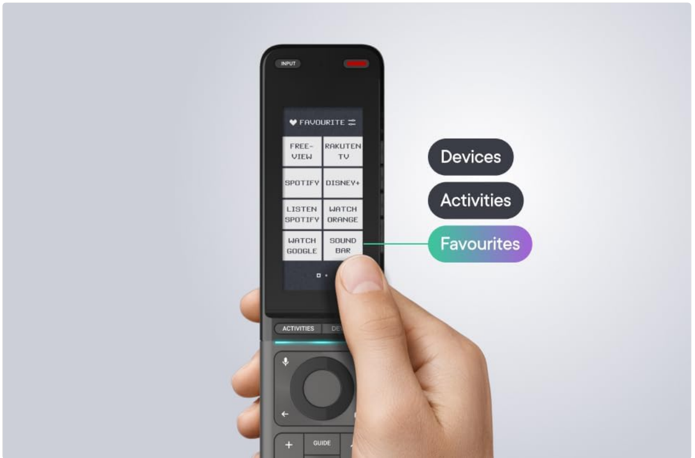
Figure 4: The remote's E-Ink display highlighting options for Devices, Activities, and Favourites.