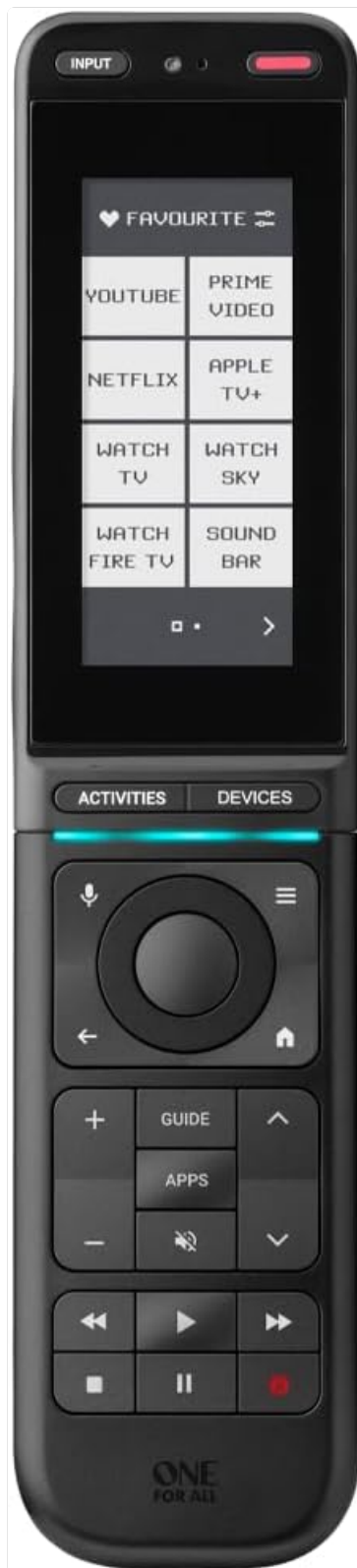
Figure 1: One For All URC7985 Smart Control Pro Universal Remote Control