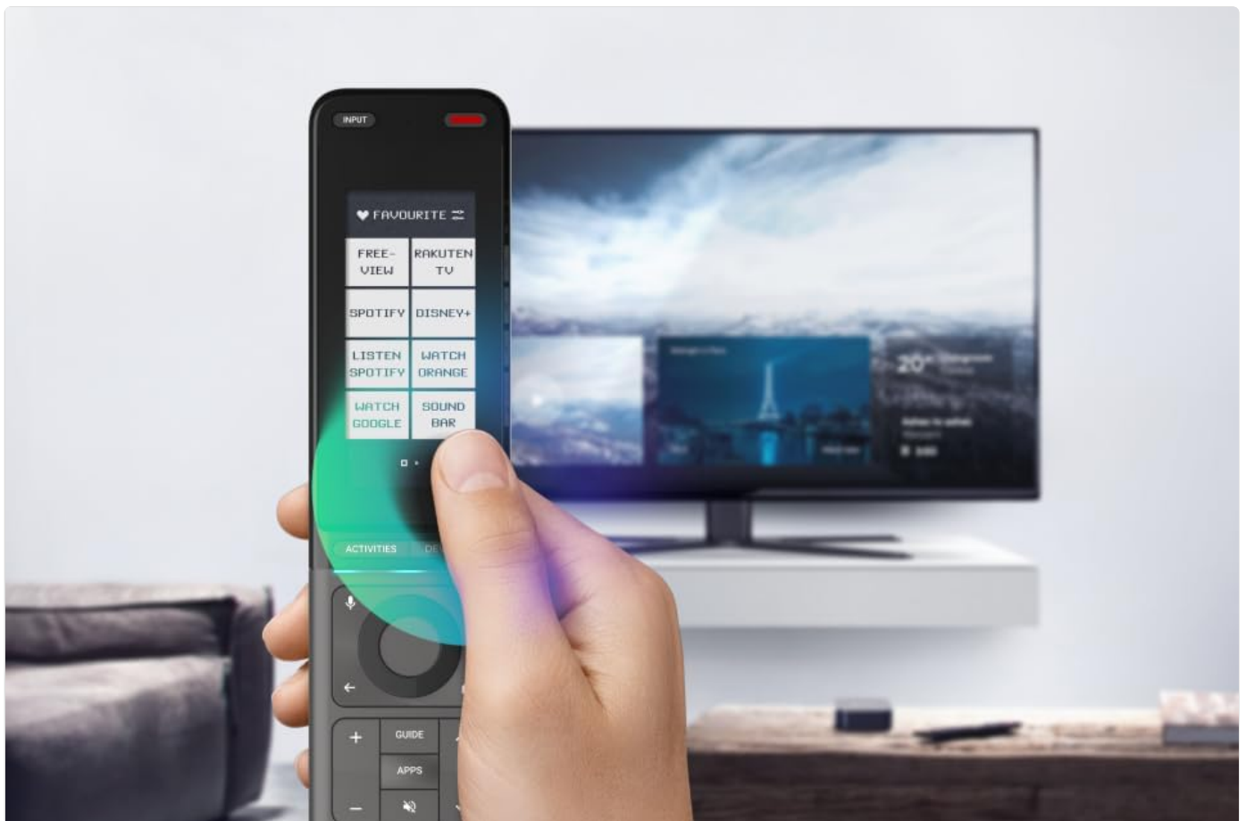
Figure 3: A hand interacting with the E-Ink touchscreen of the remote, with a television in the background.