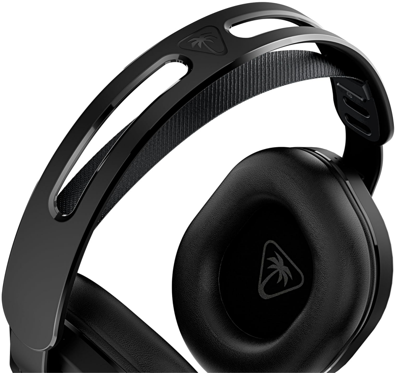
Figure 3.1: Package Contents of the Stealth 500 Headset.