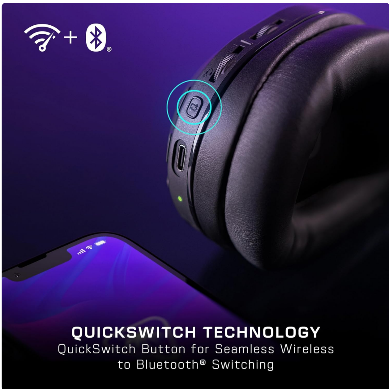
Figure 4.3: Wireless and Bluetooth connectivity setup.