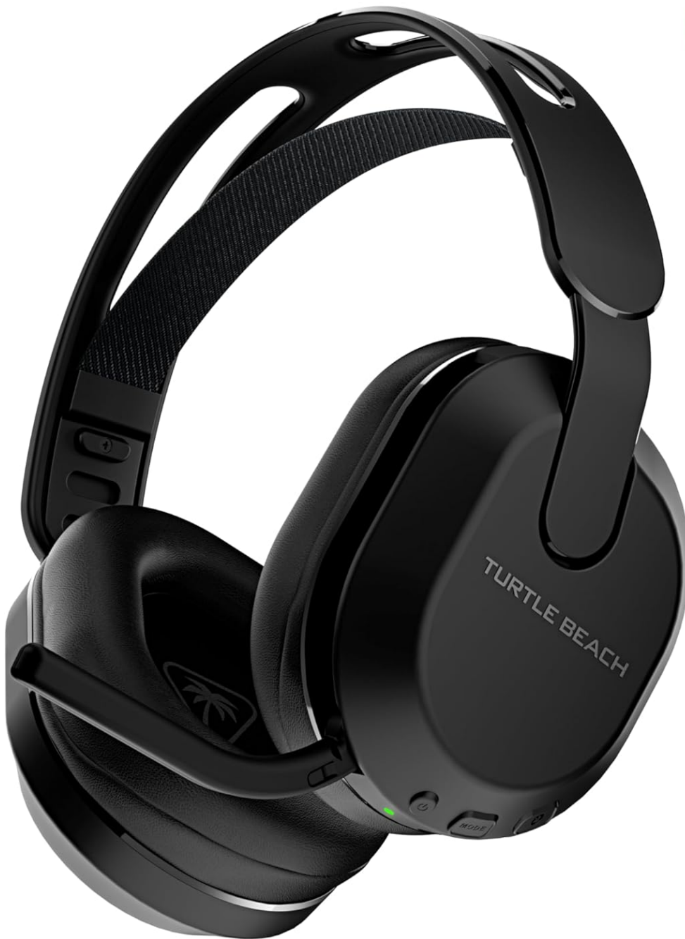
Figure 1.1: Turtle Beach Stealth 500 Wireless Gaming Headset.