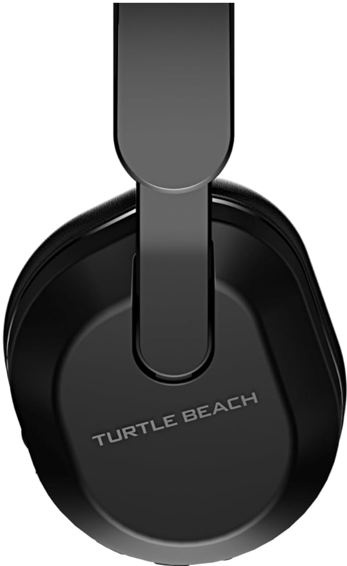
Figure 5.3: Headset controls including volume and mode buttons.

Advanced Superhuman Hearing® allows you to toggle between three different preset levels and adjust the intensity to dial-in the perfect sound for a wide range of games, giving you a distinct audio advantage.