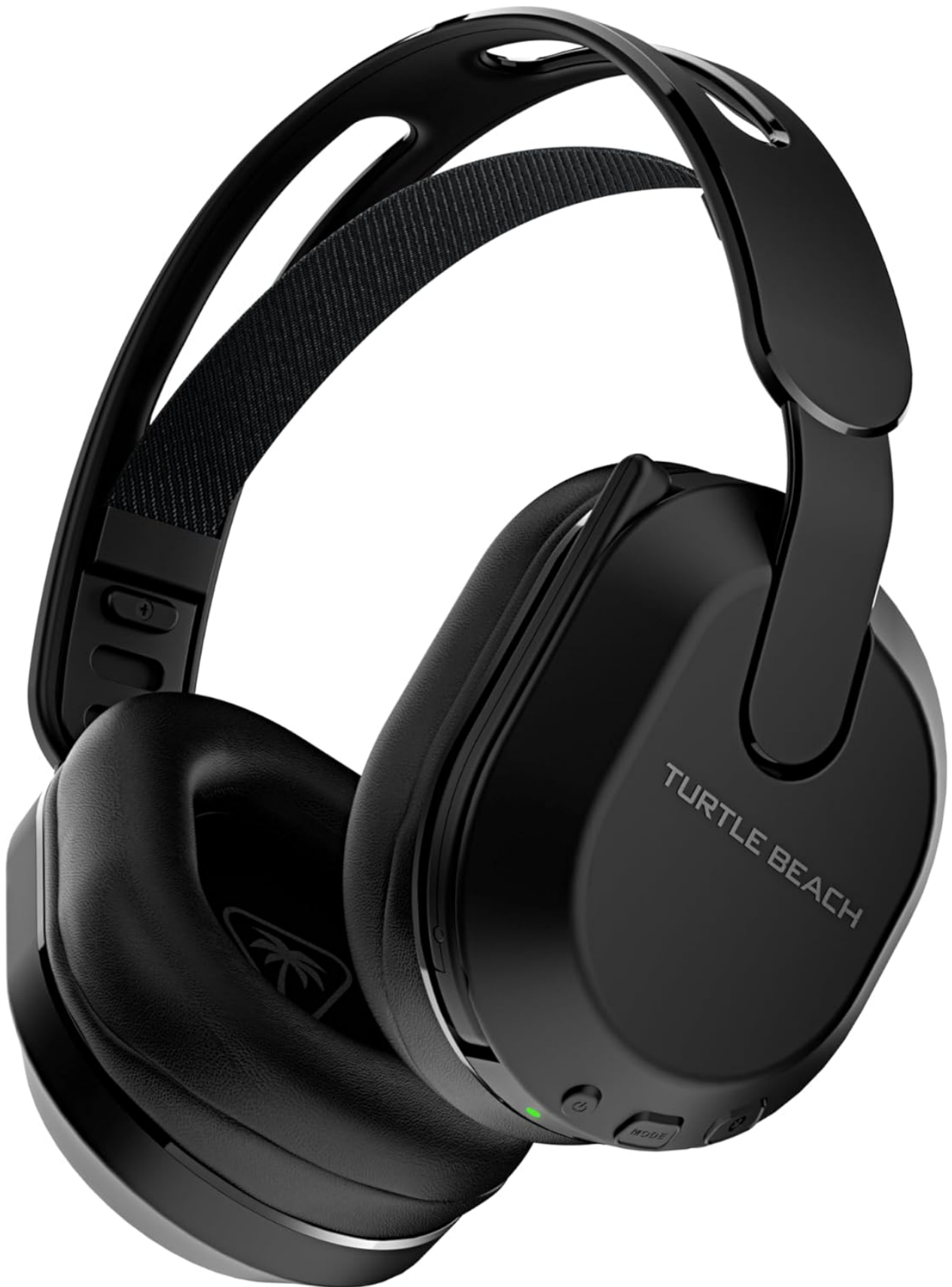
Figure 2.1: Ultra-lightweight design with floating headband and memory foam cushions for non-stop comfort.