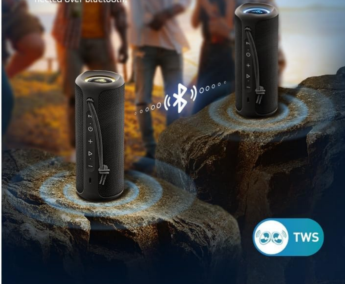
Image showing two Aliencraft OUMUA Pro speakers wirelessly connected via TWS, demonstrating how they can create a stereo sound system.

Note: Before TWS pairing, make sure the two speakers are not connected over bluetooth.