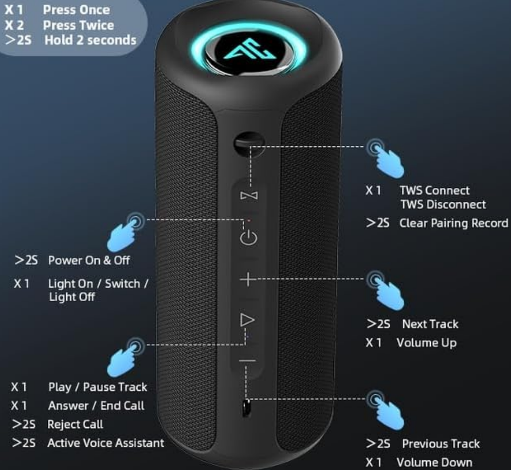
Diagram illustrating the control panel of the Aliencraft OUMUA Pro speaker, with labels for each button and their corresponding functions (single press, double press, long press).

X 1 Press Once X 2 Press Twice >2S Hold 2 seconds