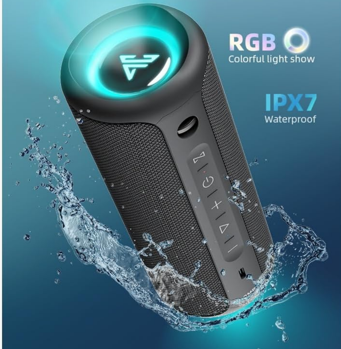
Image of the AlienCraft OUMUA Pro speaker with dynamic RGB lighting activated, showcasing its colorful light show and highlighting its IPX7 waterproof rating with water splashes.