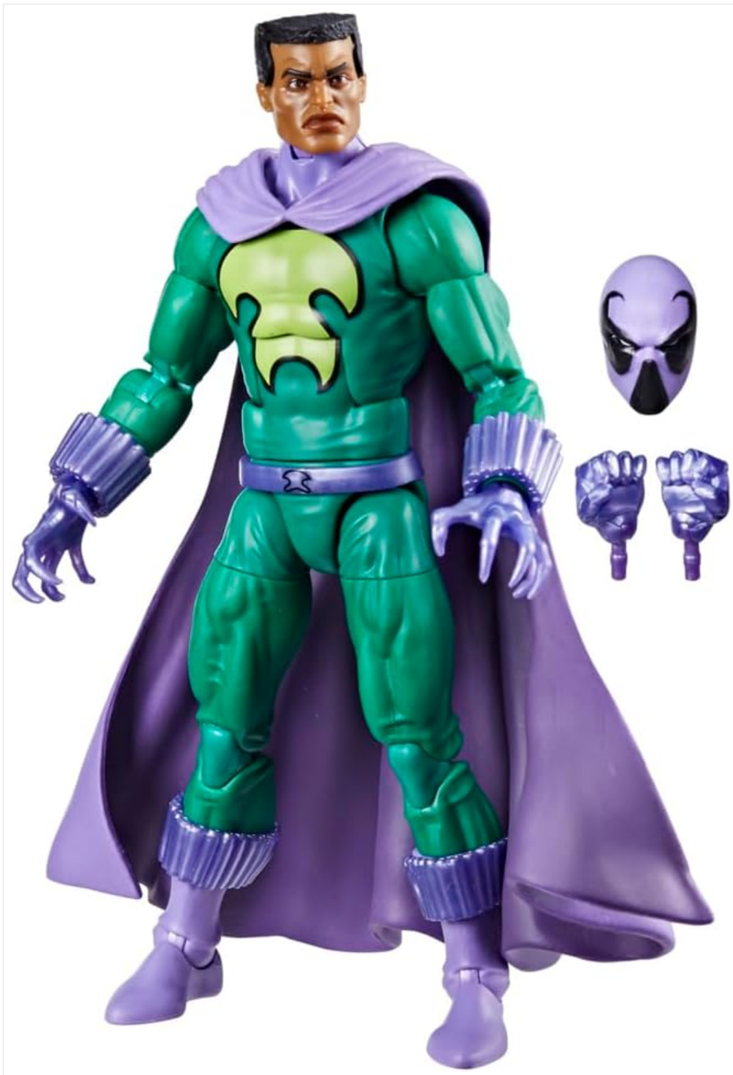
Image: The Marvel's Prowler action figure displayed within its retro-style packaging, highlighting the product's presentation.