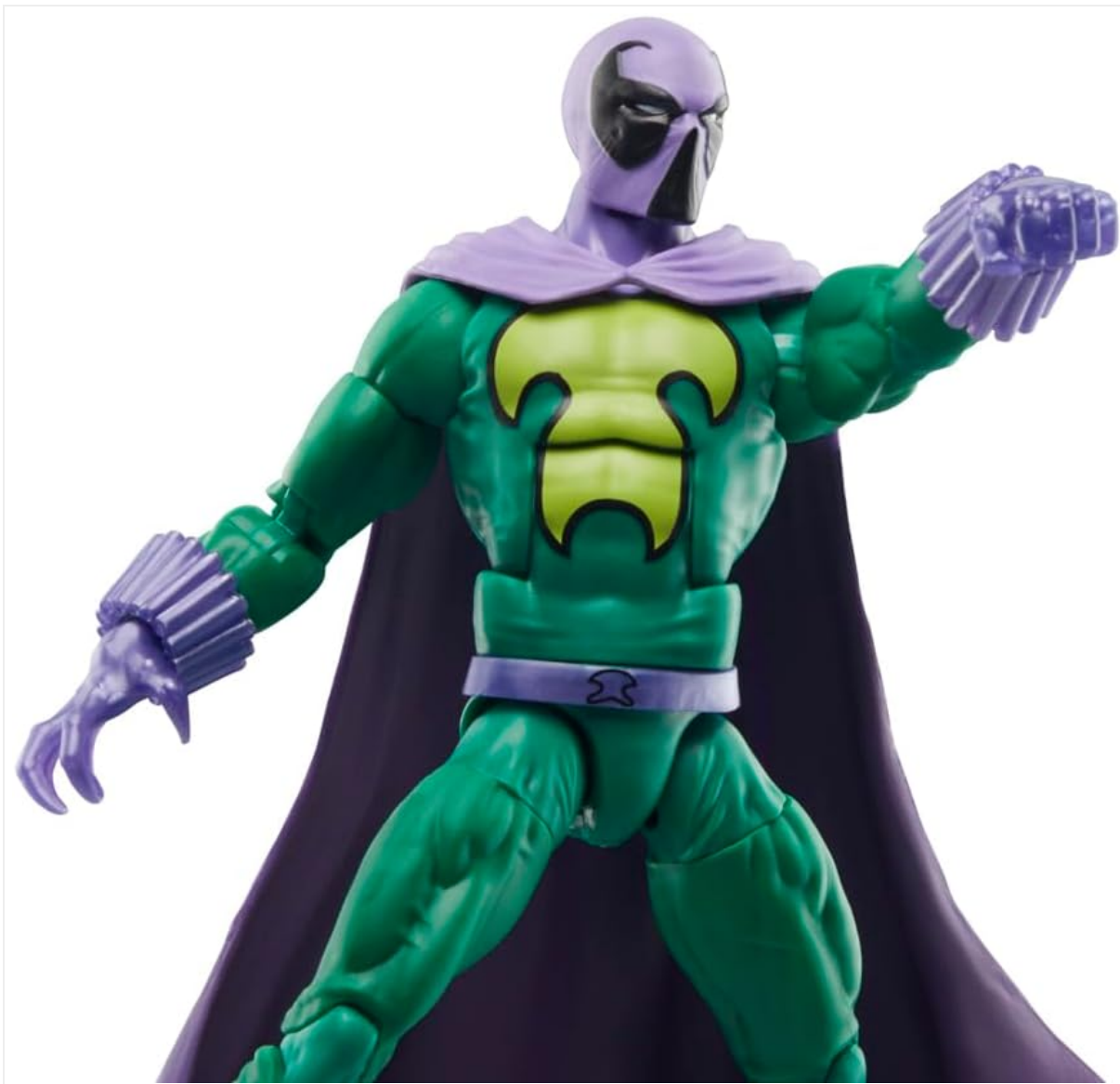
Image: The Marvel's Prowler action figure displayed alongside its detachable mask and two interchangeable clawed hand accessories.