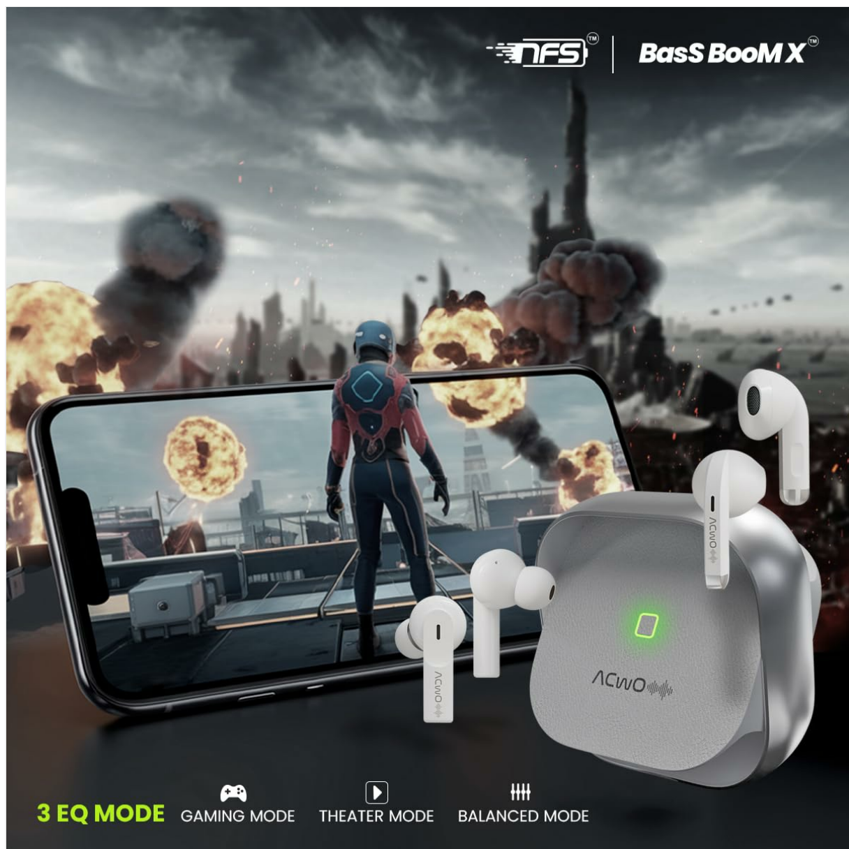
Image: ACwO DwOTS Fire earbuds with a visual representation of available EQ modes.