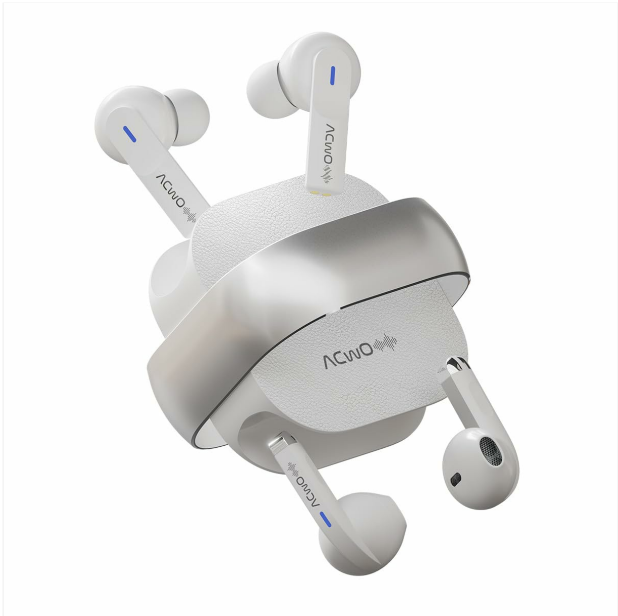
Image: The ACwO DwOTS Fire earbuds and charging case.