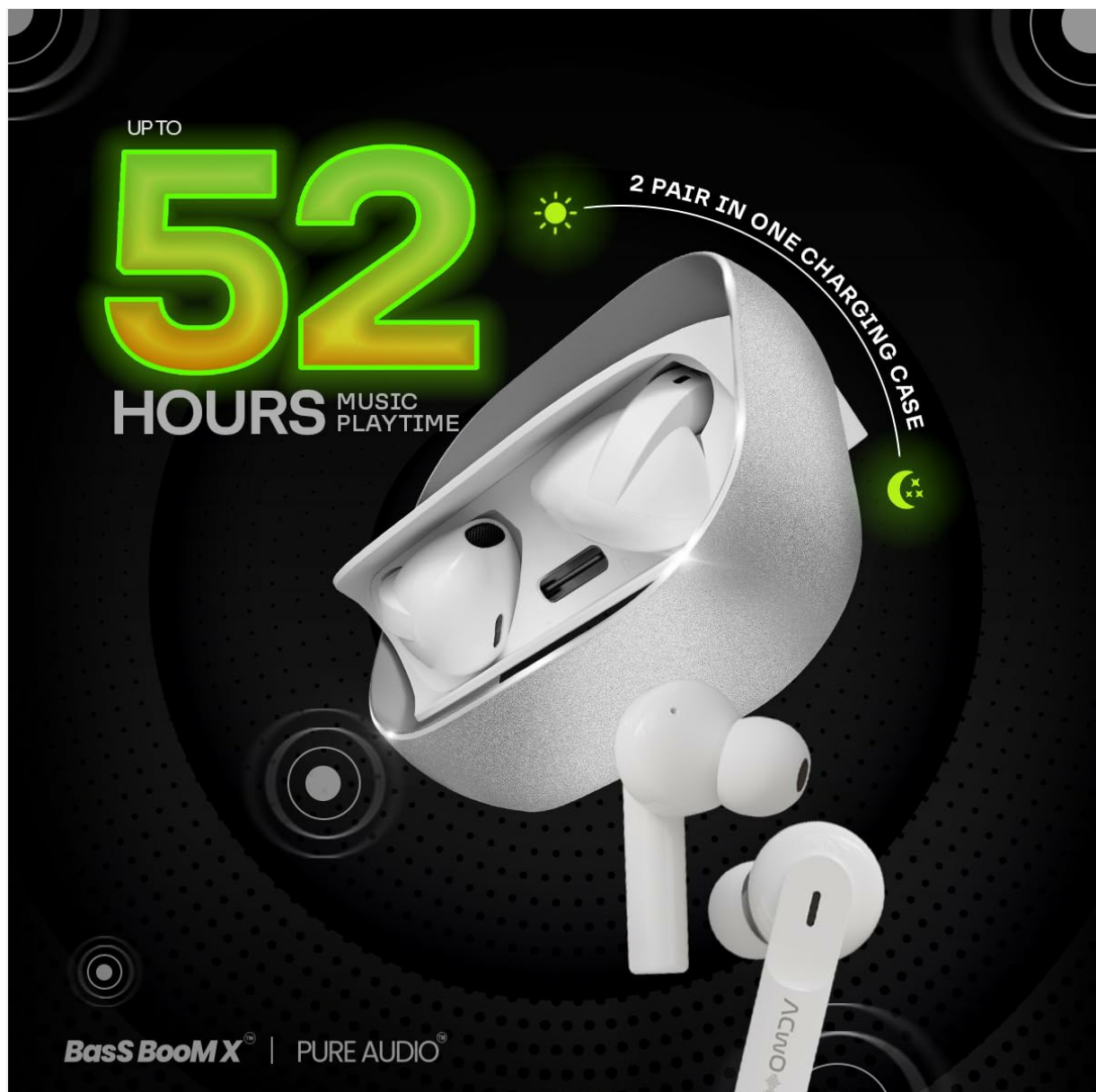
Image: ACwO DwOTS Fire charging case highlighting 52 hours of playtime.