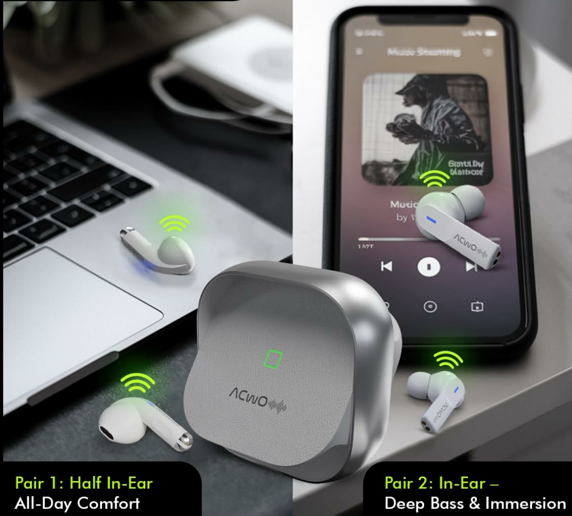
Image: ACWO DwOTS Fire earbuds showcasing both half-in-ear and in-ear styles from a single case.

One Case. Two Styles. One for Work, One for Play!