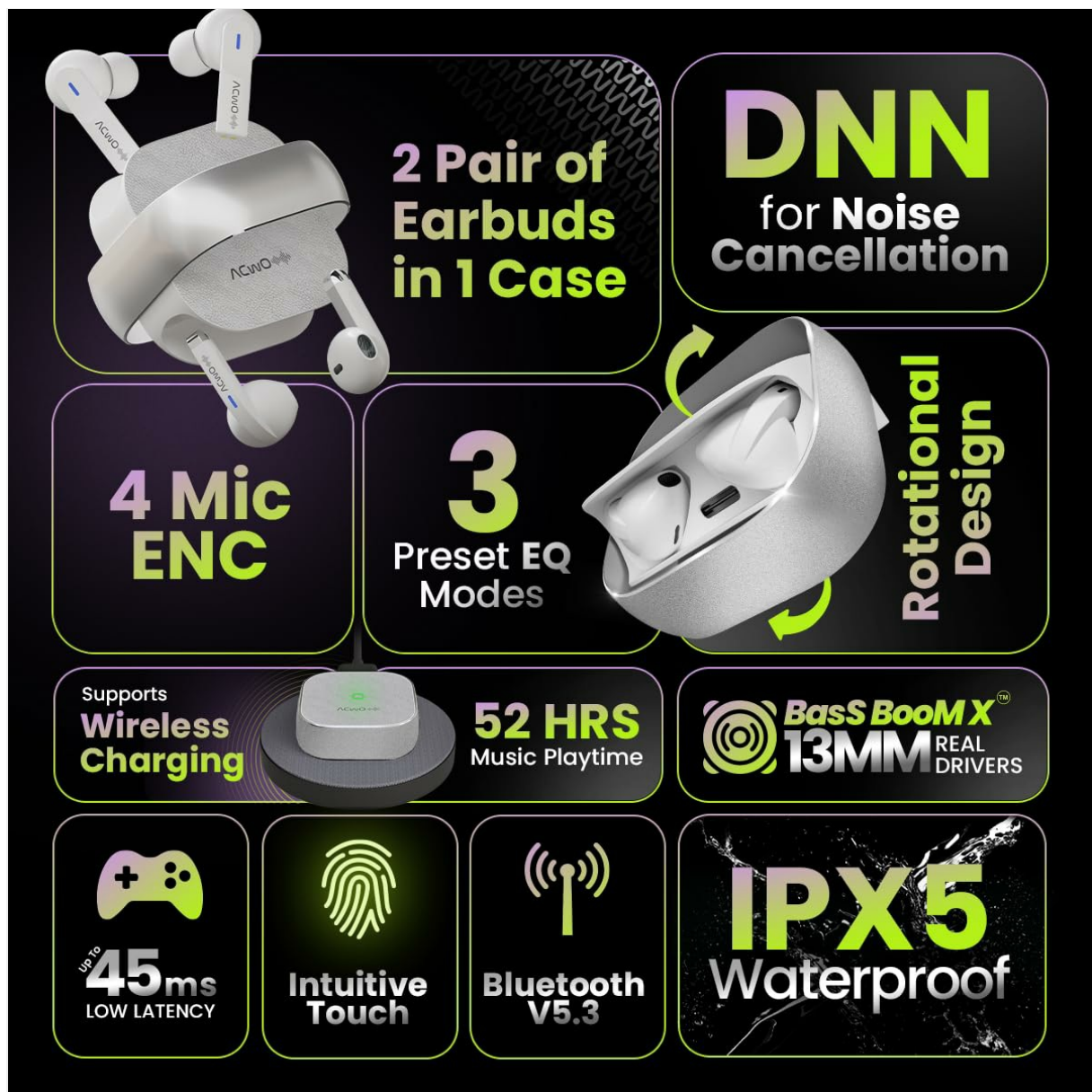
Image: Summary of ACwO DwOTS Fire key features.