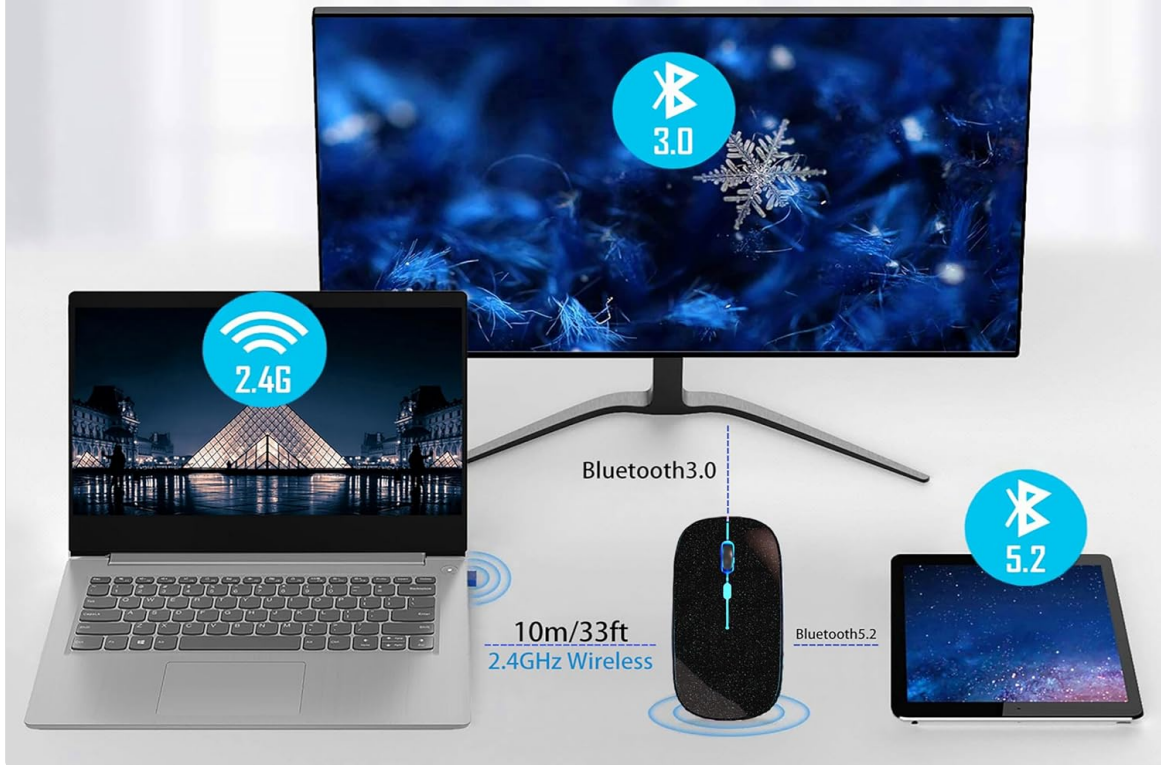
Image 2.2: Illustration of the dual mode connectivity, supporting both 2.4G wireless and Bluetooth 3.0/5.2.