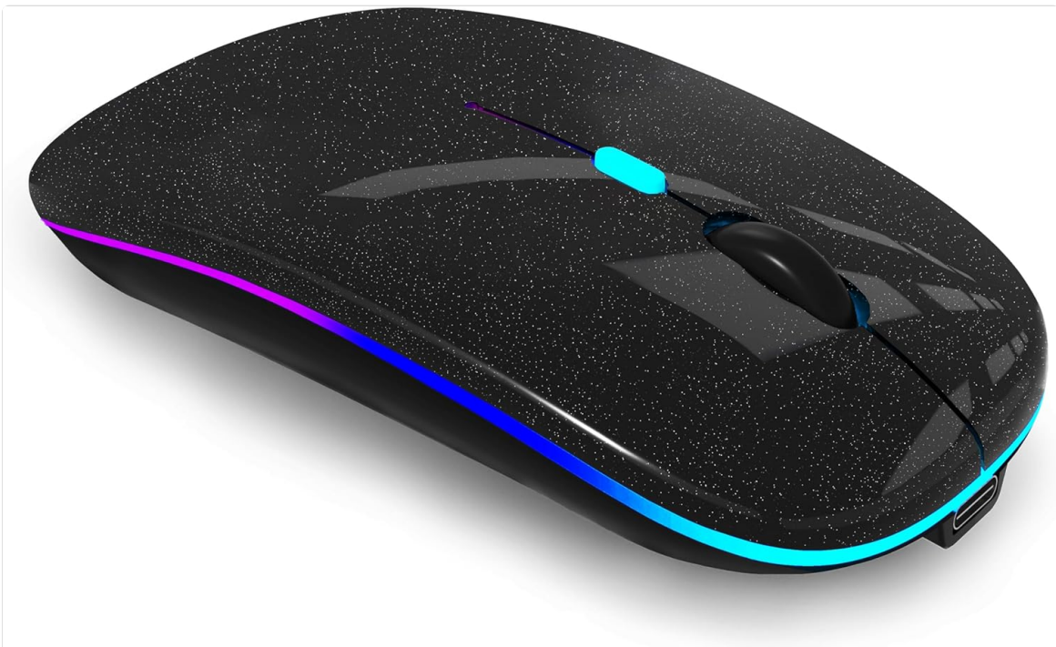
Image 1.1: Overview of the WREANU Dual Mode Wireless Bluetooth Mouse.

The WREANU Dual Mode Wireless Bluetooth Mouse offers versatile connectivity and ergonomic design for enhanced productivity. Featuring both Bluetooth (BT5.2/3.0) and 2.4G wireless modes, it allows seamless switching between two devices. Its silent click design ensures a quiet working environment, while the vibrant LED breathing lights add a stylish touch. The mouse is rechargeable, eliminating the need for disposable batteries, and offers adjustable DPI levels for precise control.