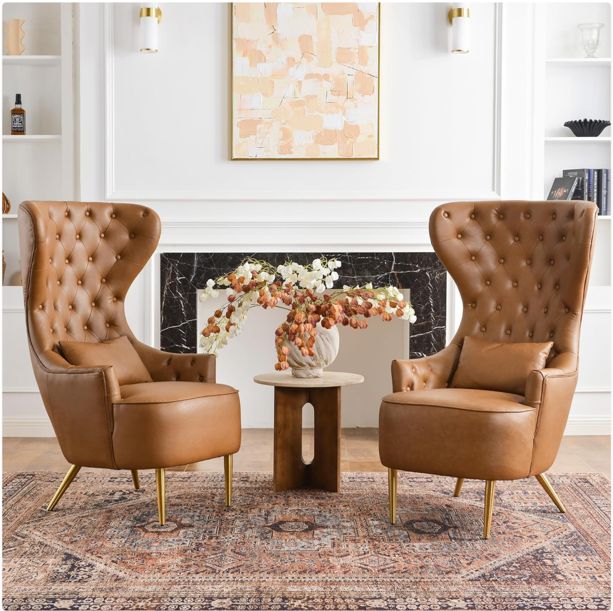
Image: Two KINWELL Faux Leather Tufted High Wingback Chairs in a living room.