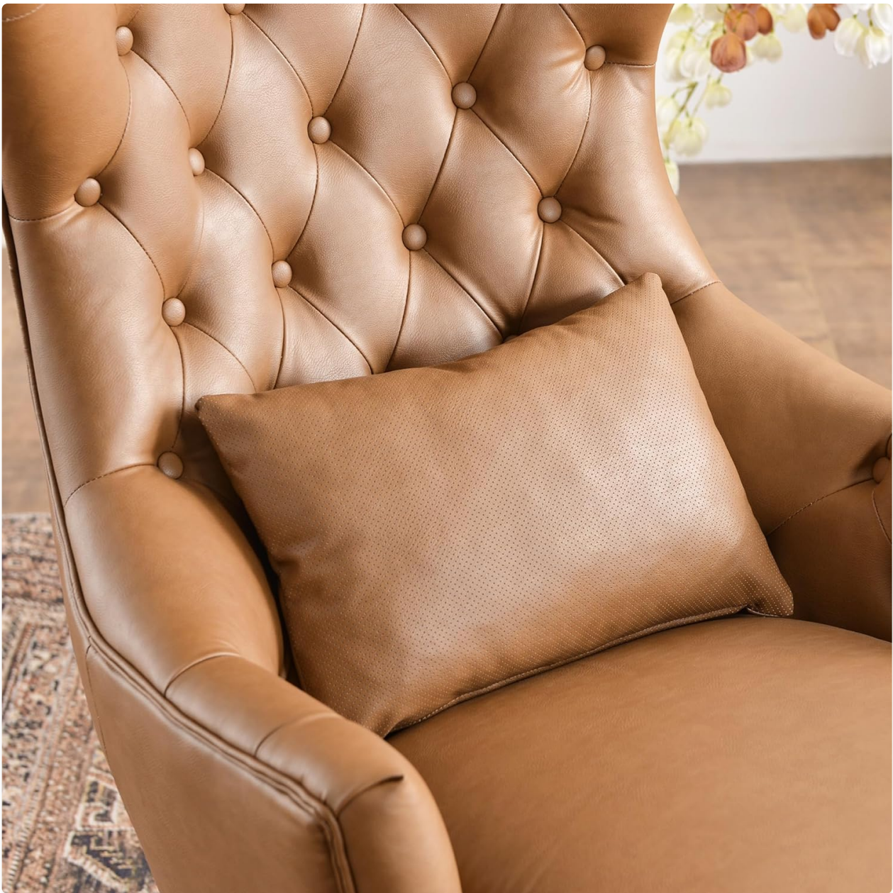
Image: Detail of the lumbar toss pillow.