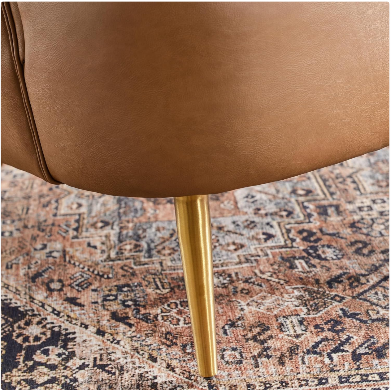
Image: Detail of the gold metal leg.