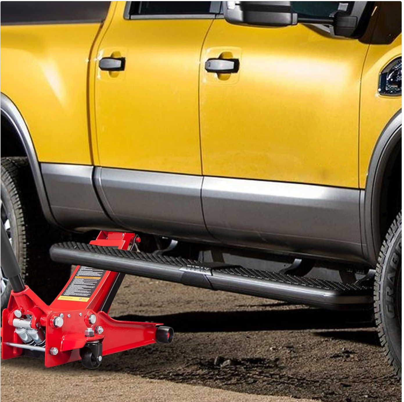
Figure 2: Proper placement of the floor jack under a vehicle.