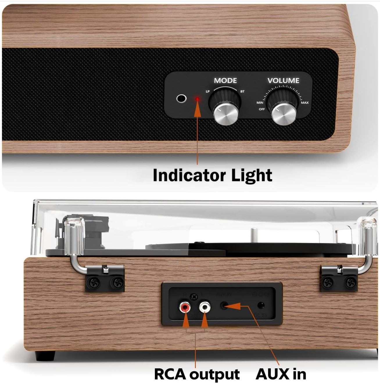
Image 4.2: Turntable Front and Rear Panels. This image highlights the Indicator Light, Mode/Power knob, Volume knob on the front, and the RCA Output and AUX In ports on the rear.