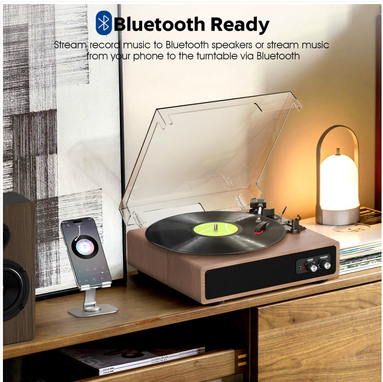
Image 6.3: Bluetooth Streaming. The turntable can stream audio from records or AUX input to a Bluetooth-enabled speaker, offering flexible listening options.