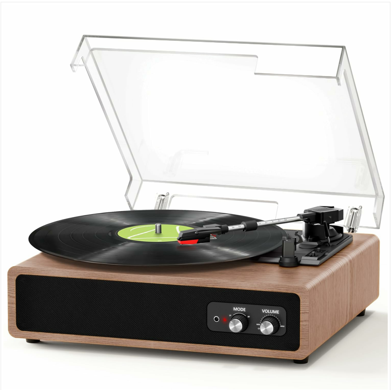
Image 6.1: Record Size Compatibility. The turntable supports 7-inch, 10-inch, and 12-inch vinyl records, with a 45 RPM adapter