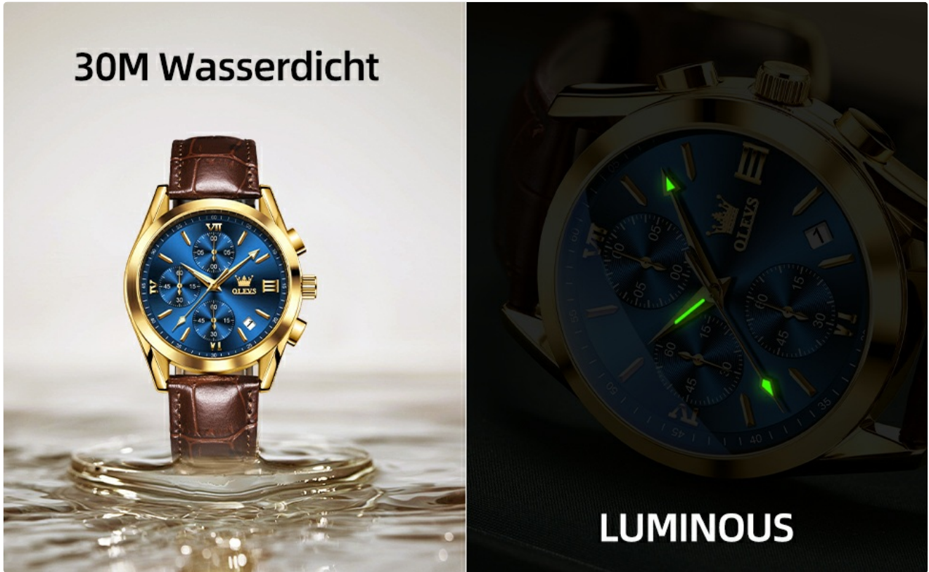
Detailed view of the watch's stainless steel case, scratch-resistant mineral glass, and comfortable leather strap.

When not wearing your watch, store it in a dry place, away from direct sunlight and strong magnetic fields (e.g., speakers, refrigerators), which can affect its accuracy.