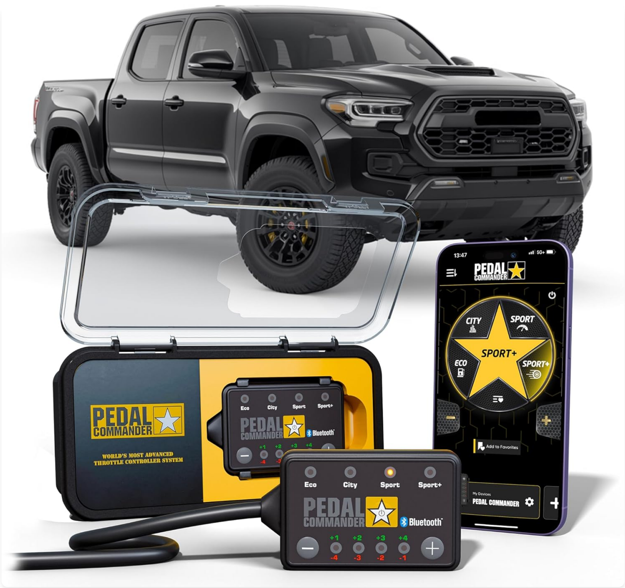
Image: The PEDAL COMMANDER unit, its mobile application interface, and a compatible Toyota Tacoma truck.