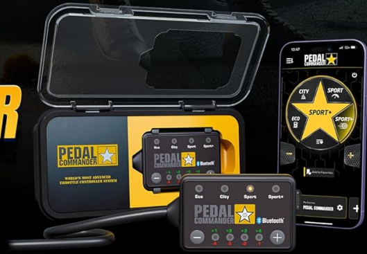
Image: Promotional graphic for the Pedal Commander's anti-theft mode, emphasizing enhanced vehicle security.

$0.99 A MONTH $9.99 WHOLE YEAR 14 DAY FREE TRIAL