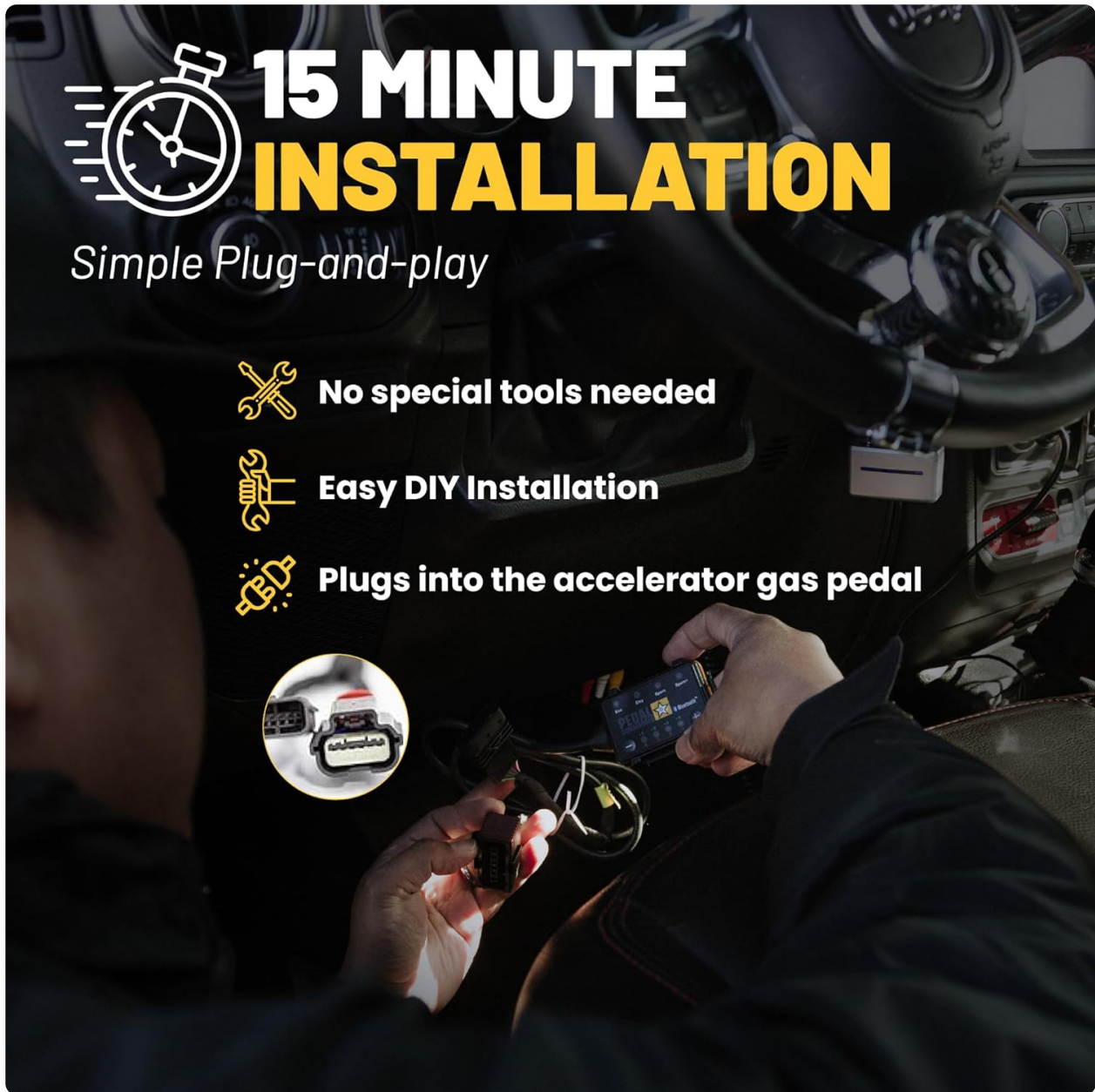
Image: A close-up view of the Pedal Commander being installed in a vehicle's footwell, emphasizing the quick and easy process.

*Follow these instructions to avoid potential issues. Confirm a secure connection by hearing a "click" sound while connecting plugs.