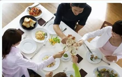
In The Restaurant

Image: A hand pouring water from a bottle into the Waterpulse Smarbo V580 Water Flosser's tank, illustrating the ease of filling the device for use anywhere.