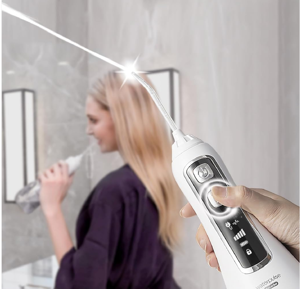
Image: A person using the Waterpulse Smarbo V580 Water Flosser, with text indicating its recommendation for use after meals and before bed, and highlighting its 5 cleaning modes plus 1 massage mode.