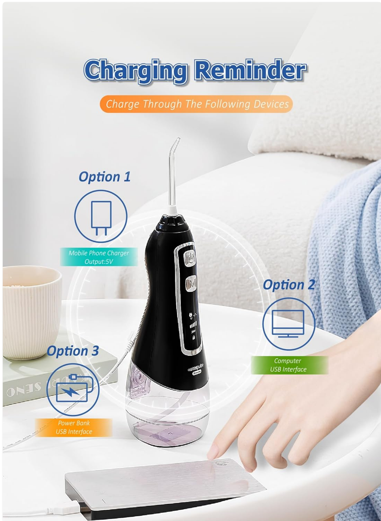
Image: The Waterpulse Smarbo V580 Water Flosser connected to a power bank, illustrating various charging options including a mobile phone charger, computer USB interface, and a power bank.

Connect the provided USB charging cable to the Micro USB port on the device. Plug the other end into a compatible power source such as a mobile phone charger (5V output), a computer USB interface, or a power bank. The charging indicator will show the charging status. A full charge typically takes several hours.