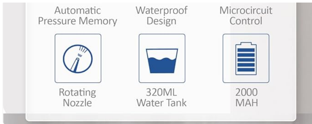
Image: Two Waterpulse Smarbo V580 units (black and white) displayed in a bathroom setting, surrounded by icons illustrating its key features such as massage function, charging reminder, multiple pressure settings, automatic pressure memory, waterproof design, microcircuit control, rotating nozzle, 320ml water tank, and 2000mAh battery.