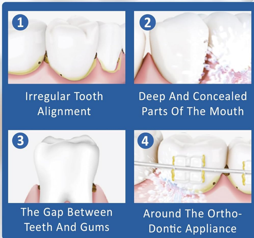
Image: A visual representation of the 360-degree rotating nozzle and its ability to clean various dental areas, including irregular tooth alignment, deep and concealed parts of the mouth, gaps between teeth and gums, and around orthodontic appliances.