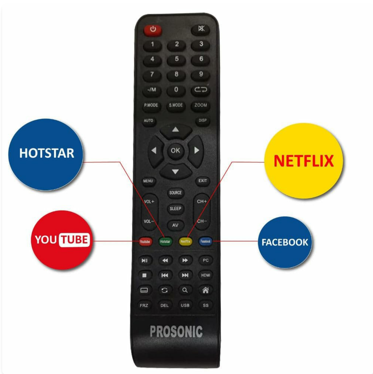
Figure 3: Prosonic TV remote control highlighting dedicated app buttons for quick access.