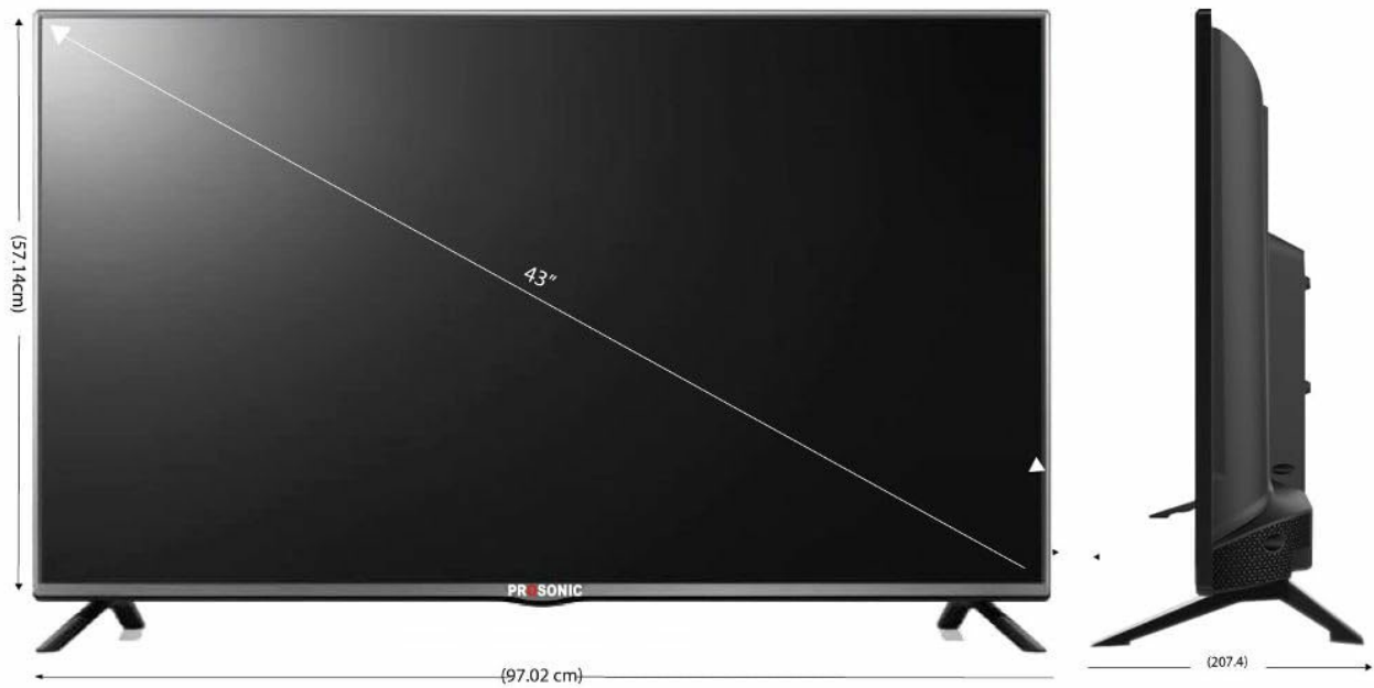
Figure 2: Prosonic TV dimensions and side profile for setup planning.