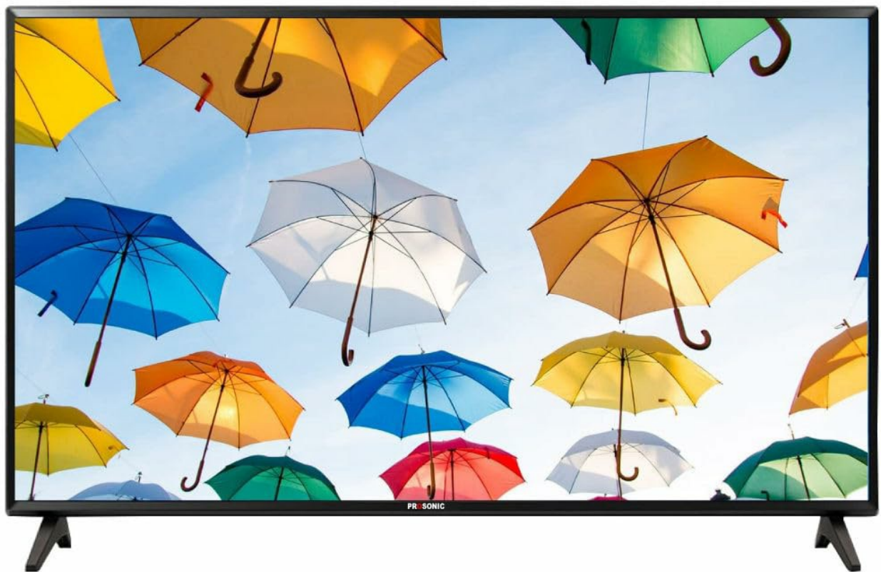
Figure 1: Front view of the Prosonic 43-inch 4K Ultra HD Smart Android LED TV.