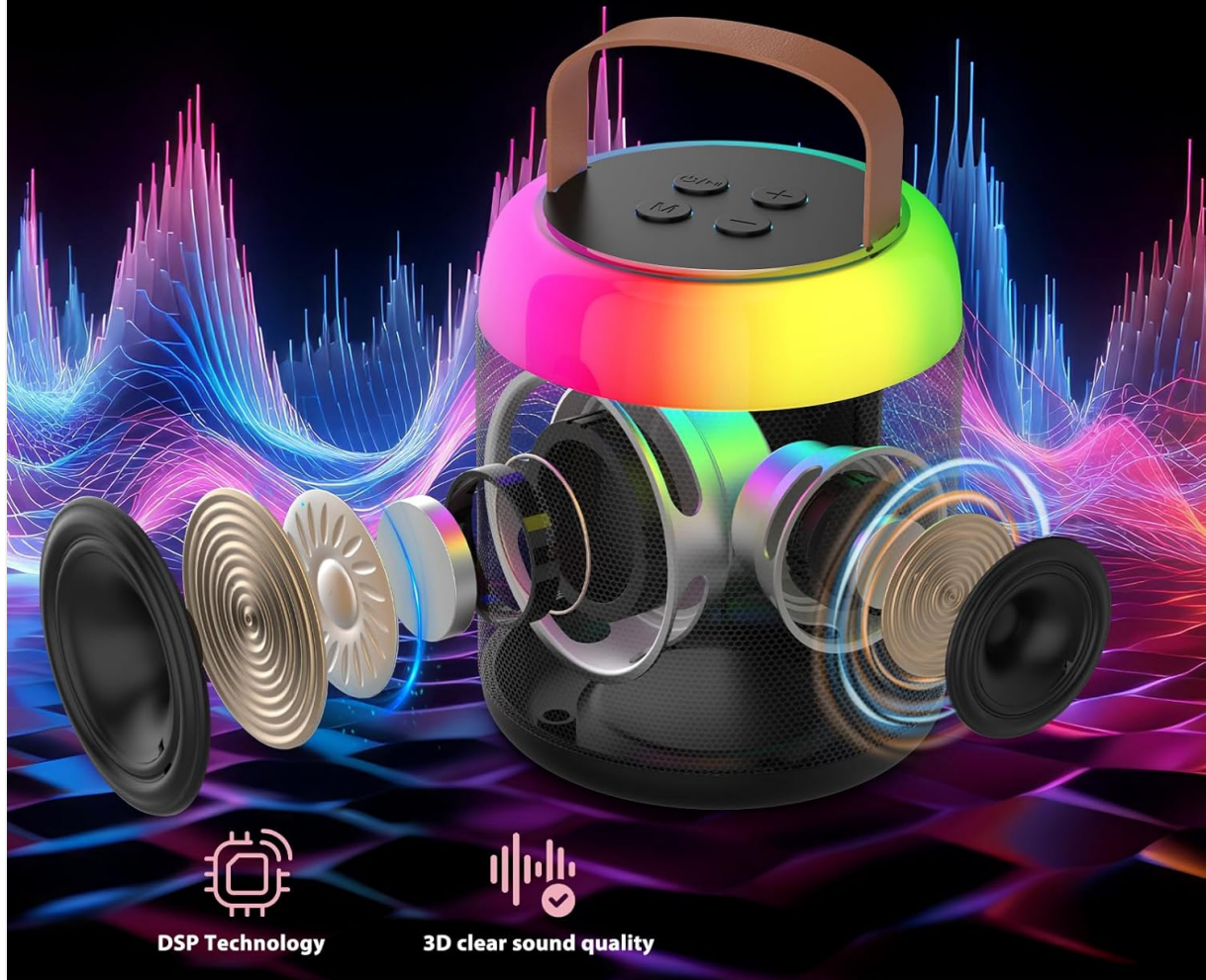
Figure 4.3: Internal components highlighting DSP technology for clear sound.

Feel the music like never before, every note comes alive