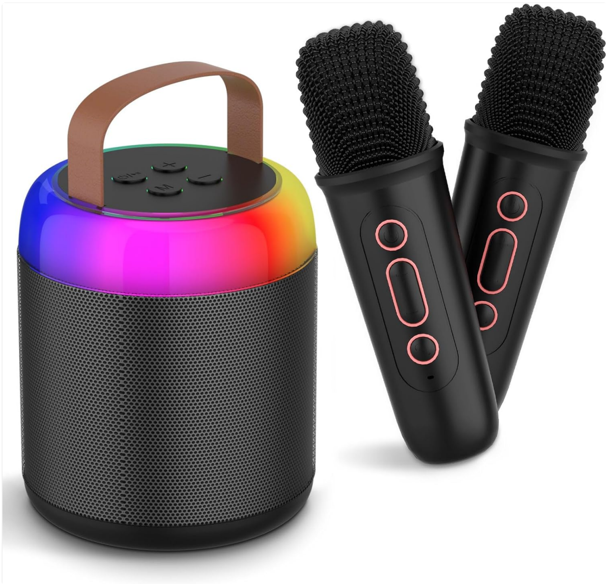
Figure 1.1: heetipuk Y2 Mini Karaoke Machine and two wireless microphones.