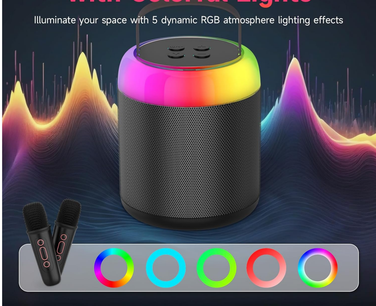
Figure 4.2: Speaker with dynamic RGB lighting effects.

Illuminate your space with 5 dynamic RGB atmosphere lighting effects