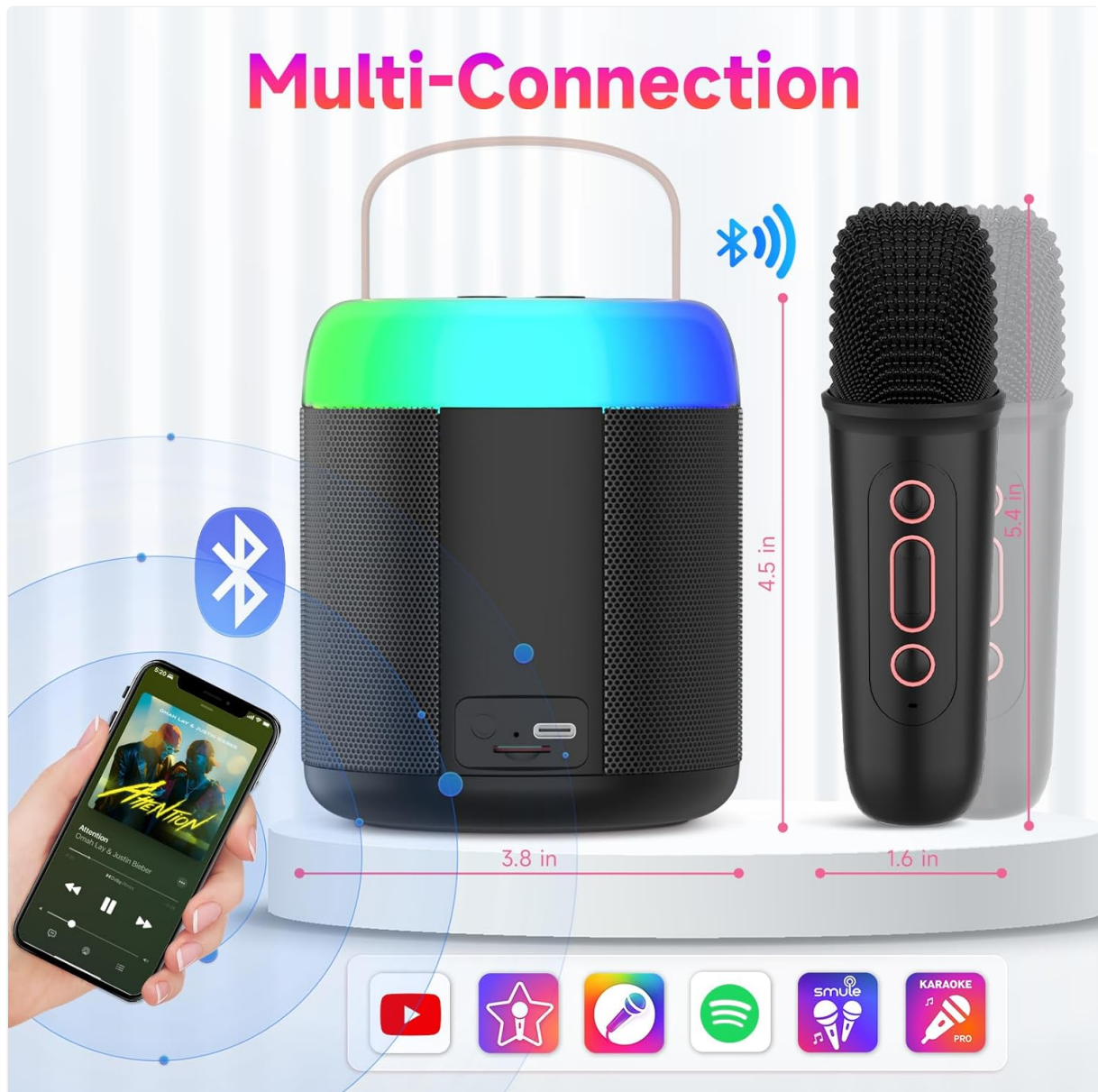
Figure 3.1: Multi-connection options including Bluetooth, TF card slot, and headphone jack.