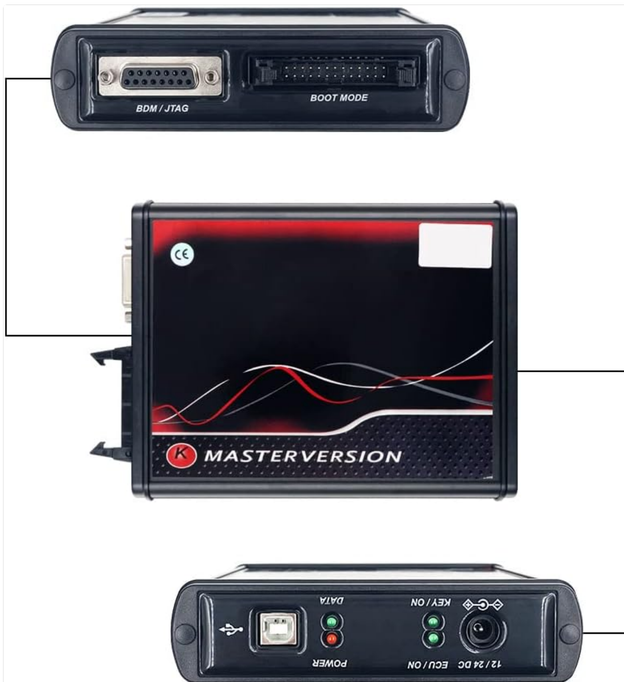
Figure 6: KTAG unit connection diagram.