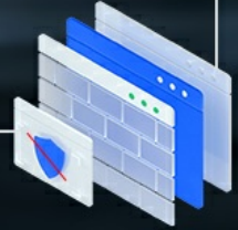
Figure 5: Important notice for software installation.