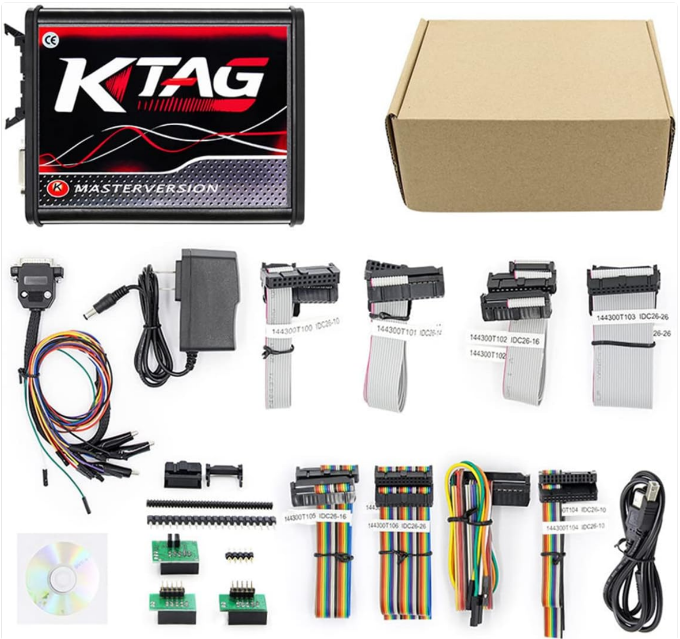
Figure 1: QKVCX KTAG V7.020 V2.25 Professional ECU Diagnostic Set.