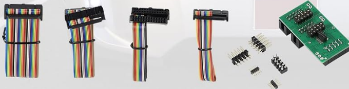
Figure 3: All components included in the KTAG V7.020 V2.25 package.