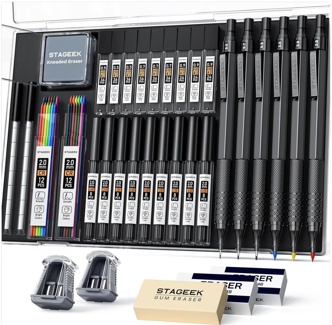
Image: Overview of the STAGEEK Mechanical Pencil Set, showcasing all included pencils, lead refills, sharpeners, and erasers neatly organized in their storage case.