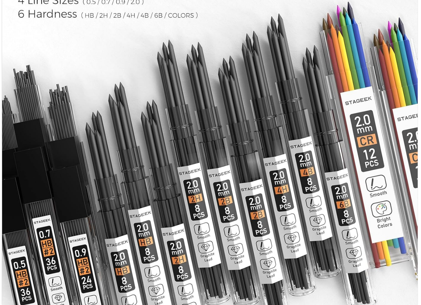
Image: A detailed view of the 384 pieces of resin lead refills, including various sizes (0.5mm, 0.7mm, 0.9mm, 2.0mm) and hardnesses, along with colored leads.