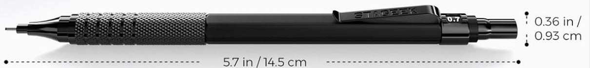
Image: A visual guide highlighting the retractable nib for protection and the easily replaceable eraser feature of the mechanical pencils.