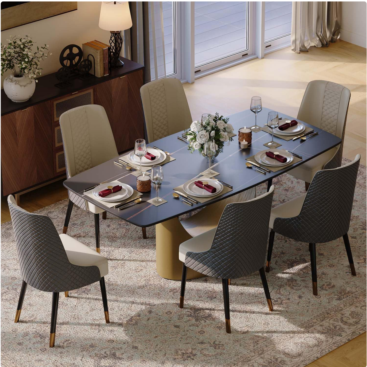
Image 5.1: A detailed view highlighting the 12mm thick sintered stone tabletop, the carbon steel base for stability, and the adjustable feet for leveling.