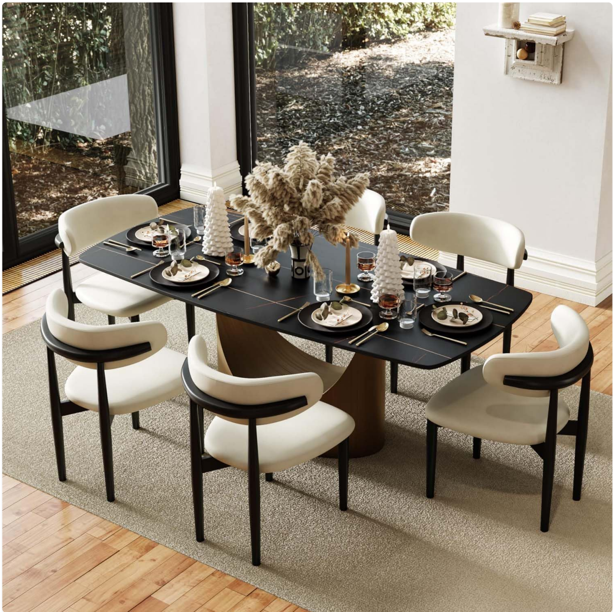
Image 1.1: The POVISON Hobart 79-inch Modern Rectangle Dining Table in a dining room setting, showcasing its design and seating capacity.