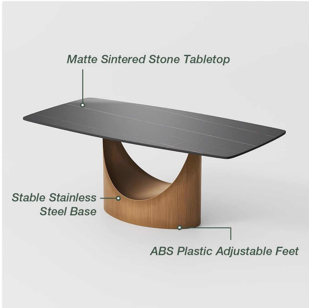
Image 3.1: An exploded diagram illustrating the main components of the dining table, including the tabletop, base, and adjustable feet.