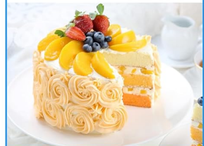
Cream, Egg White, Sauce

Image: Visual guide to the three mixer attachments and their recommended uses.