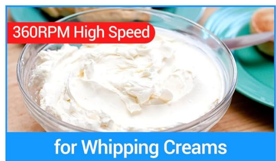
Image: The speed control lever and recommended RPMs for different mixing tasks.