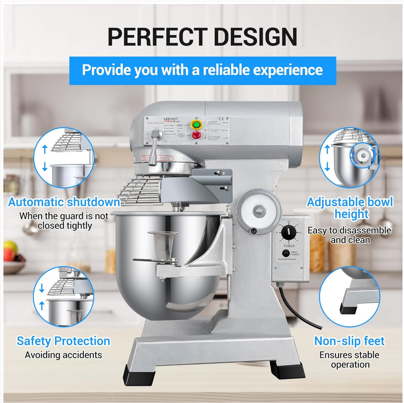
Image: Detail of the mixer's non-slip feet for stable operation and the bowl height adjustment mechanism.