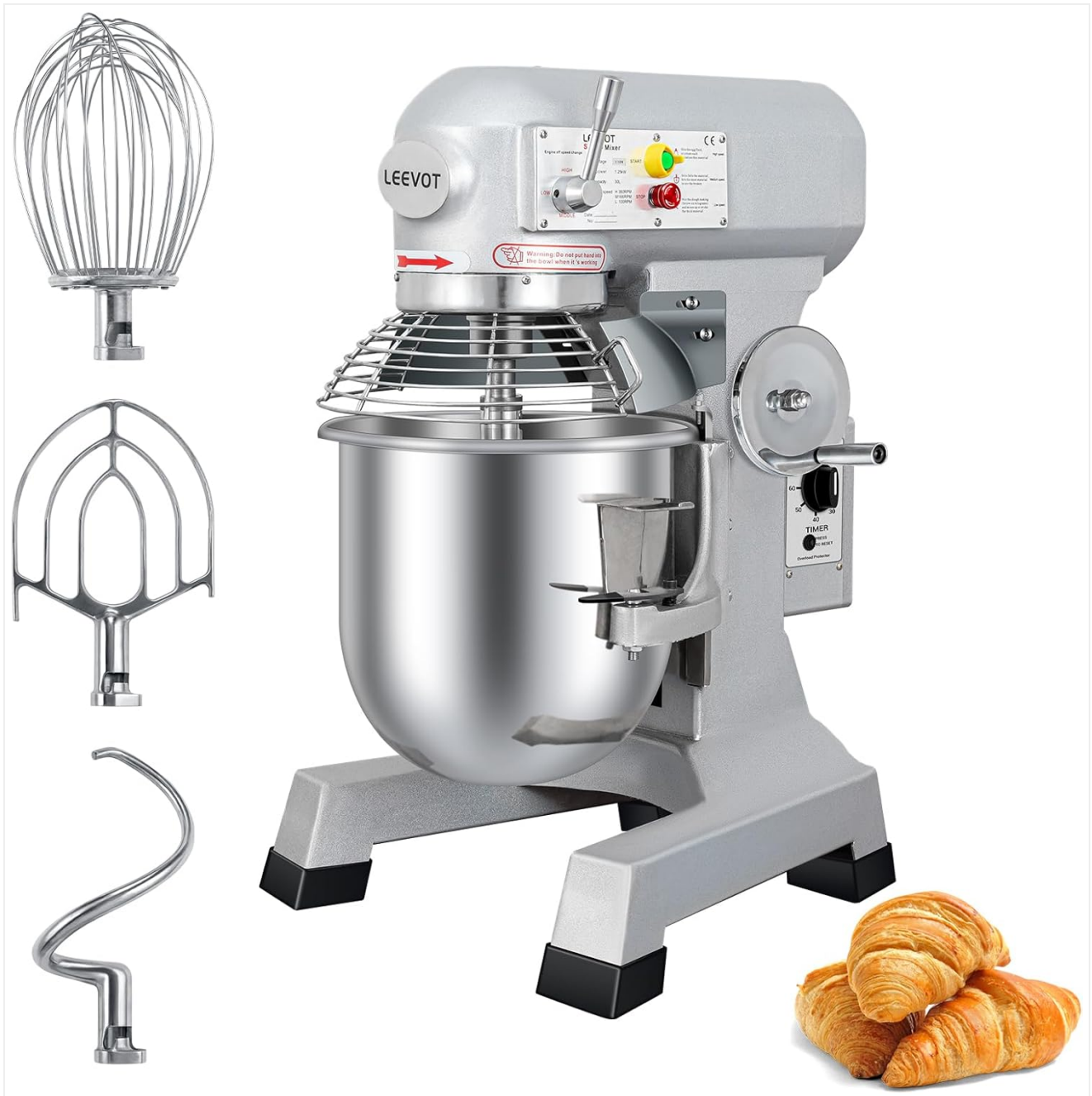
Image: The LEEVOT 30Qt Commercial Food Mixer shown with its three primary attachments: dough hook, flat beater, and wire whip.

The LEEVOT 30Qt Commercial Food Mixer is a heavy-duty stand mixer designed for commercial kitchen environments. It features a robust 1250W motor and a 30-quart stainless steel bowl, capable of mixing up to 22 pounds of dough or 11-17.63 pounds of dry flour per batch.