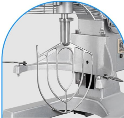
Flat Beater Medium and heavy duty mixtures