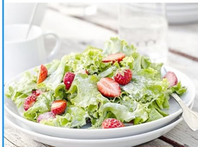
Salad, Cookie, Crepe