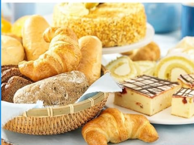
Bread, Pizza, Spaghetti