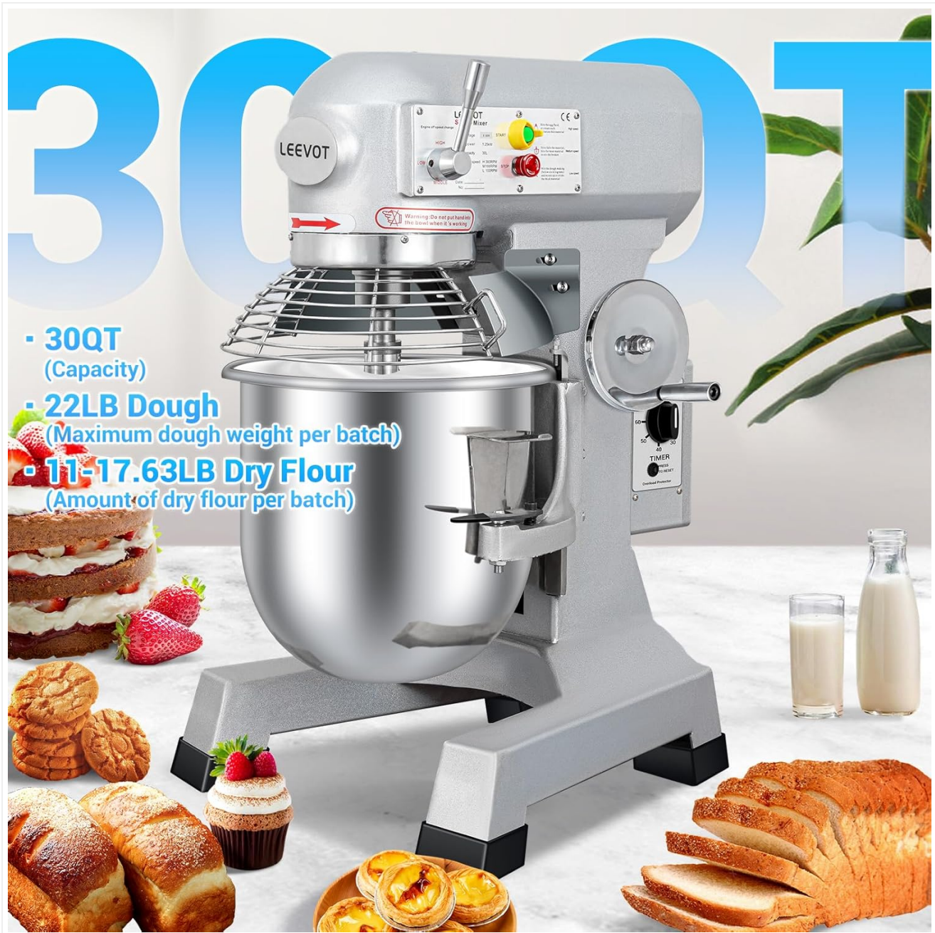
Image: The mixer with an overlay indicating its 30QT capacity and maximum dough and dry flour limits.