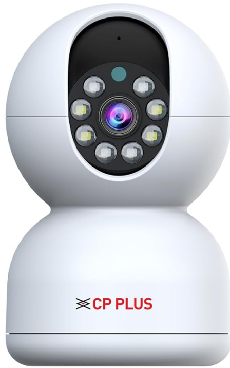
Image: Front view of the CP PLUS EZ-P31 Smart Wi-Fi CCTV Camera, showing the lens, IR LEDs, and microphone.