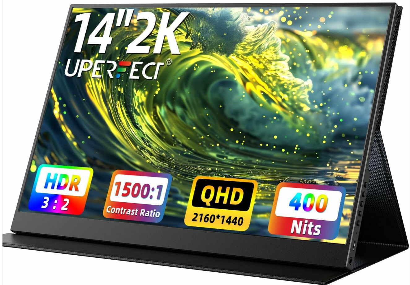
Image 1.1: The UPERFECT 14-inch portable monitor is designed for portability, weighing approximately 1 lb and featuring an ultra-slim profile of 0.2 inches.