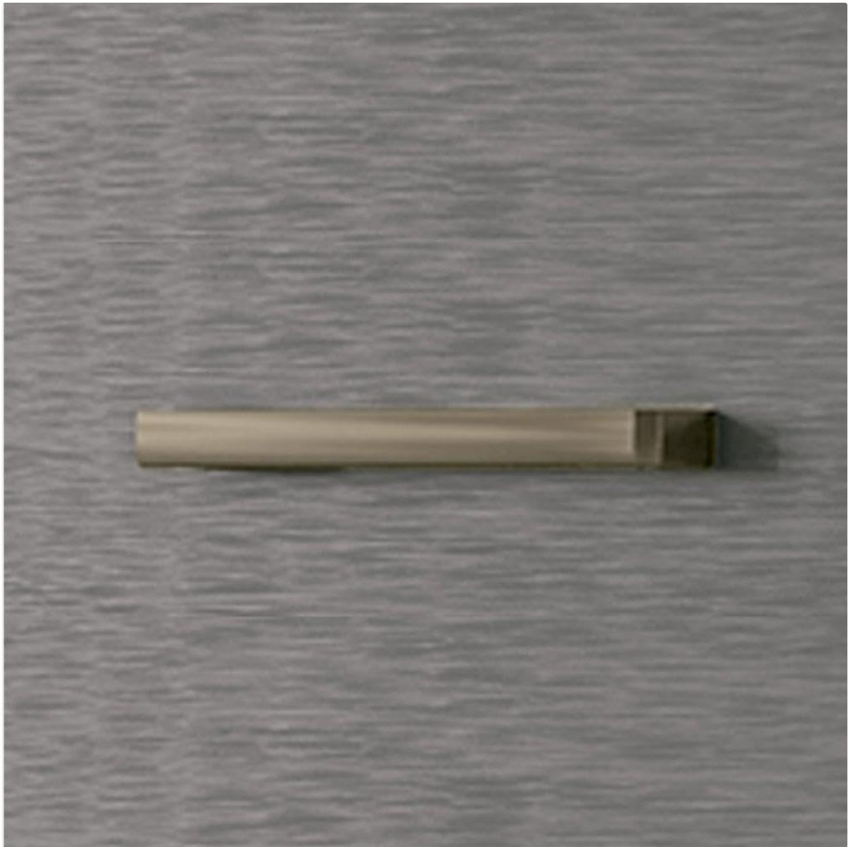
Figure 5.2: Close-up image of a drawer handle, highlighting the design and material.