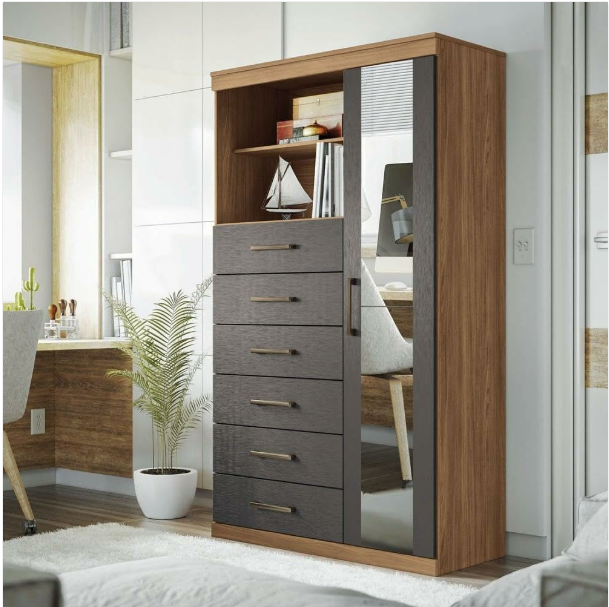
Figure 2.1: Front view of the MadeiraMadeira Multi-Chest of Drawers Marabá with Mirror, showcasing its design with six drawers, a mirrored door, and open shelving.