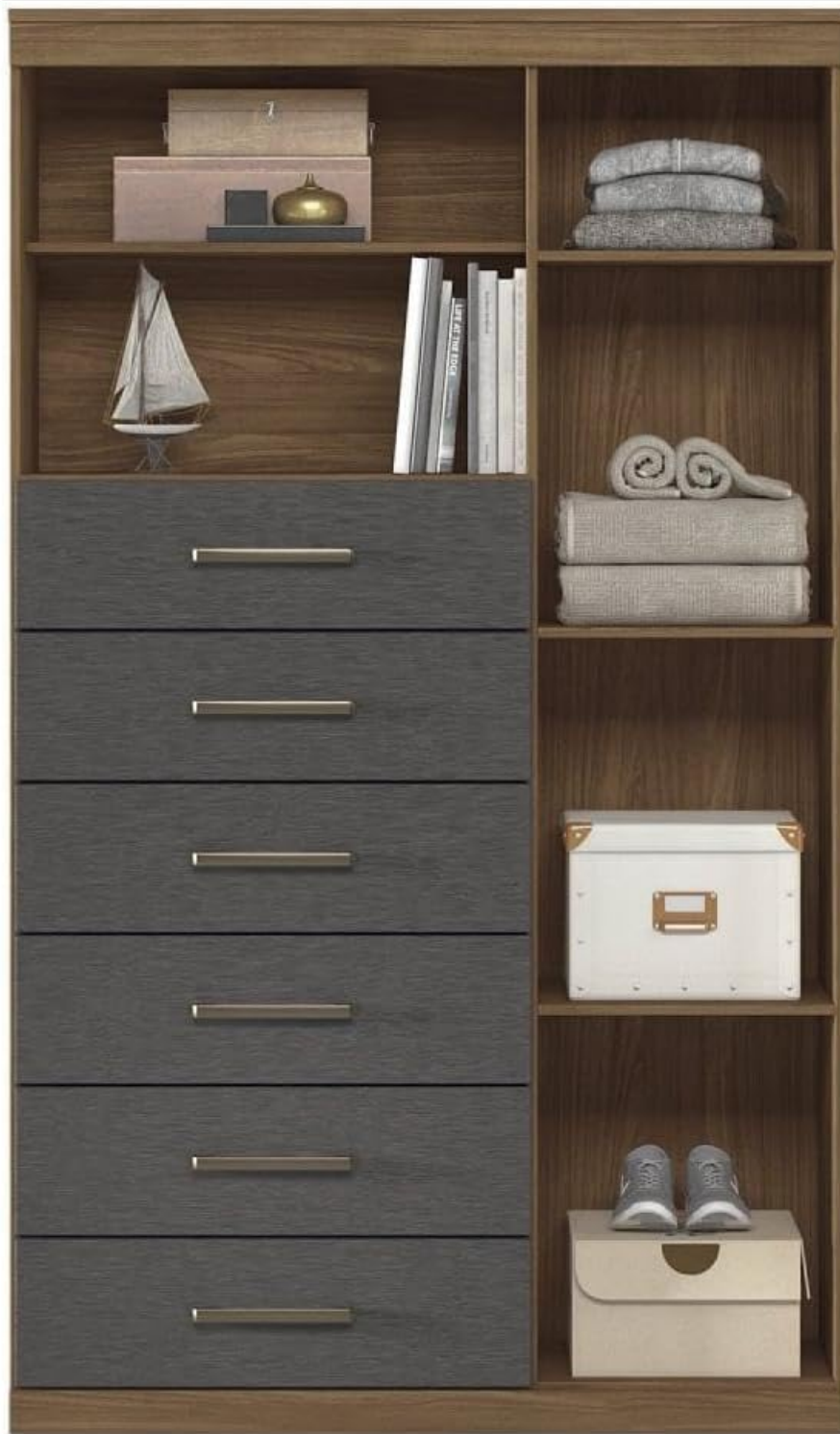
Figure 5.1: Interior view demonstrating the storage capacity of the drawers and shelves, with various items neatly organized.