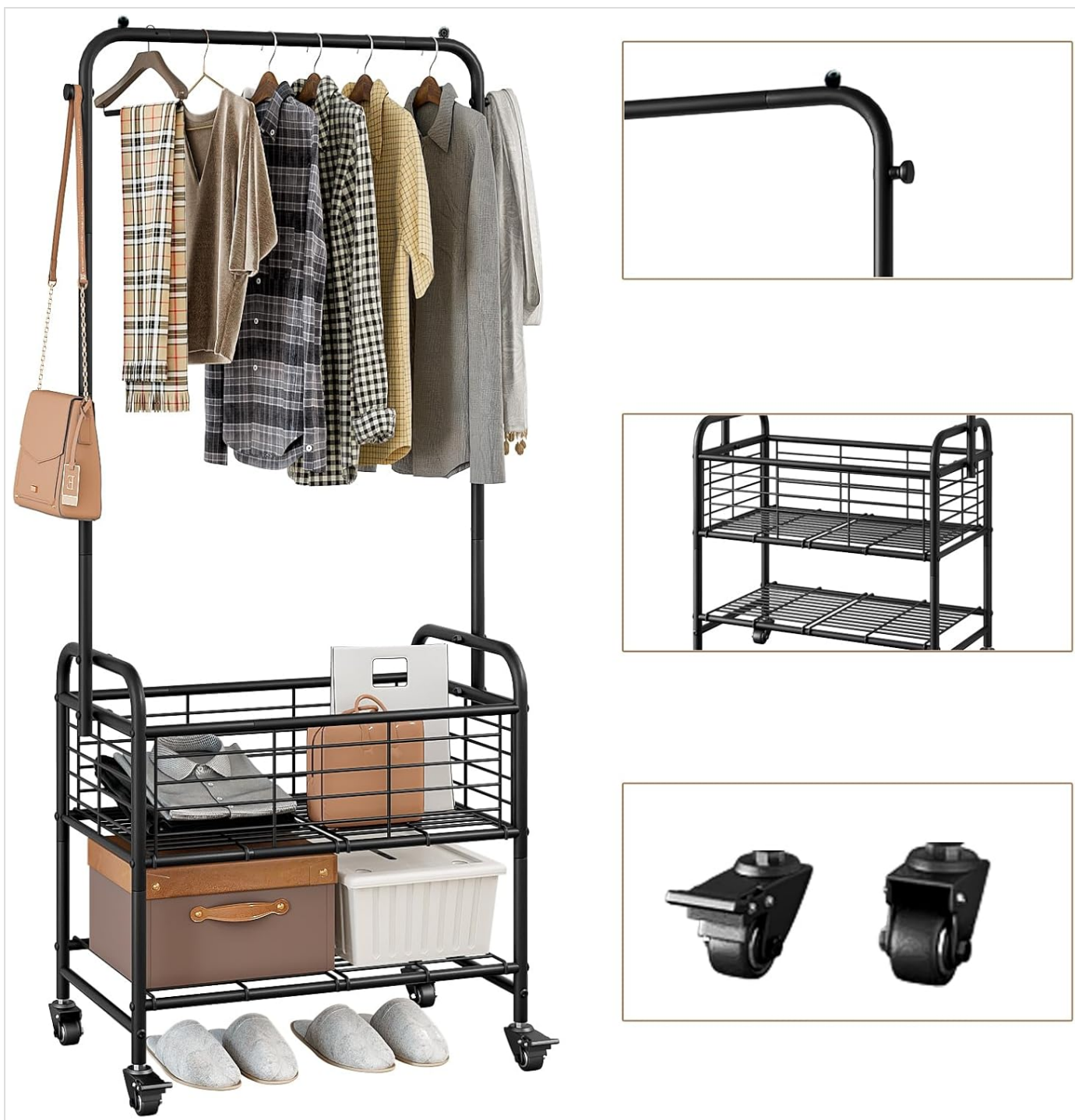
Image: Detailed view of the laundry cart's components, including the adjustable hanging rod, wire basket shelf, lower storage shelf, and lockable caster wheels.