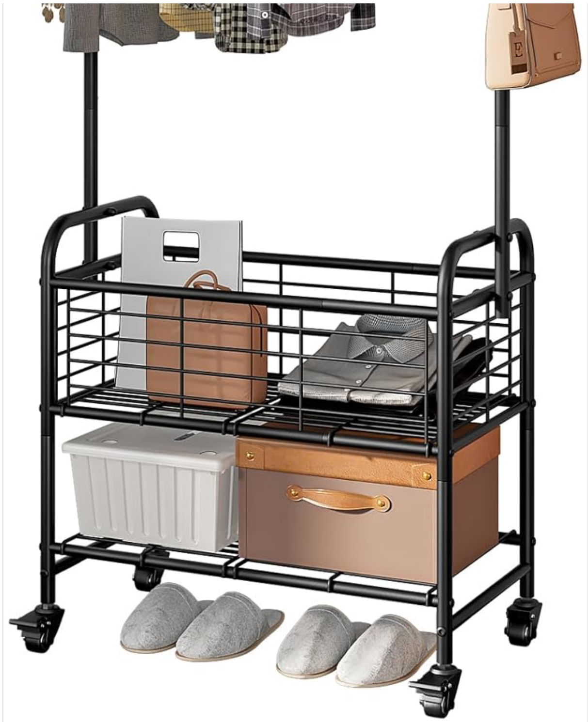
Image: The SUOERNUO Laundry Cart, featuring a hanging rack, a top basket shelf, a lower shelf, and wheels, shown in a black finish.