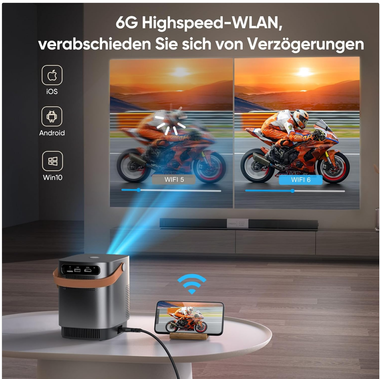
Illustration of the TR23's WiFi 6 capability for faster and more stable wireless screen mirroring compared to WiFi 5.