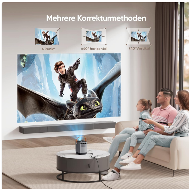
Diagram showing various keystone correction methods including 4-point, horizontal, and vertical adjustments.