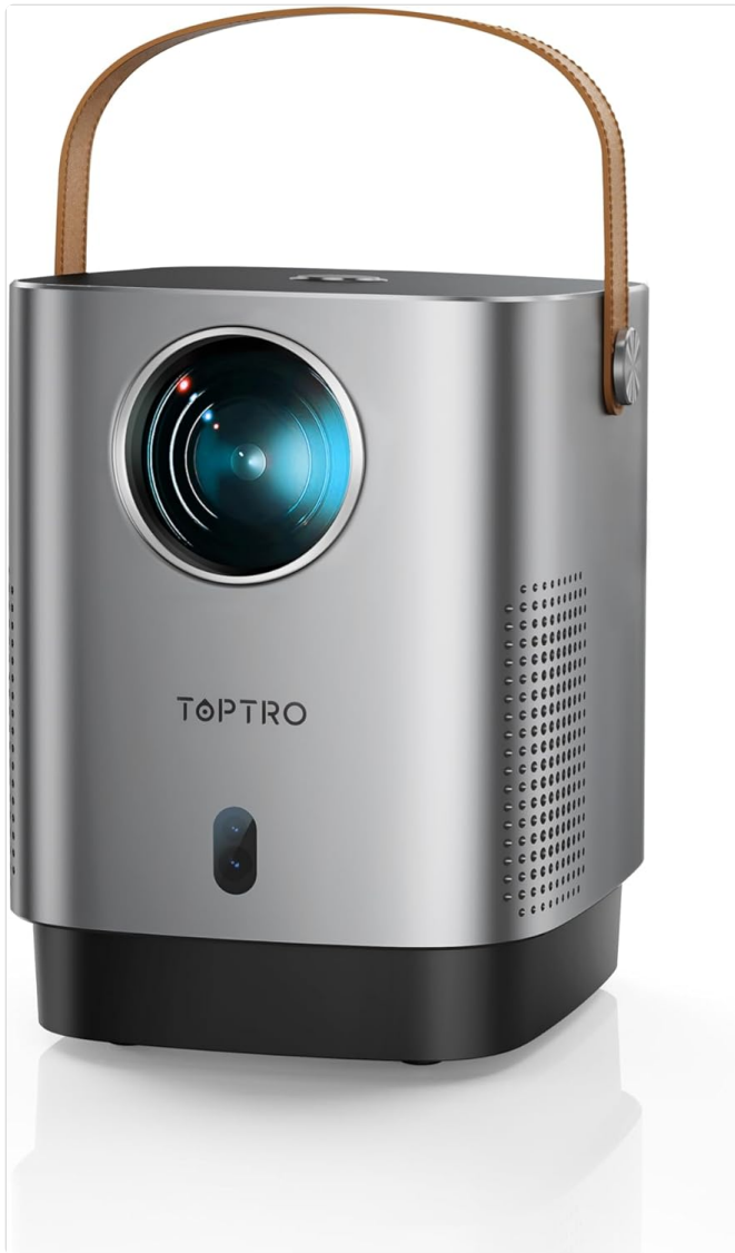
Front view of the TOPTRO TR23 Mini Portable Projector, showcasing its compact design and lens.