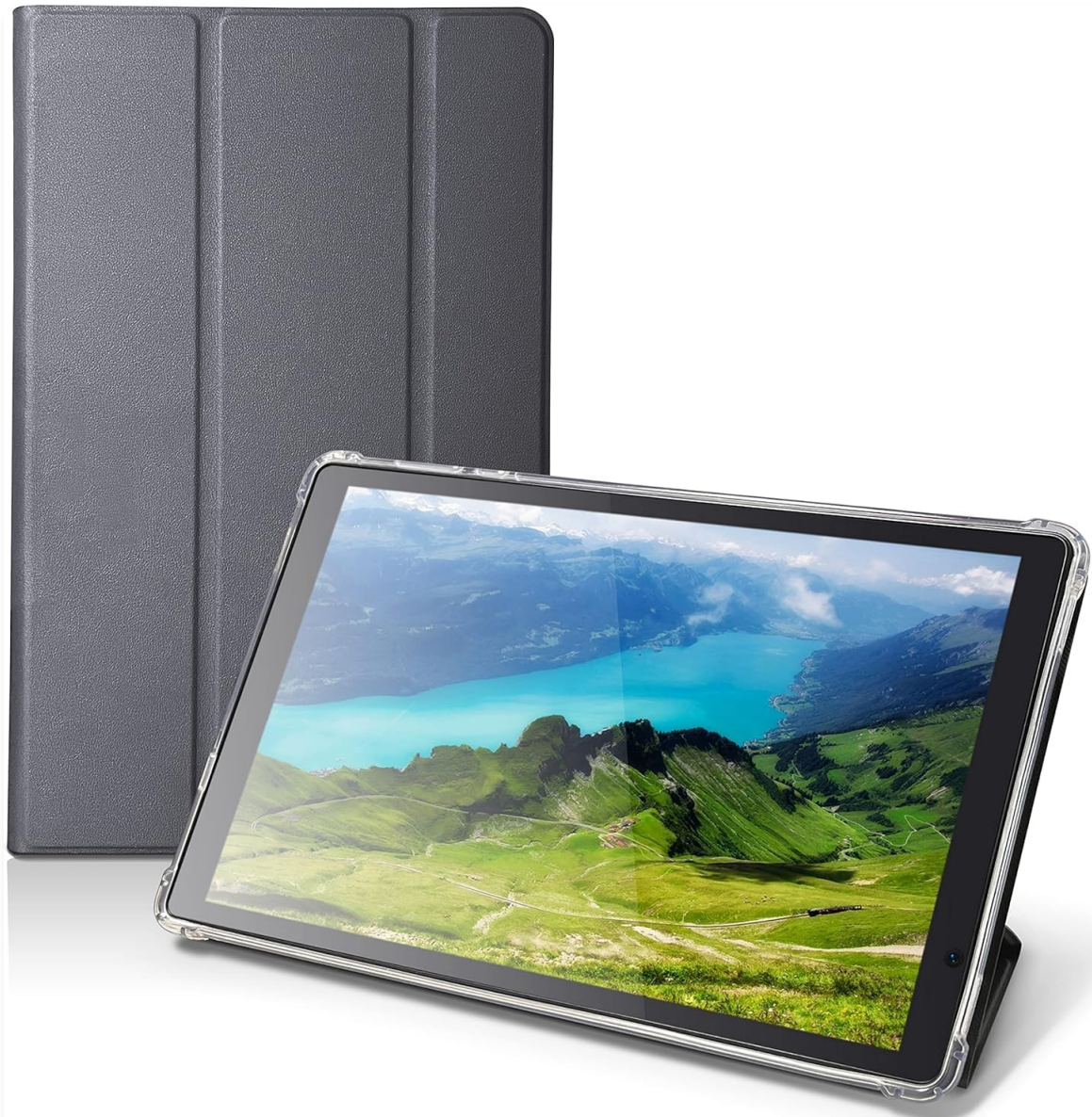
Image: The Tibuta Android 13 Tablet shown with its protective case, highlighting the device's sleek design and the added protection provided by the case.