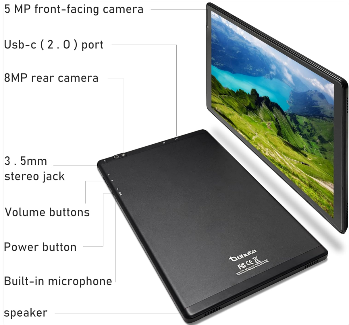
Image: A detailed diagram illustrating the location of the 5MP front-facing camera, USB-C (2.0) port, 8MP rear camera, 3.5mm stereo jack, volume buttons, power button, built-in microphone, and speaker on the Tibuta tablet.