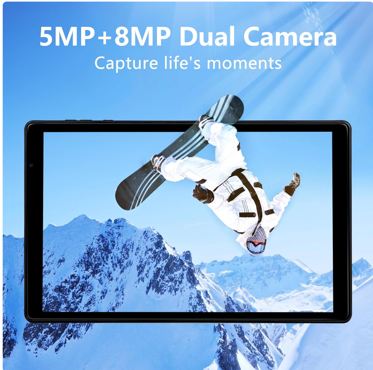
Image: The tablet screen displaying a vibrant image, illustrating the quality of photos captured by its 5MP front and 8MP rear dual cameras.

The tablet is equipped with a 5MP front camera and an 8MP rear camera. Open the Camera app to capture photos and videos.